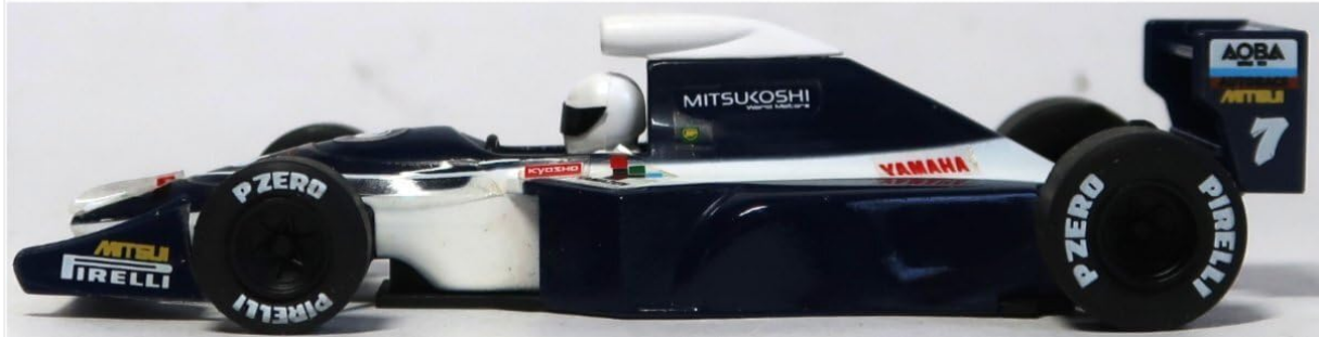
Image: Side view of the Brabham Yamaha BT60Y model.