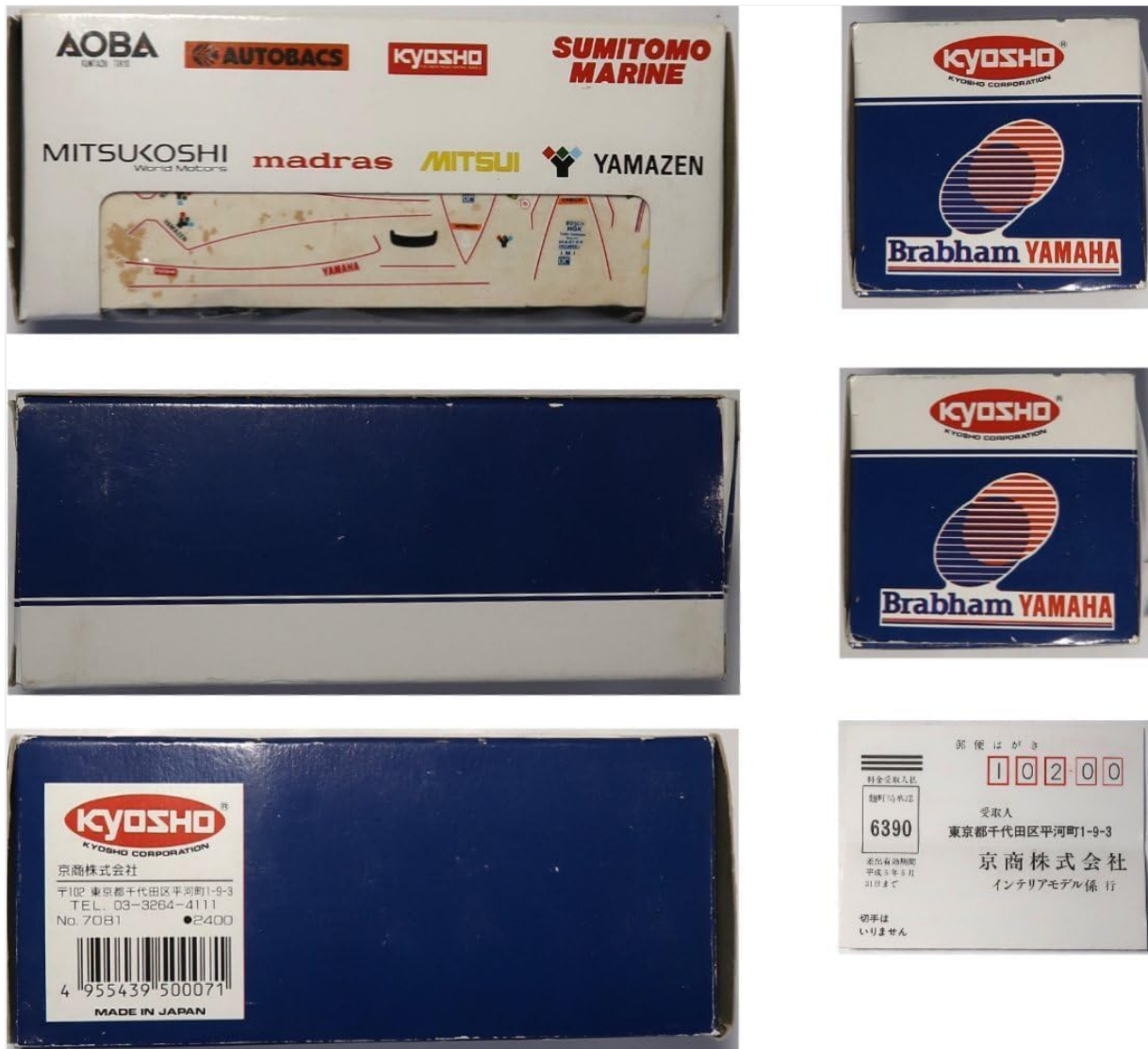
Image: Product packaging for the Brabham Yamaha BT60Y model.