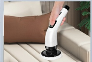
Fiber brush polishing/waxing,ect

Image: IPX5 Waterproof Rating Warning. This image illustrates the IPX5 waterproof rating, showing the scrubber being splashed with water (green checkmark) and a clear warning against submerging the entire unit in water (red cross). This highlights the importance of not fully immersing the device.