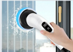
Sponge brush glass/tile/car wash,etc