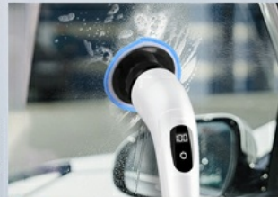
Cloth brush mirror/glass/car surface,etc