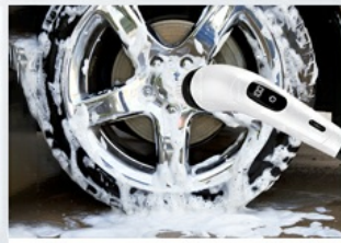
Small brush fan net/car wheel hub,etc