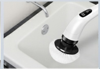
Hair brush bathtub/basin/toilet,etc