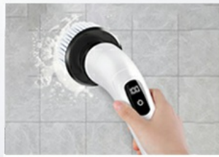
Pacific brush flat tile/floor/window,etc