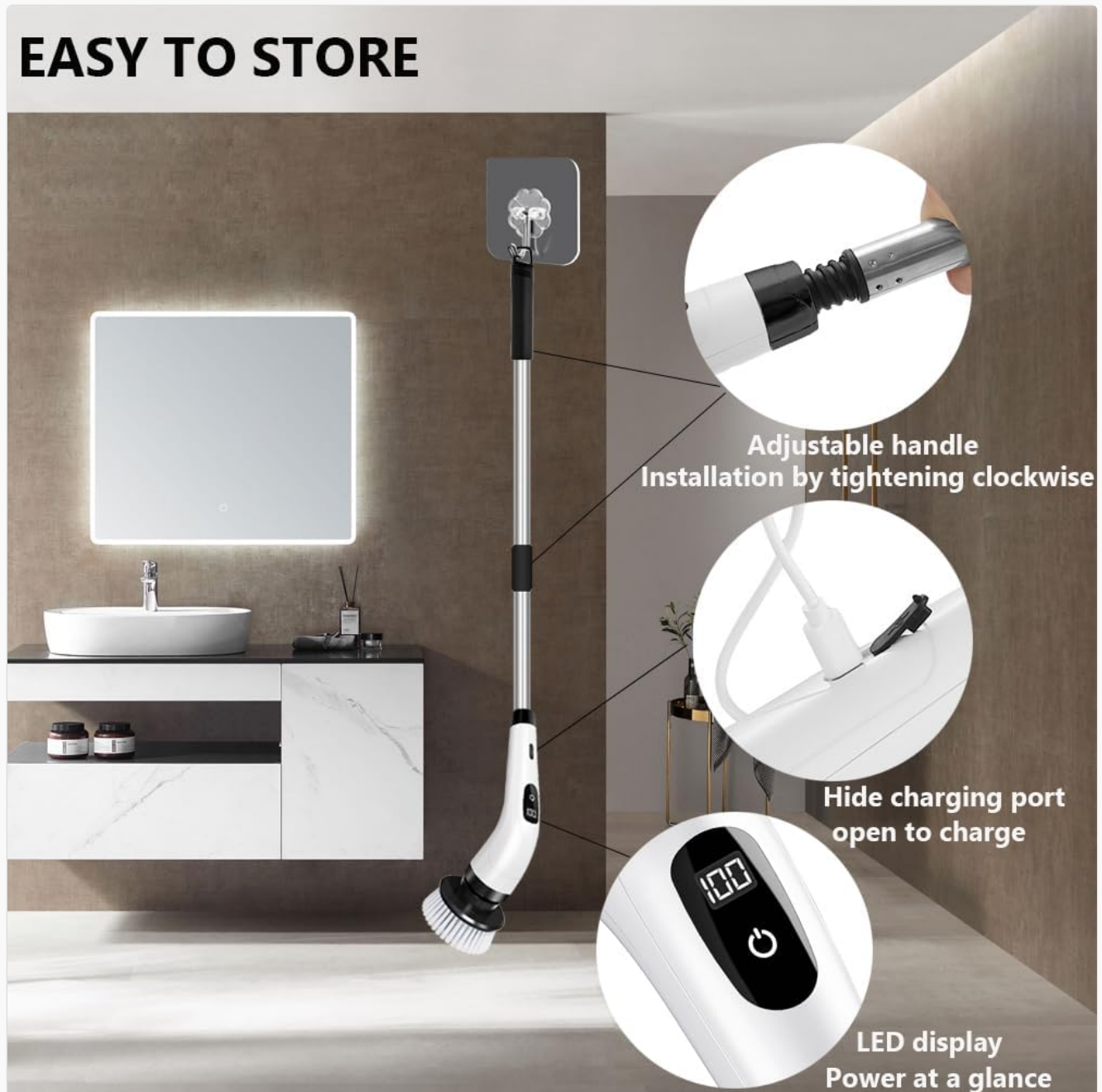
Image: Easy Storage. This image demonstrates how the electric spin scrubber can be easily stored using the included wall mount hook, showing the adjustable handle and the charging port location.