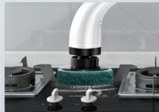
Scouring pad stove/bathroom tile/wall,etc