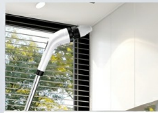
Pointed brush atcrevices and corners,ect