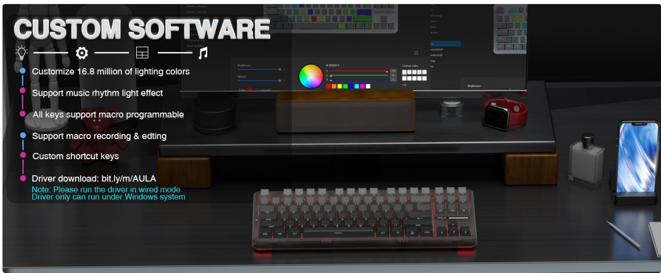
Image: The AULA F87 Pro keyboard showcasing its 16.8 million RGB backlighting with various effects.