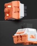
Image: The AULA F87 Pro keyboard with keycaps and switches removed, illustrating its hot-swappable PCB design and included Space Gold switches.

Space Gold Switches smooth, quiet, quick response