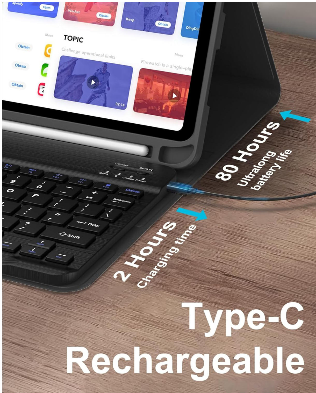
Image: Shows the keyboard being charged via a Type-C cable, indicating a 2-hour charging time for 80 hours of battery life.