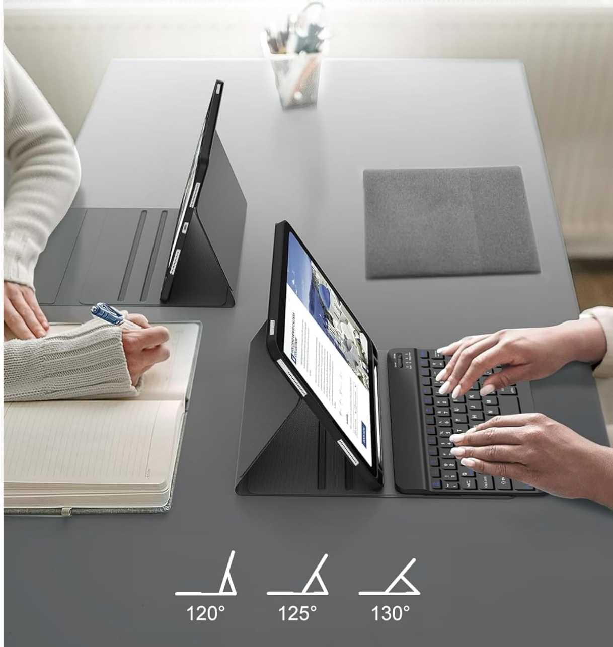
Image: Illustrates the three adjustable viewing angles (120°, 125°, 130°) supported by the case's non-slip grooves.