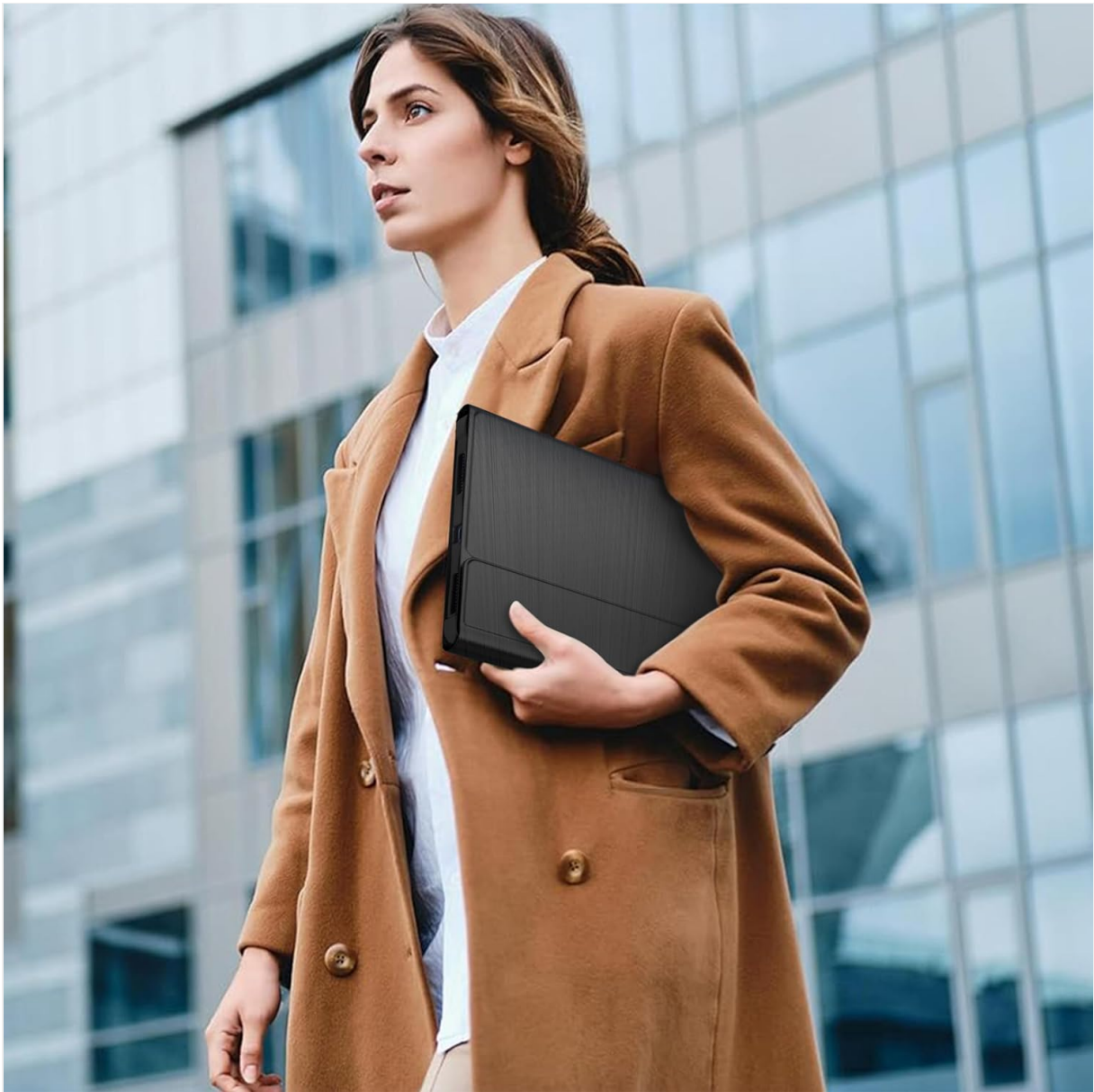
Image: The iPad case showcasing its protective design and precise cutouts for easy installation and access to all functions.