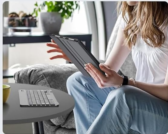
Image: Demonstrates the magnetic detachment of the keyboard from the case, highlighting its versatility.