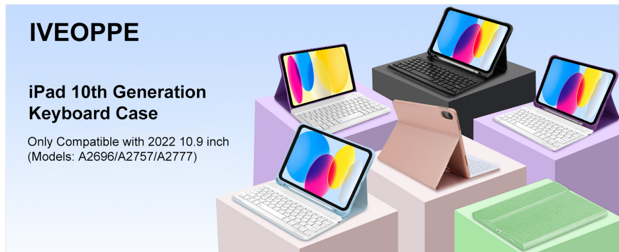
Image: The IVEOPPE iPad 10th Generation Case with Keyboard, showcasing its design and functionality.

This manual provides detailed instructions for the IVEOPPE iPad 10th Generation Case with Keyboard. It covers compatibility, setup, operation, maintenance, and technical specifications to ensure optimal use of your device accessory.