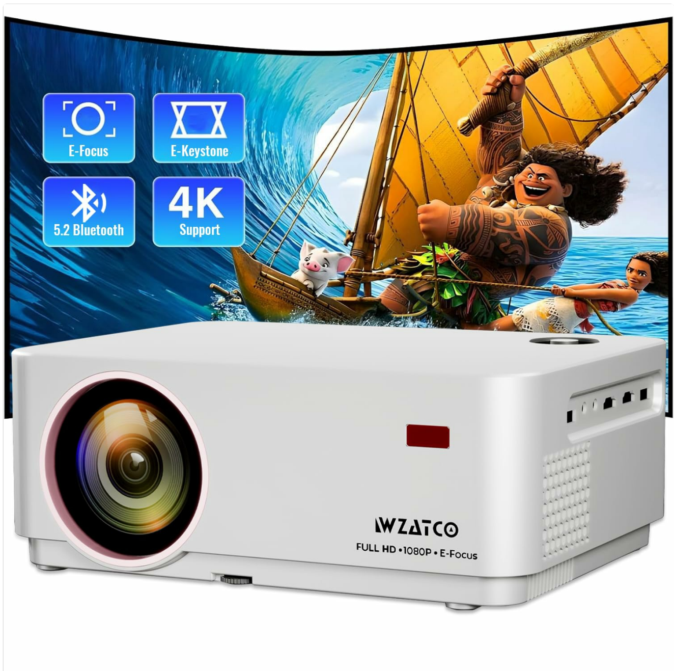
Figure 1: WZATCO Yuva Elite Projector