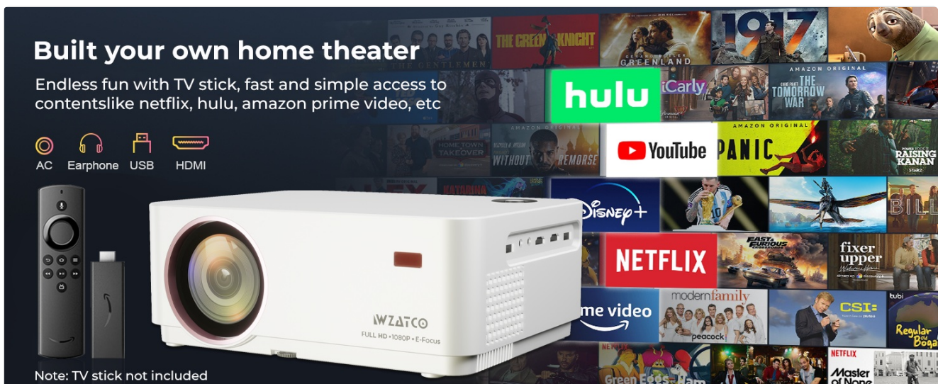
Figure 4: Multimedia Connectivity Options