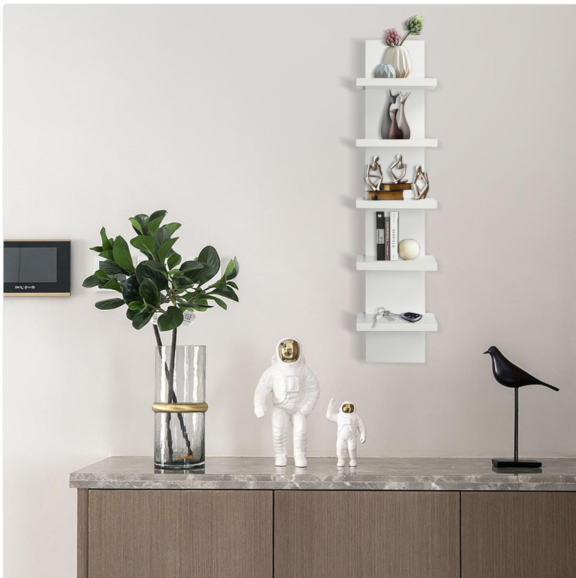
Figure 5: Shelf in Use. This image shows the shelf unit holding various decorative items, demonstrating its intended use in a home environment.