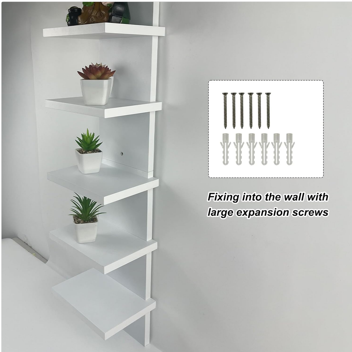
Figure 4: Secure Wall Mounting. This image demonstrates the shelf unit fixed to the wall using expansion screws, ensuring stability.