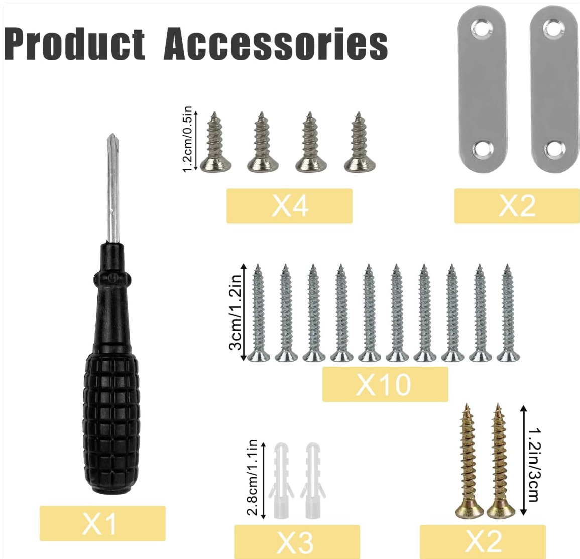
Figure 1: Included Hardware Components. This image displays the various screws, wall anchors, and a screwdriver provided for assembly and installation.