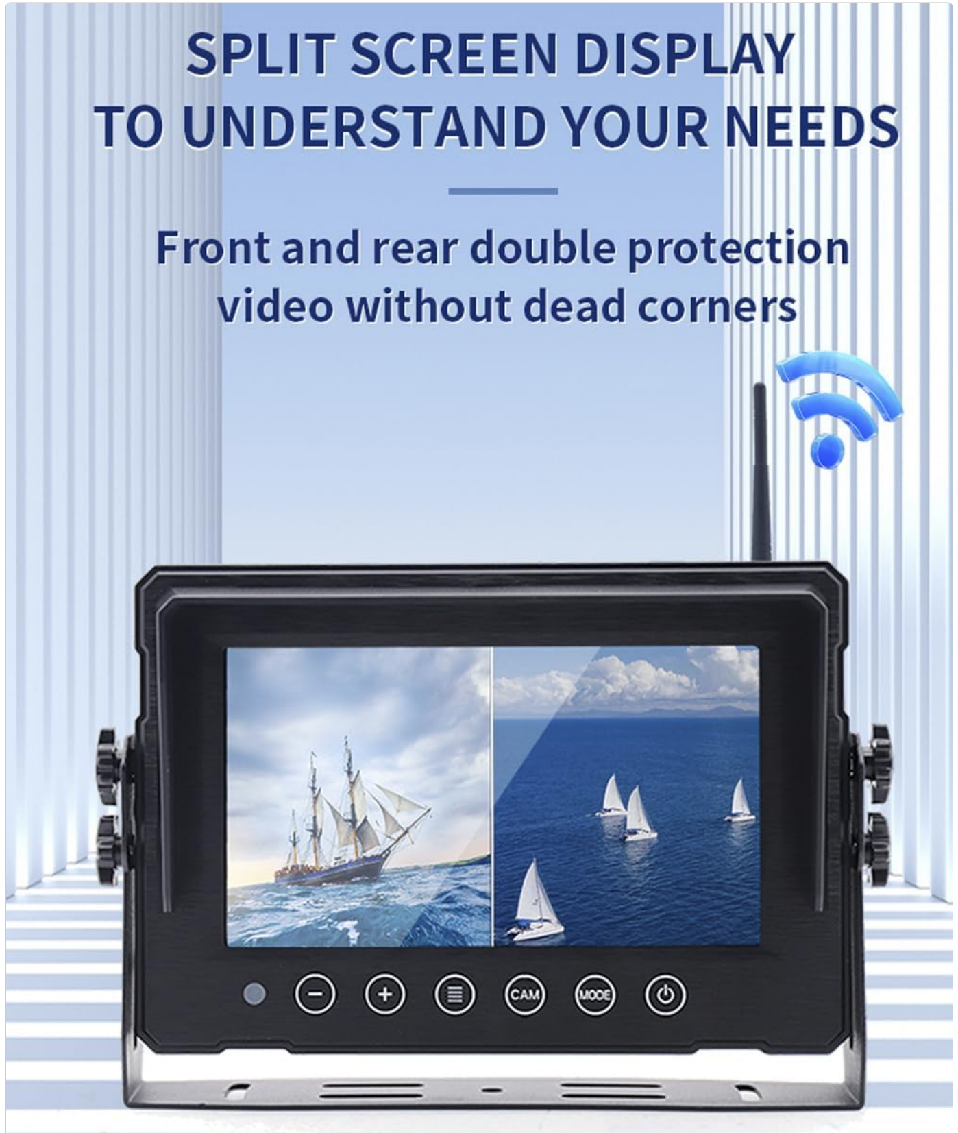
Image: The monitor screen showing a split view, demonstrating its capability to display multiple camera feeds simultaneously.

Use the "MODE" button on the monitor to cycle through available display modes. The "CAM" button can be used to switch between individual camera views in full-screen mode.