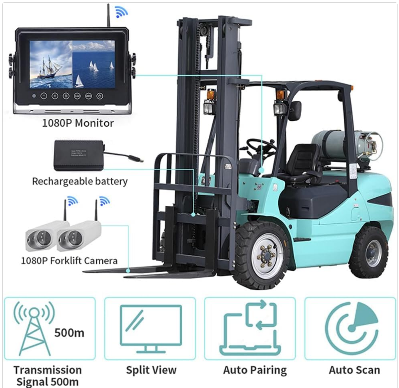
Image: A visual representation of the camera system components installed on a forklift, illustrating the wireless connection and placement. Once both the camera and monitor are powered on, they will automatically pair via the digital wireless signal. No manual pairing is typically required.

forklift's 12V DC cigarette lighter socket. Alternatively, the monitor can be hardwired if preferred (professional installation recommended for hardwiring).