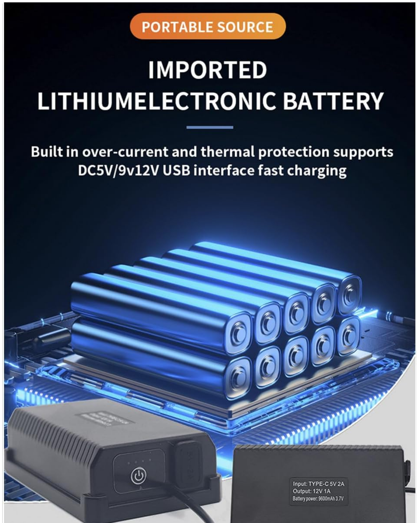
Image: Detailed view of the portable battery source, highlighting its lithium electronic battery and charging specifications.

The 9600mAh battery bank can be recharged using the provided USB charging cable. Connect the USB cable to a standard USB power adapter (not included) or a USB port on the cigarette lighter charger. A full charge provides approximately 15-17 hours of camera operation.