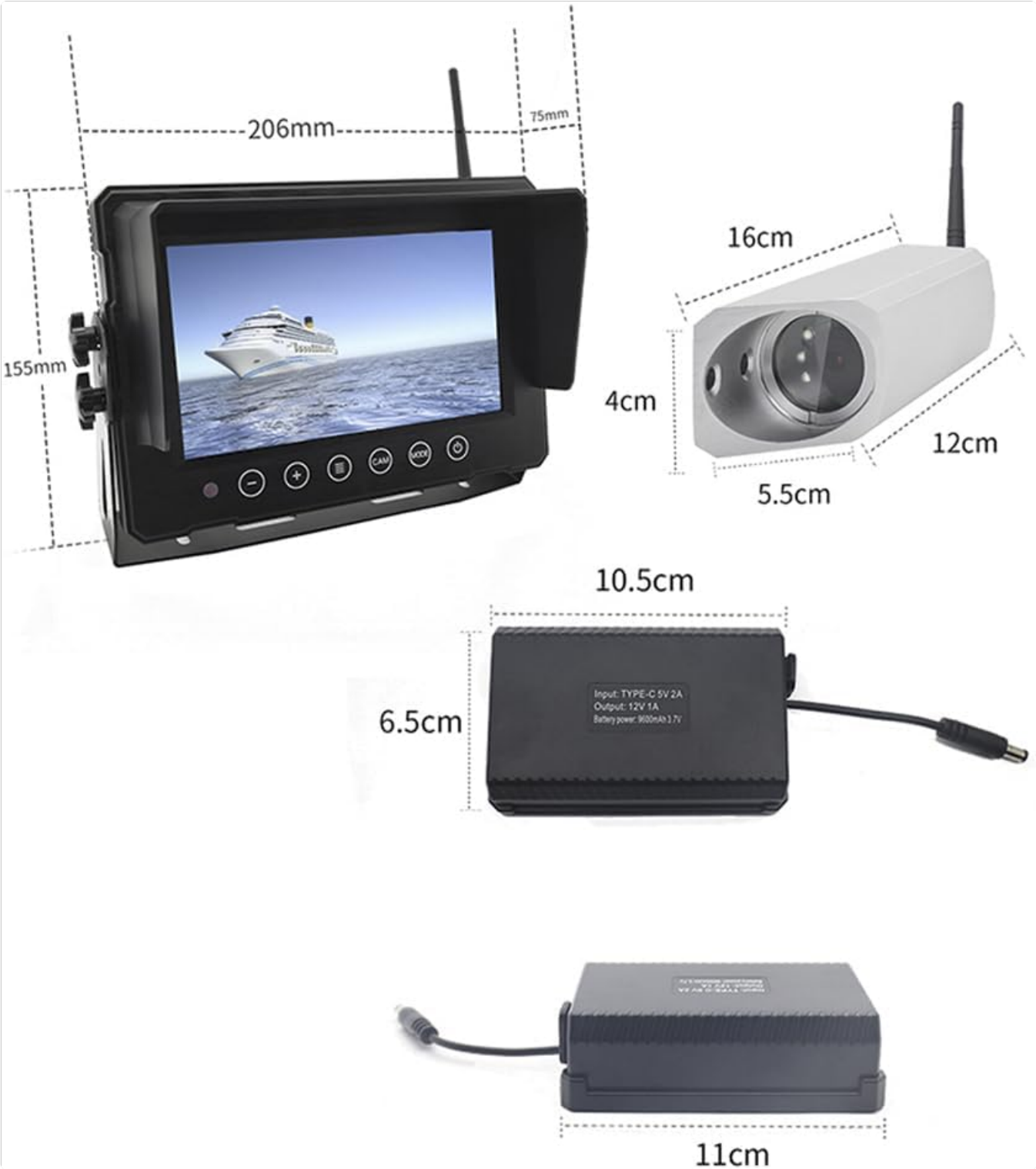
Image: Detailed dimensions of the monitor, camera, and battery bank for reference.