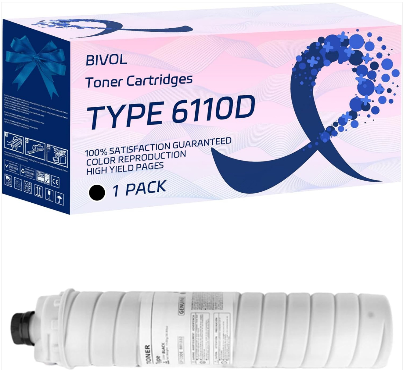
Image 1.1: The BIVOL TYPE 6110D Toner Cartridge packaging and the cartridge unit.