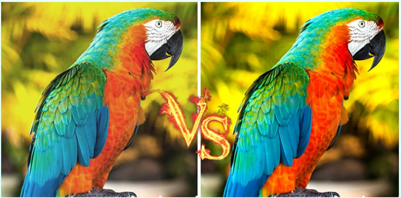
Image 5.2: Example of color print quality, influenced by the overall toner system.