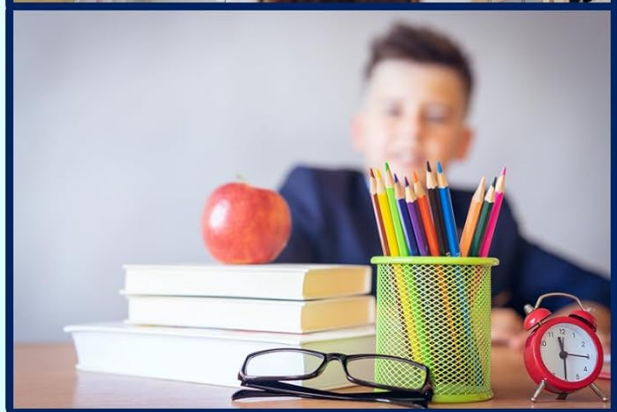
Image 5.3: Various environments where the toner cartridge can be effectively used.