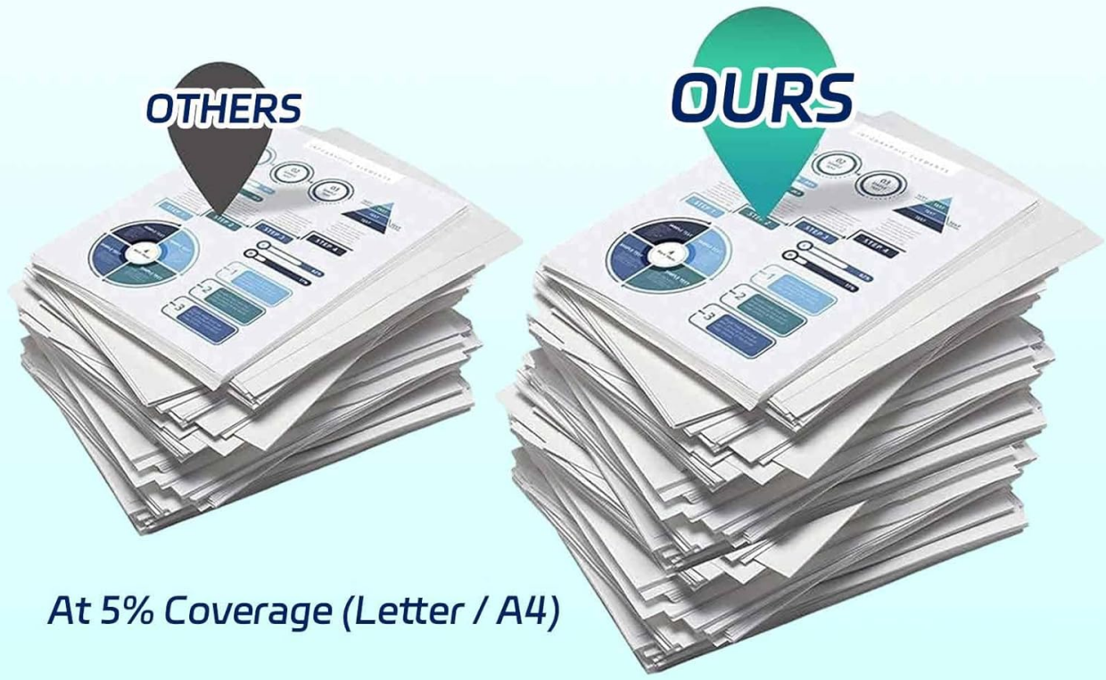
Image 3.1: Comparison illustrating the high page yield of BIVOL toner cartridges compared to others.