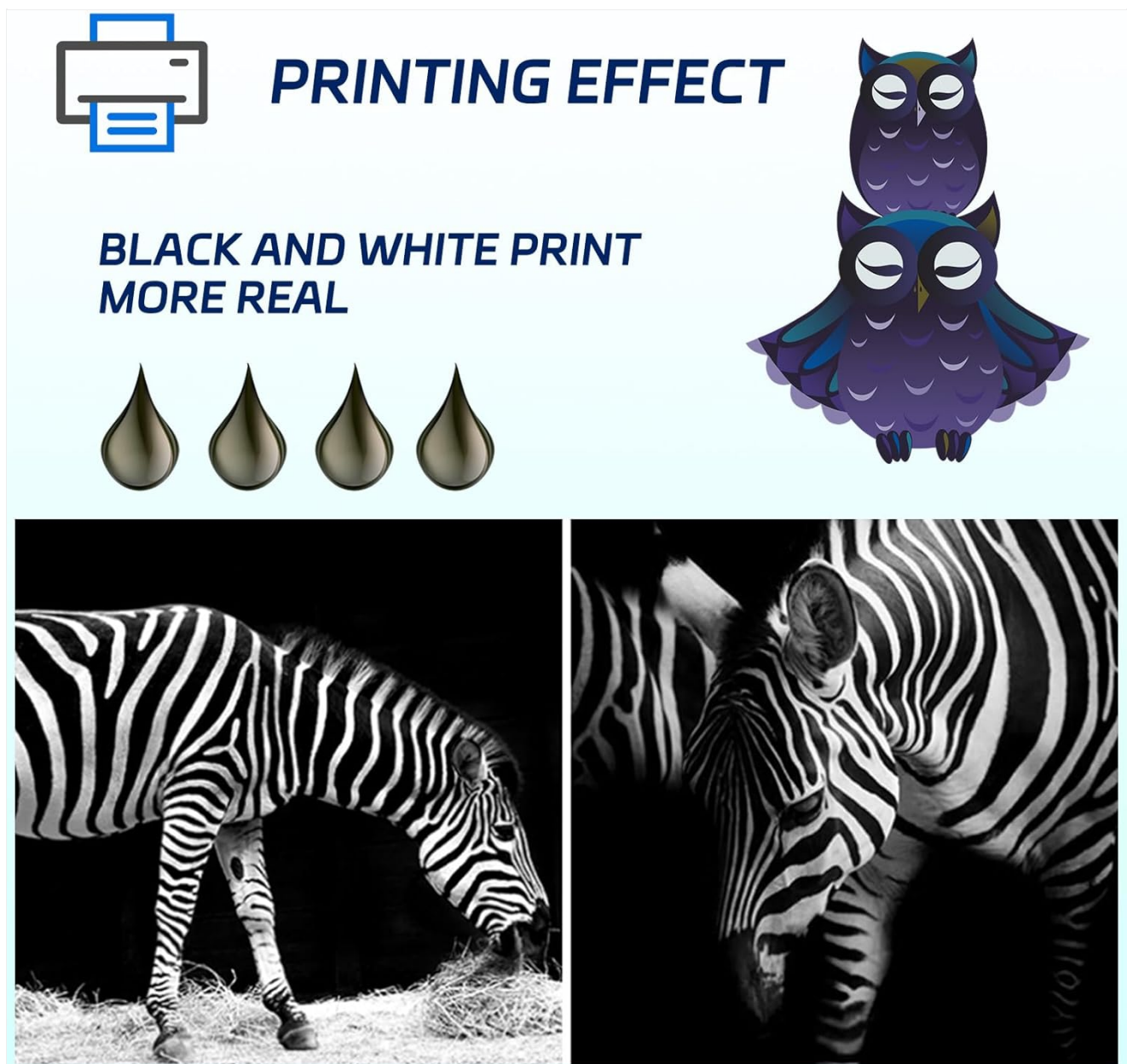
Image 5.1: Example of black and white print quality achieved with the toner cartridge.

The cartridge ensures sharp and clear black text and images. For best results, ensure your printer settings are configured for black and white printing.