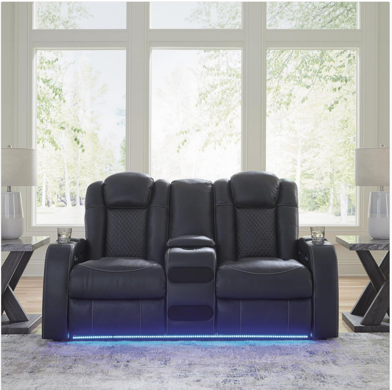
Image 5.6: The loveseat with its ambient blue LED lighting illuminated.