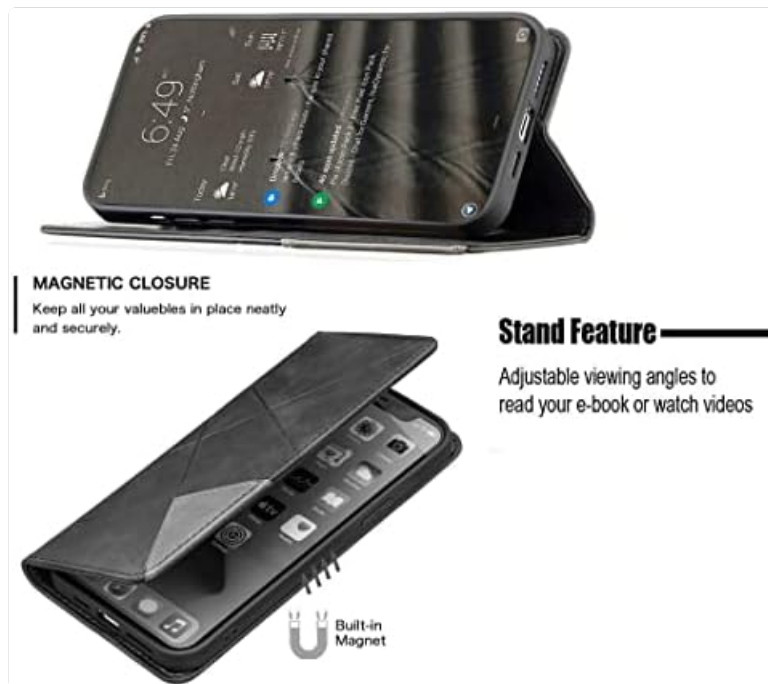
Figure 2: The phone case in use, highlighting its magnetic closure for secure storage and the integrated kickstand for hands-free viewing.