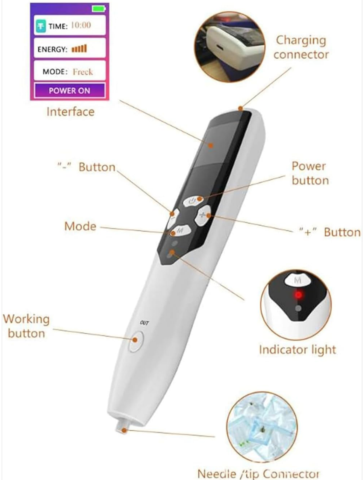
Figure 1: PAA Plasma Pen Q102 with key components labeled. This image shows the device's main body, power button, mode button, energy adjustment buttons, working button, indicator light, charging connector, and needle/tip connector.

P-Plasma is induced into tissues for heat,sterilization, acne,wrinkle,spot removal and skin lifting