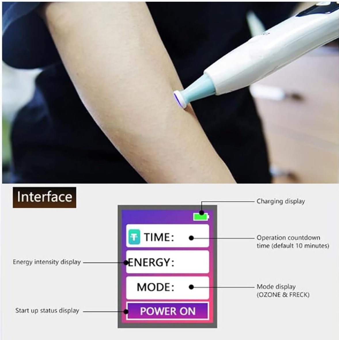
Figure 3: Detailed view of the PAA Plasma Pen Q102 interface. This image highlights the charging display, operation countdown timer (default 10 minutes), energy intensity display, mode display (OZONE & FRECK), and start-up status display (POWER ON).

Familiarize yourself with the device interface and controls before beginning treatment.