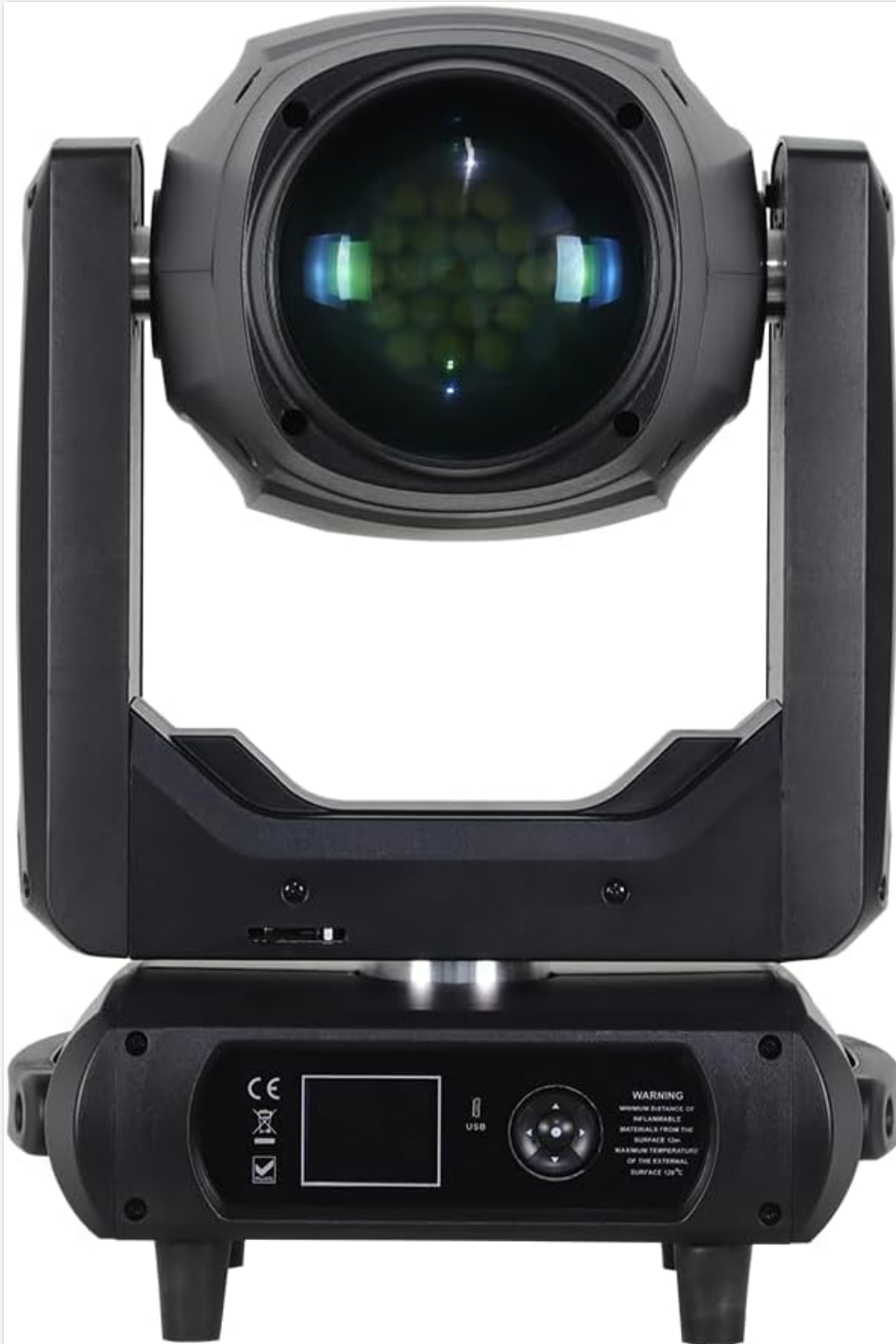
Image 4.1: Front view of the fixture, showing the lens and control panel.

The LCD touch screen provides a user-friendly interface for navigation and programming. Use the control buttons to adjust settings and select modes.