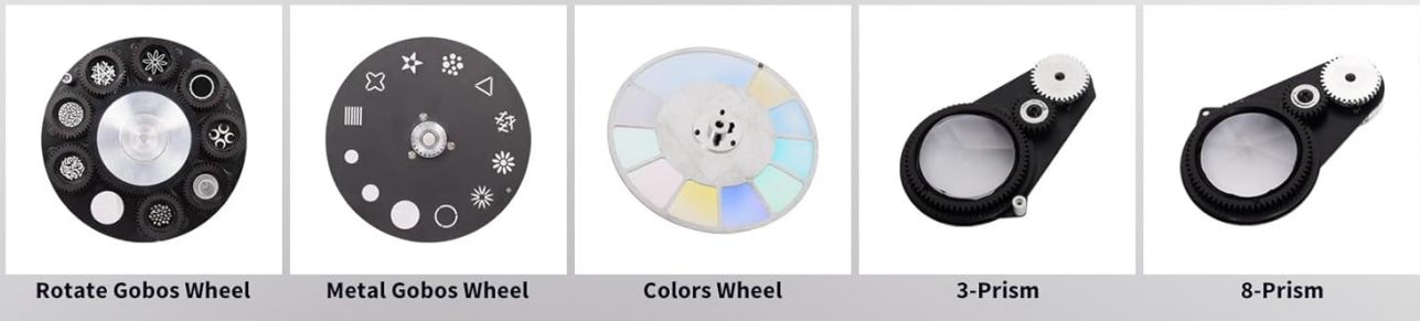
Image 4.3: Detailed view of the rotating gobo wheel, metal gobo wheel, color wheel, 3-prism, and 8-prism components.