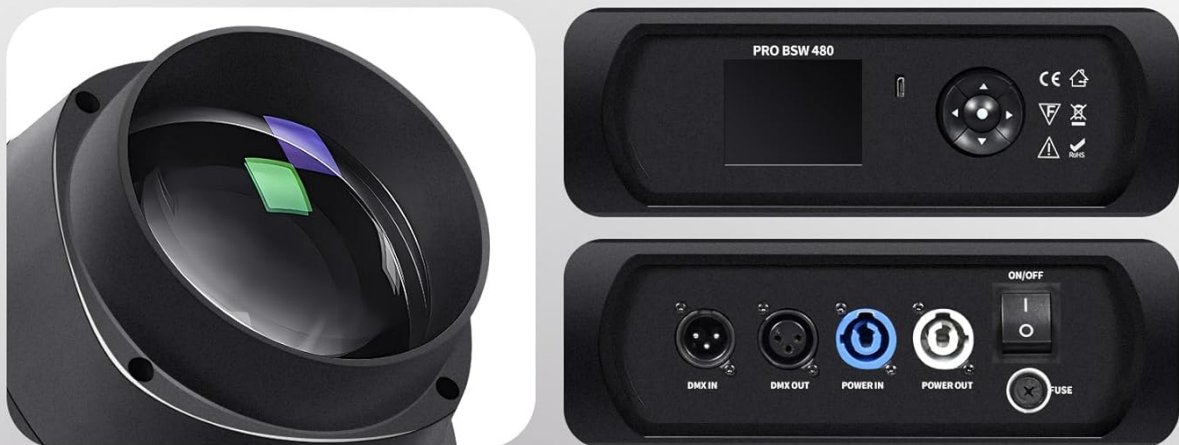
Image 3.1: Rear view showing DMX IN/OUT, Power IN/OUT, and ON/OFF switch.

The unit features DMX IN, DMX OUT, Power IN, and Power OUT ports for daisy-chaining multiple fixtures. An ON/OFF switch and fuse holder are also located on the rear panel.