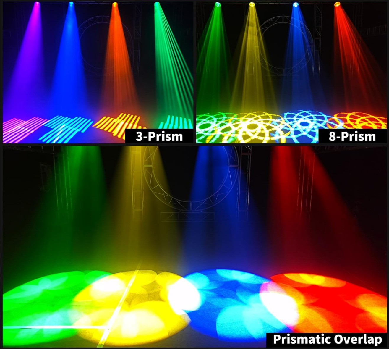
Image 4.4: Examples of 3-Prism, 8-Prism, and Prismatic Overlap effects.