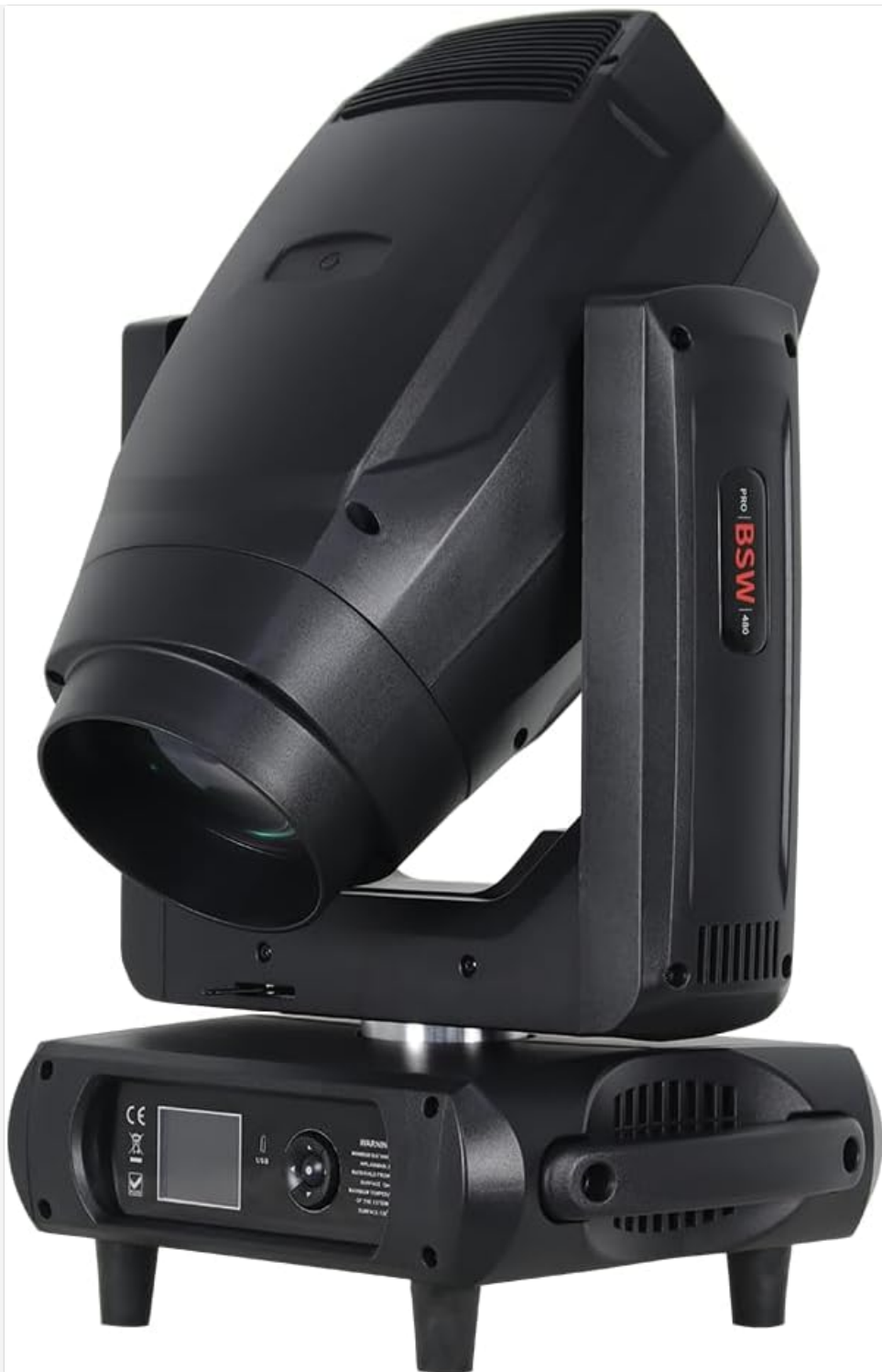
Image 1.1: DJCLUB PRO480BSW 400W LED Moving Head Light (Side View)