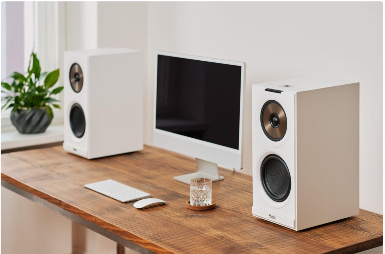
Image: Teufel STEREO M 2 speakers set up on a desk, suitable for a desktop audio system.