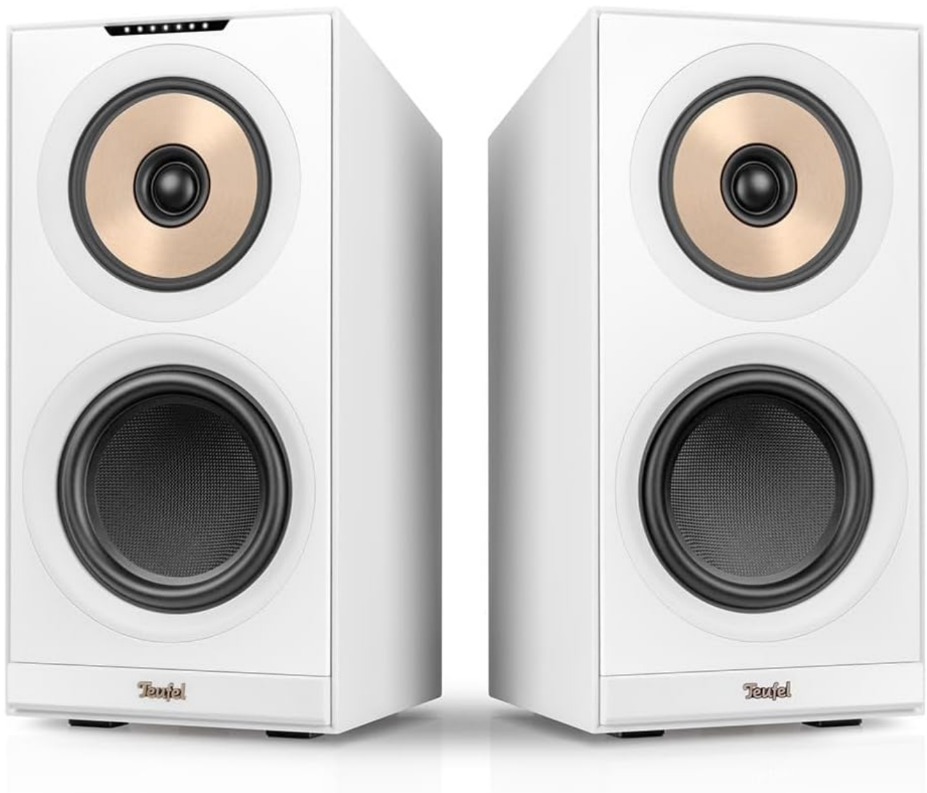
Image: Front view of the Teufel STEREO M 2 active bookshelf speakers in white.