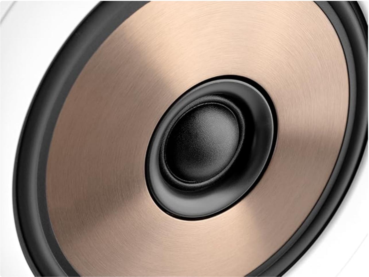
Image: A close-up view of the SCA-Coaxial-Chassis driver, highlighting its design for precise sound reproduction.