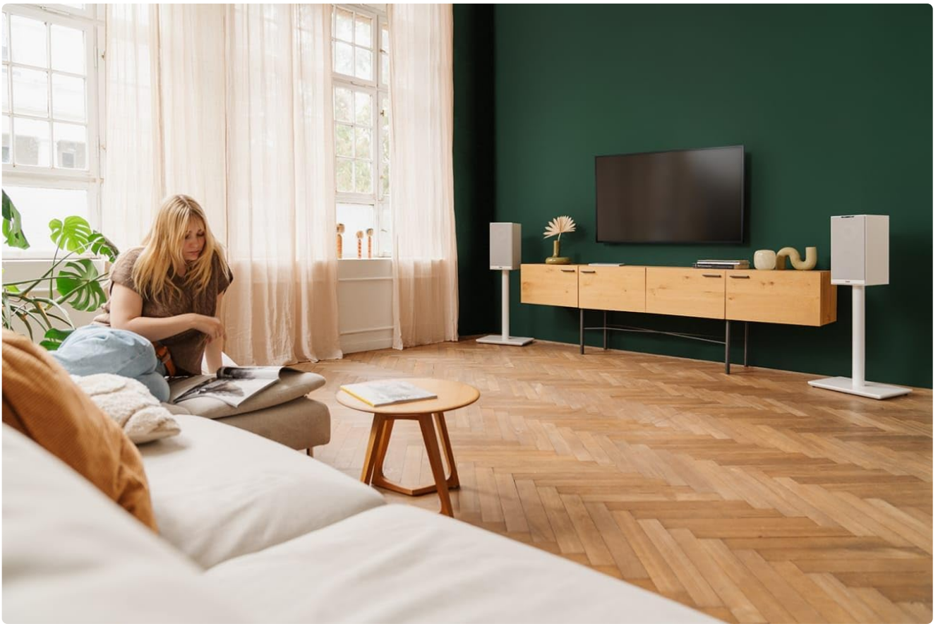
Image: Teufel STEREO M 2 speakers positioned on stands in a living room environment.