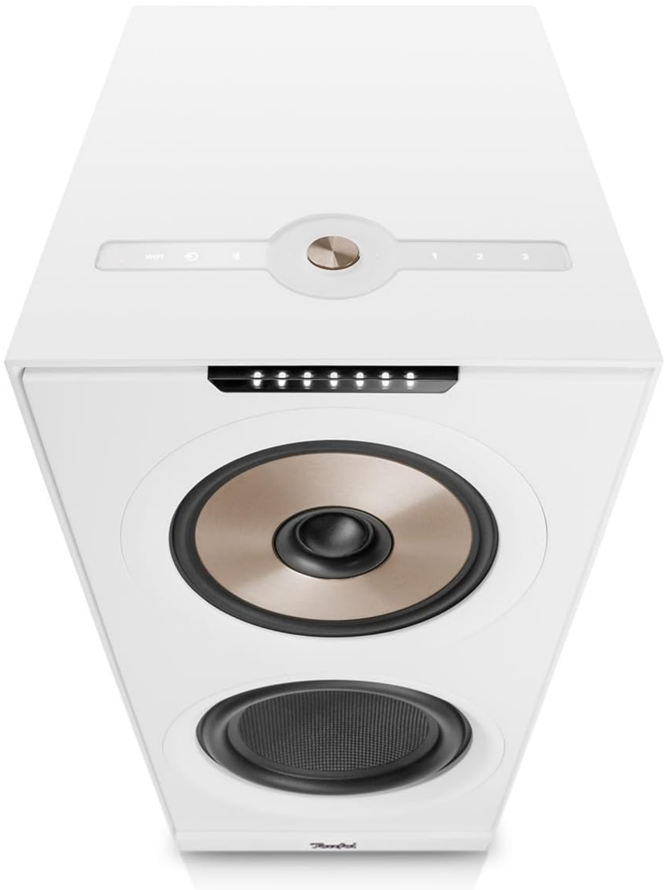
Image: Top view of the Teufel STEREO M 2 speaker, highlighting the integrated control panel with a proximity sensor for illumination.