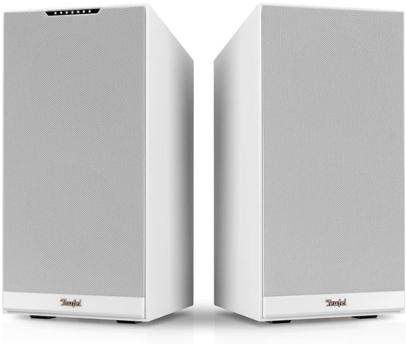
Image: Teufel STEREO M 2 speakers with their protective grilles installed.