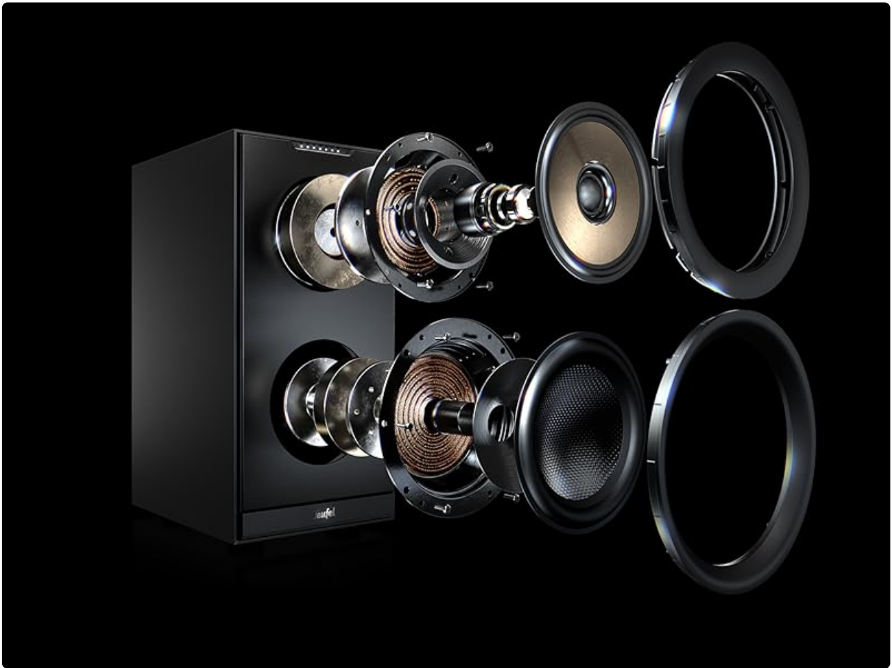
Image: An exploded view diagram illustrating the internal components of the Teufel STEREO M 2 speaker, including the 3-way system and drivers.