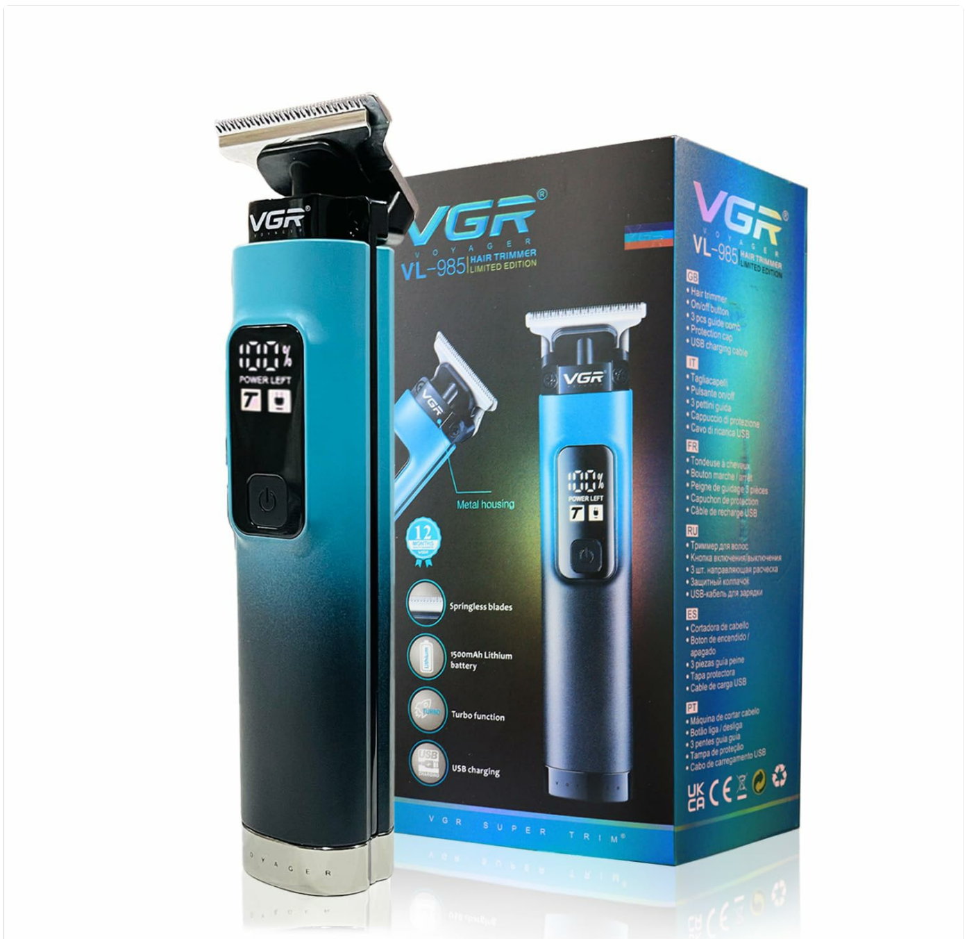
Image: The VGR VL-985 hair clipper shown alongside its product packaging, highlighting its sleek design and branding.