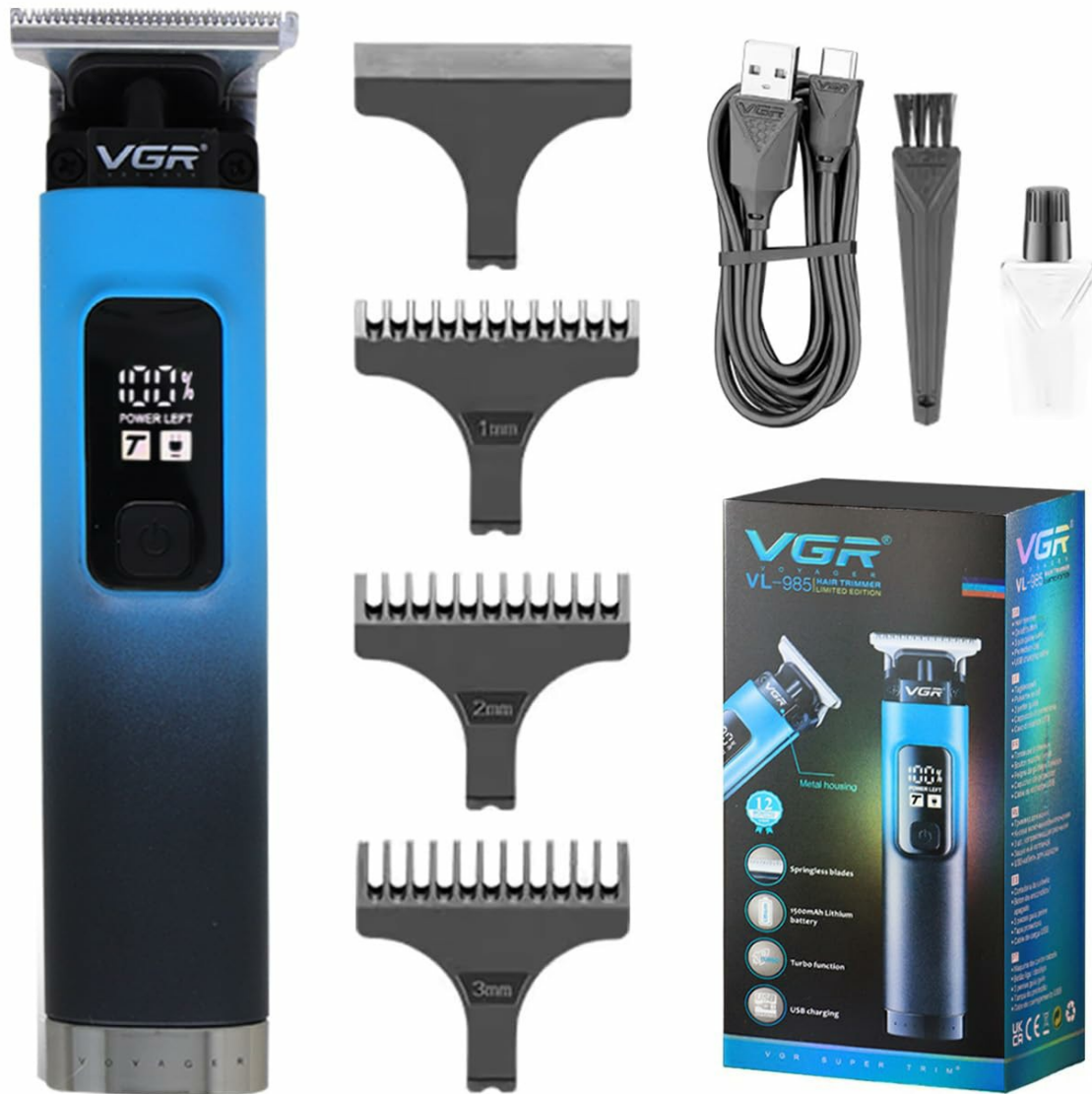
Image: All components included with the VGR VL-985 hair clipper, neatly arranged, showing the clipper, three guide combs, blade protection cap, USB cable, cleaning brush, lubricating oil, and the product box.