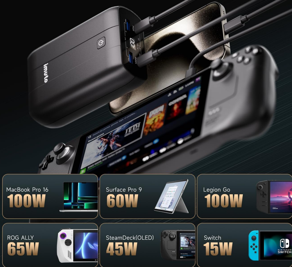
Image: The imuto power bank is shown connected to four different devices (a laptop, a smartphone, a gaming handheld, and another smartphone) via its four ports, demonstrating its 4-in-1 fast charging capability. Below the power bank are icons of various devices like MacBook Pro, Surface Pro, Legion Go, ROG Ally, Steam Deck, and Switch, with their respective charging wattages.