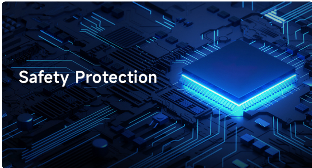
Image: A stylized image of a circuit board with a glowing blue chip, symbolizing the internal safety protection mechanisms of the power bank designed to prevent overcharge, over-discharge, and other electrical issues.