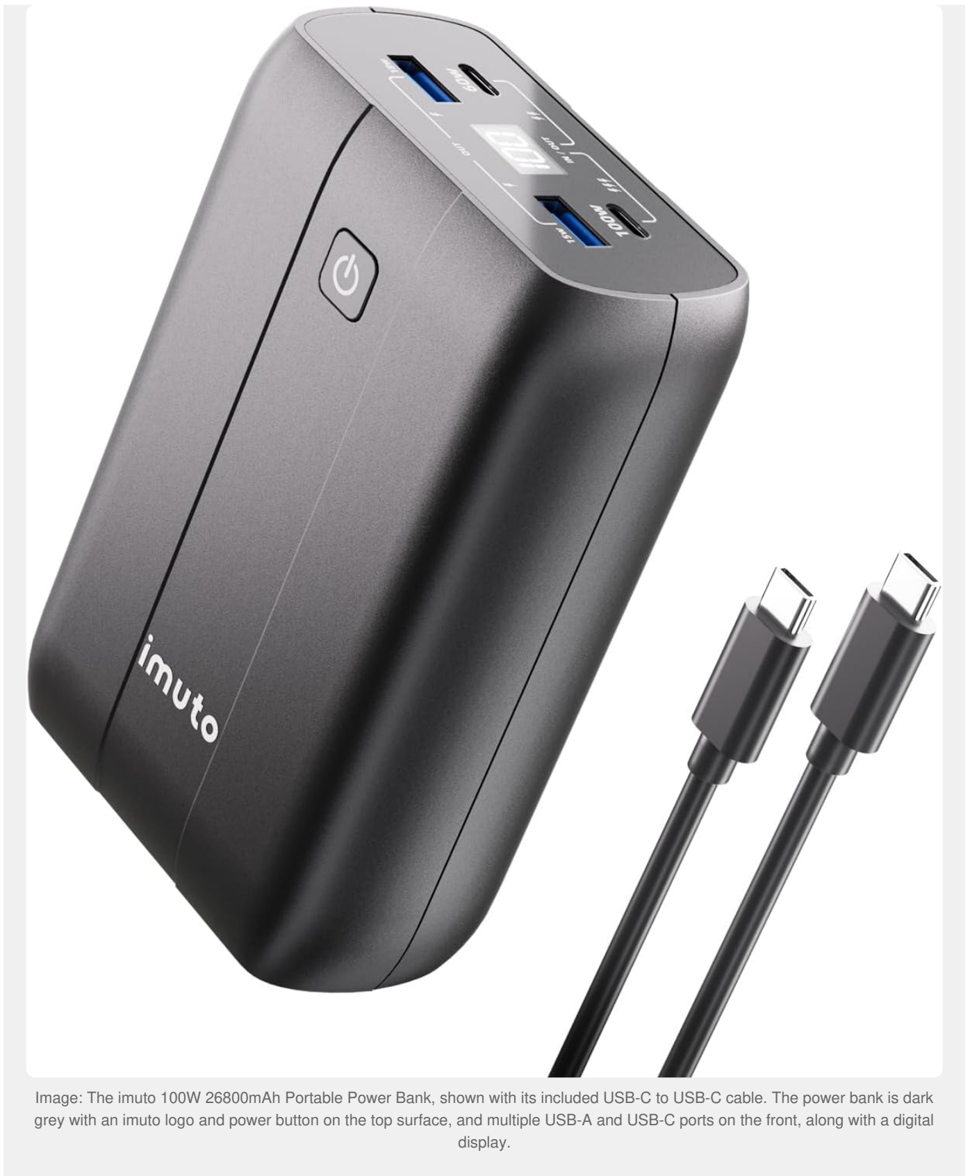
Image: The imuto 100W 26800mAh Portable Power Bank, shown with its included USB-C to USB-C cable. The power bank is dark grey with an imuto logo and power button on the top surface, and multiple USB-A and USB-C ports on the front, along with a digital display.