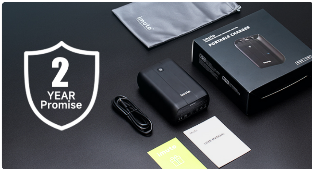
Image: A flat lay of the imuto power bank, its packaging box, USB-C cable, and user manual, with a prominent shield icon displaying "2 YEAR Promise", indicating the product's warranty period.

For warranty claims or technical support, please refer to the contact information provided on the imuto official website or the product packaging.