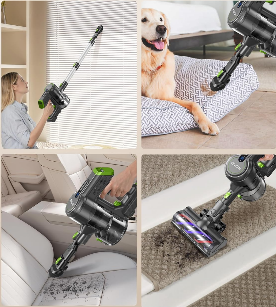
Figure 4: The vacuum's versatile design allows for easy conversion to a handheld unit and use with various attachments for comprehensive cleaning.