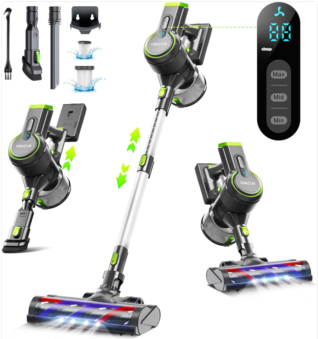
Figure 2: The QikCln QC-VC06 Cordless Vacuum Cleaner fully assembled, ready for use.