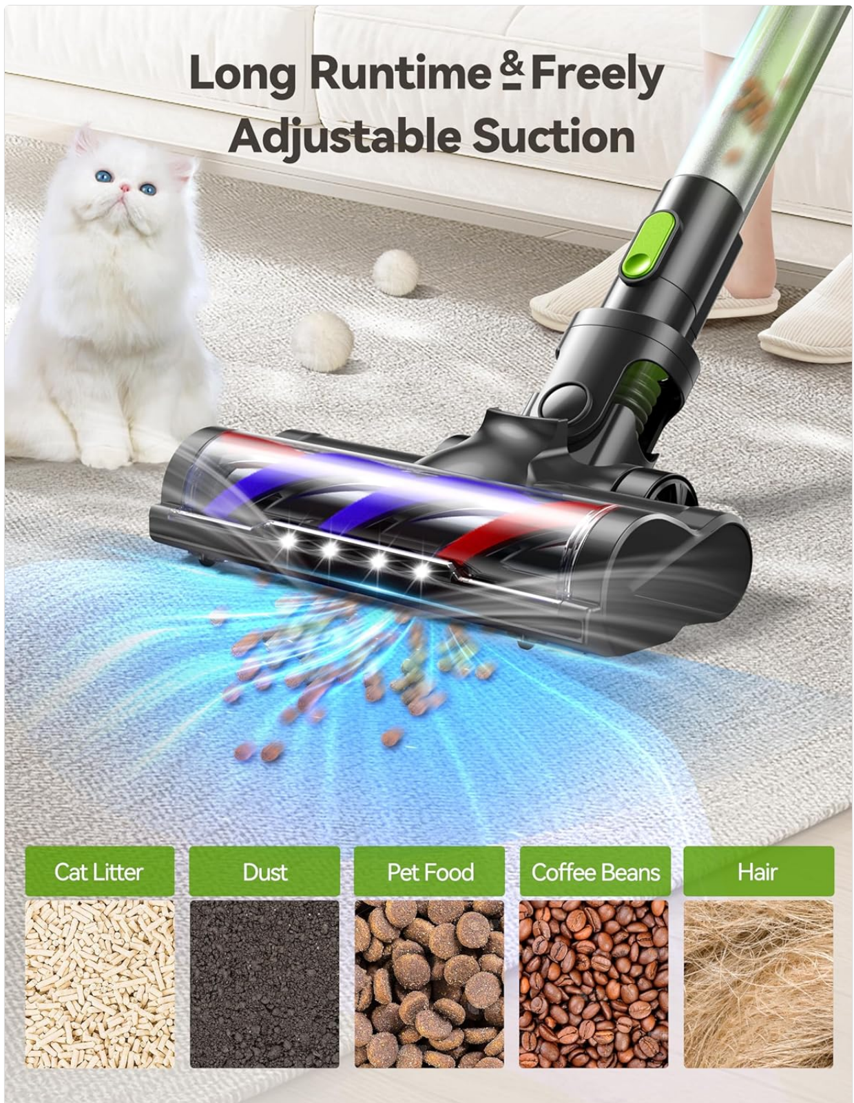
Figure 5: Powerful suction effectively removes various types of debris from carpets, including pet hair and larger particles.