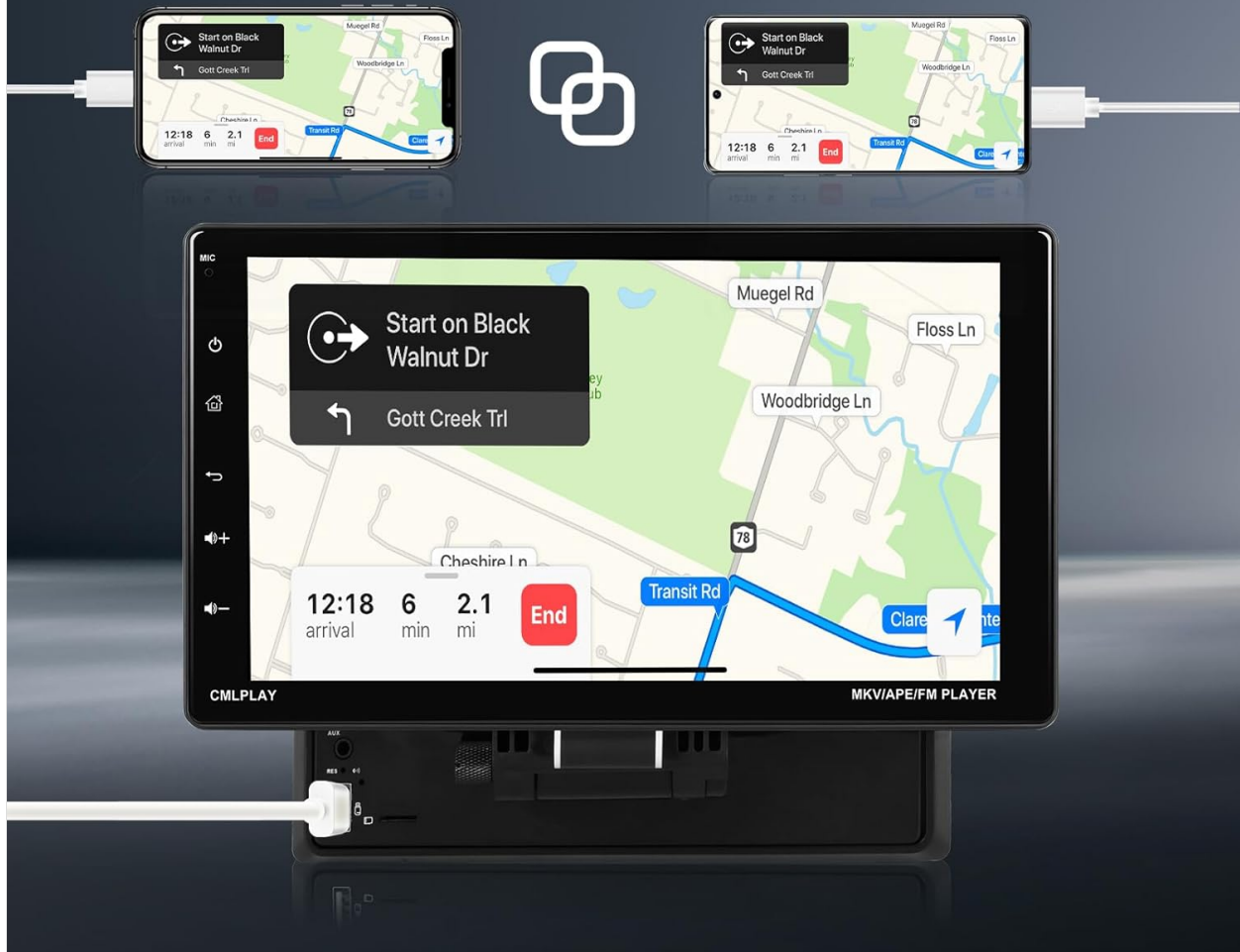
Image: A smartphone connected via USB cable to the car stereo, with the phone's navigation screen mirrored onto the larger car stereo display.

By the USB data cable, you can synchronize your phone's content to the screen.