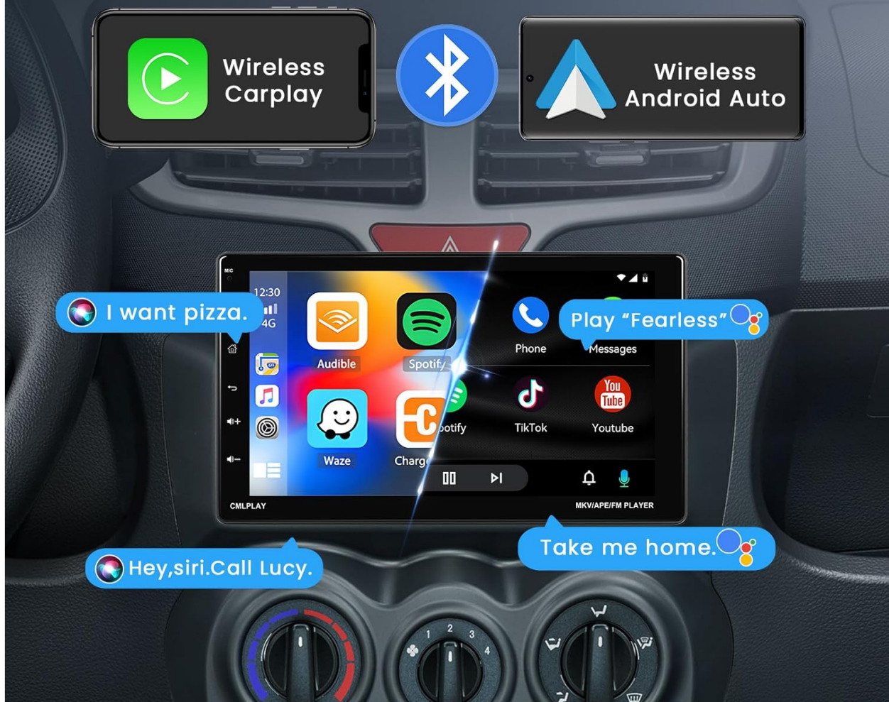
Image: The car stereo screen showing a grid of application icons, including navigation, music streaming, and communication apps, demonstrating Wireless Carplay and Android Auto functionality. Voice commands like "I want pizza" and "Play 'Fearless'" are depicted.