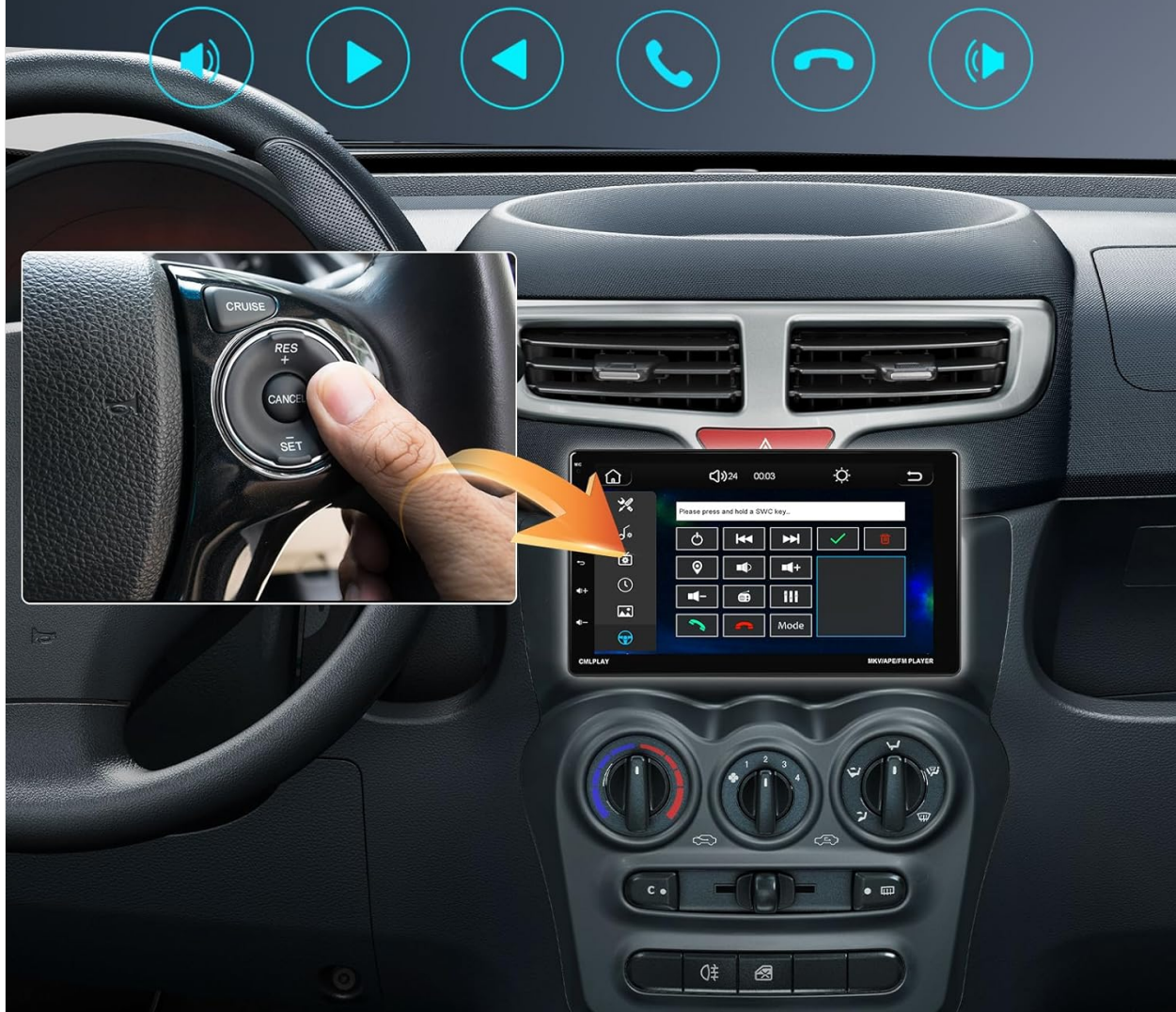
Image: A hand pressing a button on a car's steering wheel, with an inset showing the car stereo screen displaying a menu for programming steering wheel control buttons to various functions like volume, track skip, and call answer/end.