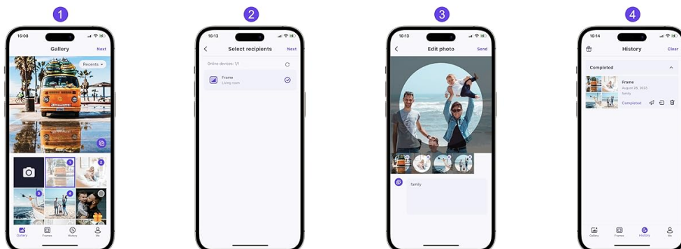
Photo share: select pictures (up to 50 pictures) - select photo frames - edit pictures (adjust focus areas and name photos) - send.

This image details the four-step process for sharing photos via the Uhale app: selecting pictures, choosing frames, editing, and sending.