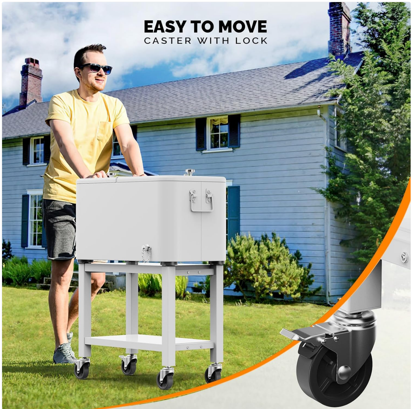
Image: Man pushing the cooler, highlighting the wheels with a lock.

Secure the four wheels to the bottom of the rolling cart frame using the provided hardware. Ensure the two lockable wheels are positioned on the same side for easier access when locking.