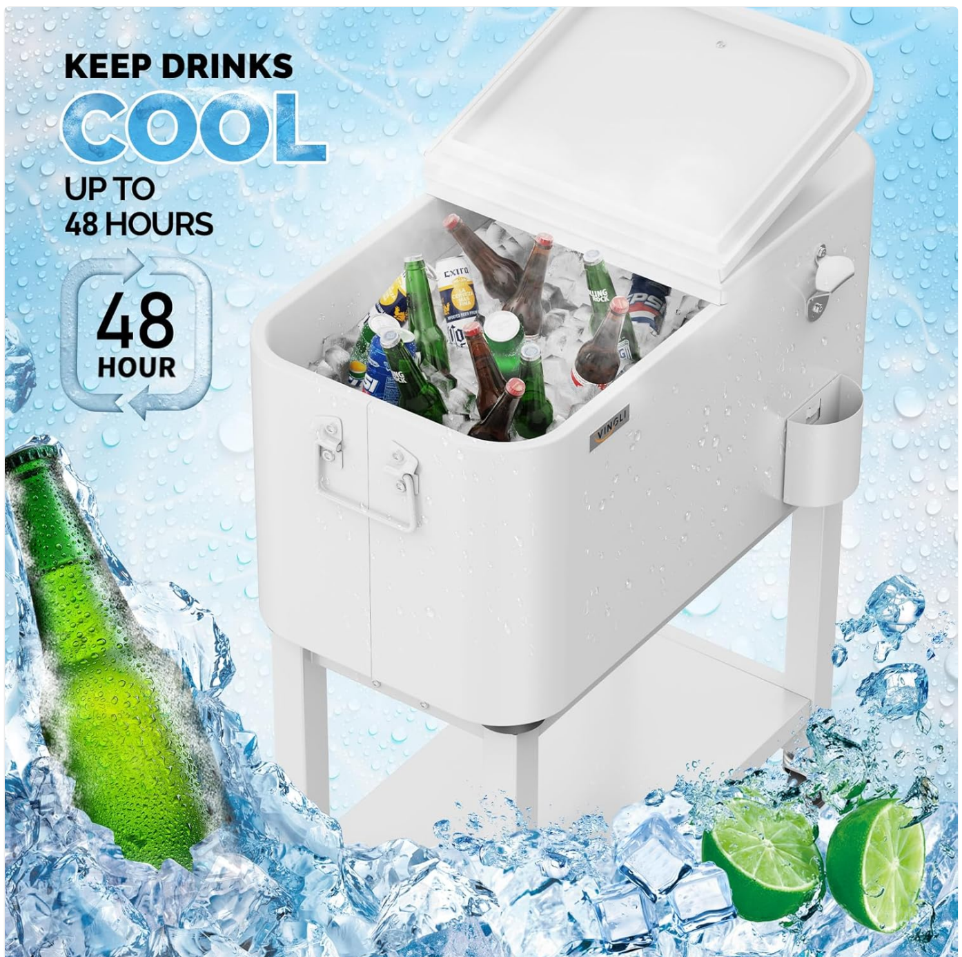
Image: Cooler with ice and drinks, highlighting its 48-hour cooling capability.