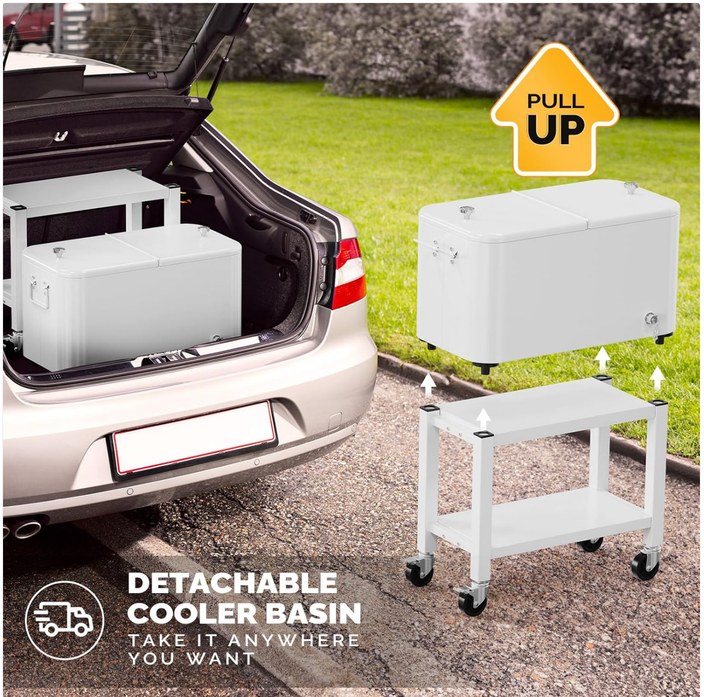
Image: Detachable cooler basin being removed from the cart.