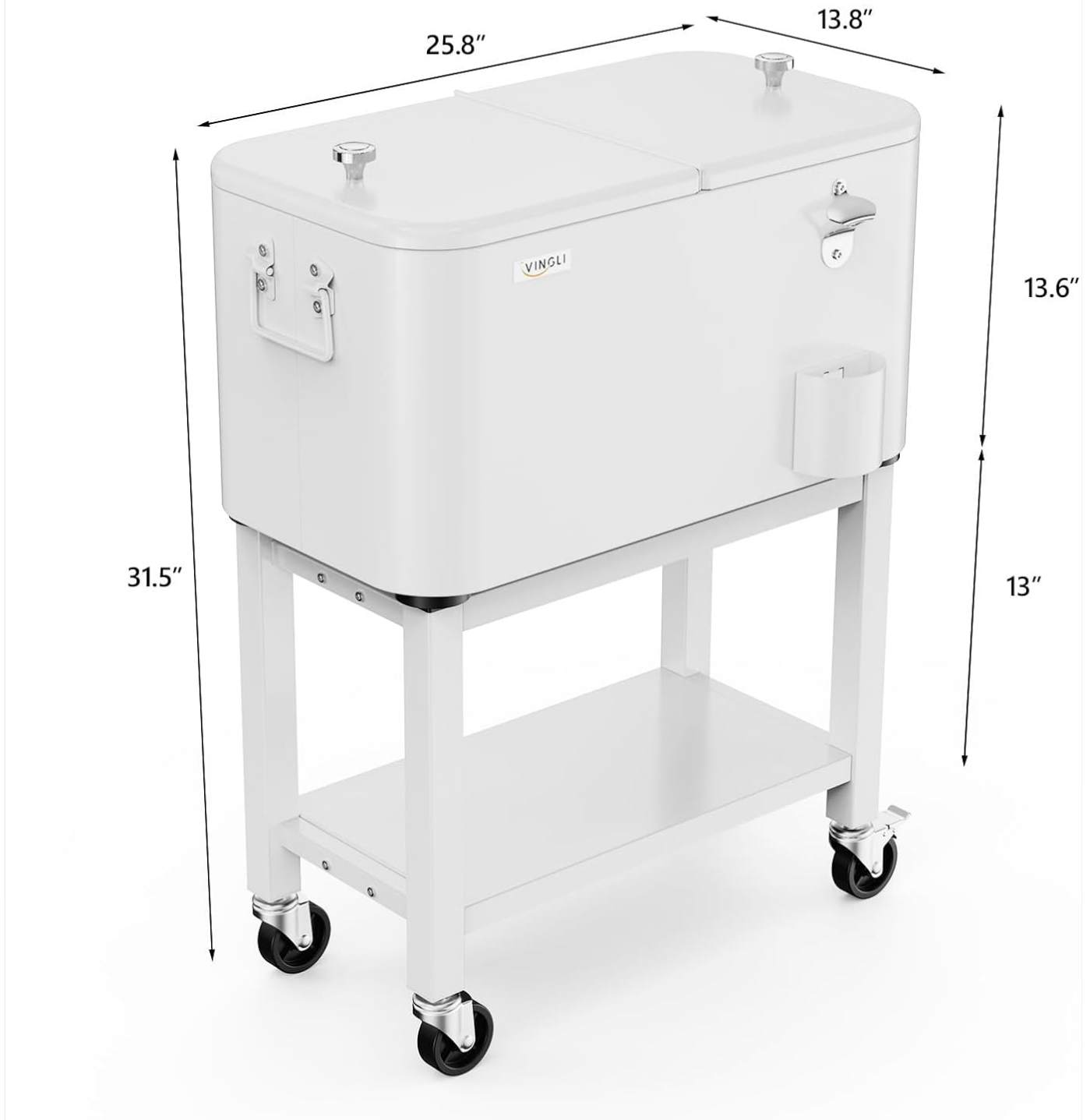
Image: Dimensional diagram of the 60QT Rolling Cooler Cart.