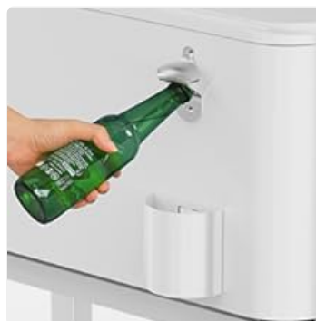
Image: Detail of the bottle opener and cap catcher.

Mount the bottle opener and its accompanying cap catcher to the side of the cooler basin using the designated attachment points and hardware.