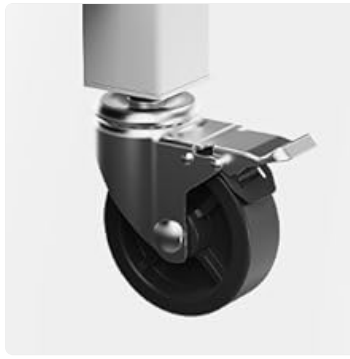
Image: Detail of a lockable caster wheel.