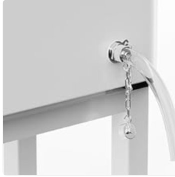
Image: Detail of the drain hole and detachable pipe.

Attach the detachable water pipe to the drain plug on the cooler basin. Ensure it is securely fitted to prevent leaks.