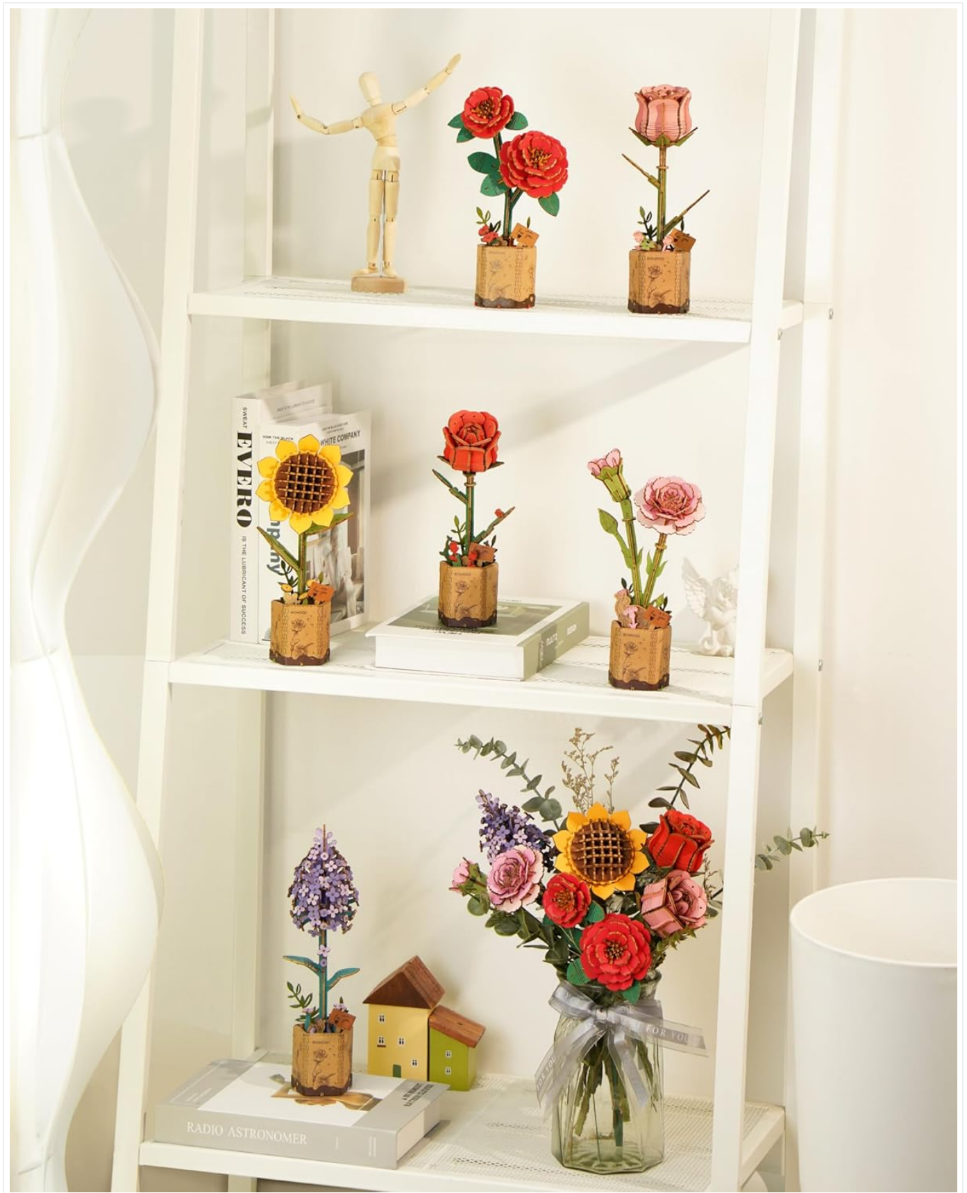
Image: Various rowood wooden flowers displayed in different arrangements, showcasing versatility.