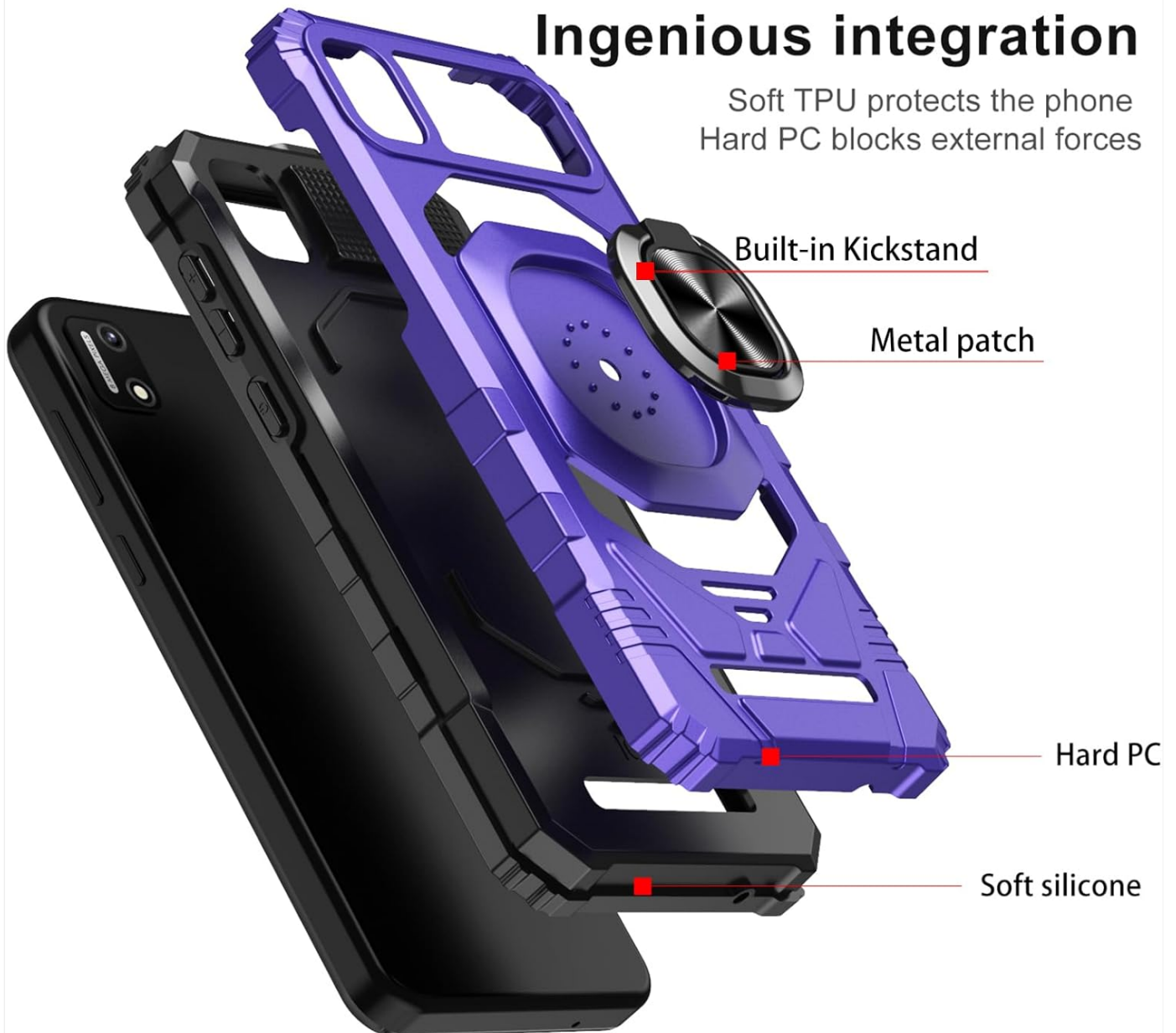
Figure 2: Exploded view illustrating the multi-layered construction of the Ailiber case, including soft TPU, hard PC, and integrated metal patch for the kickstand.