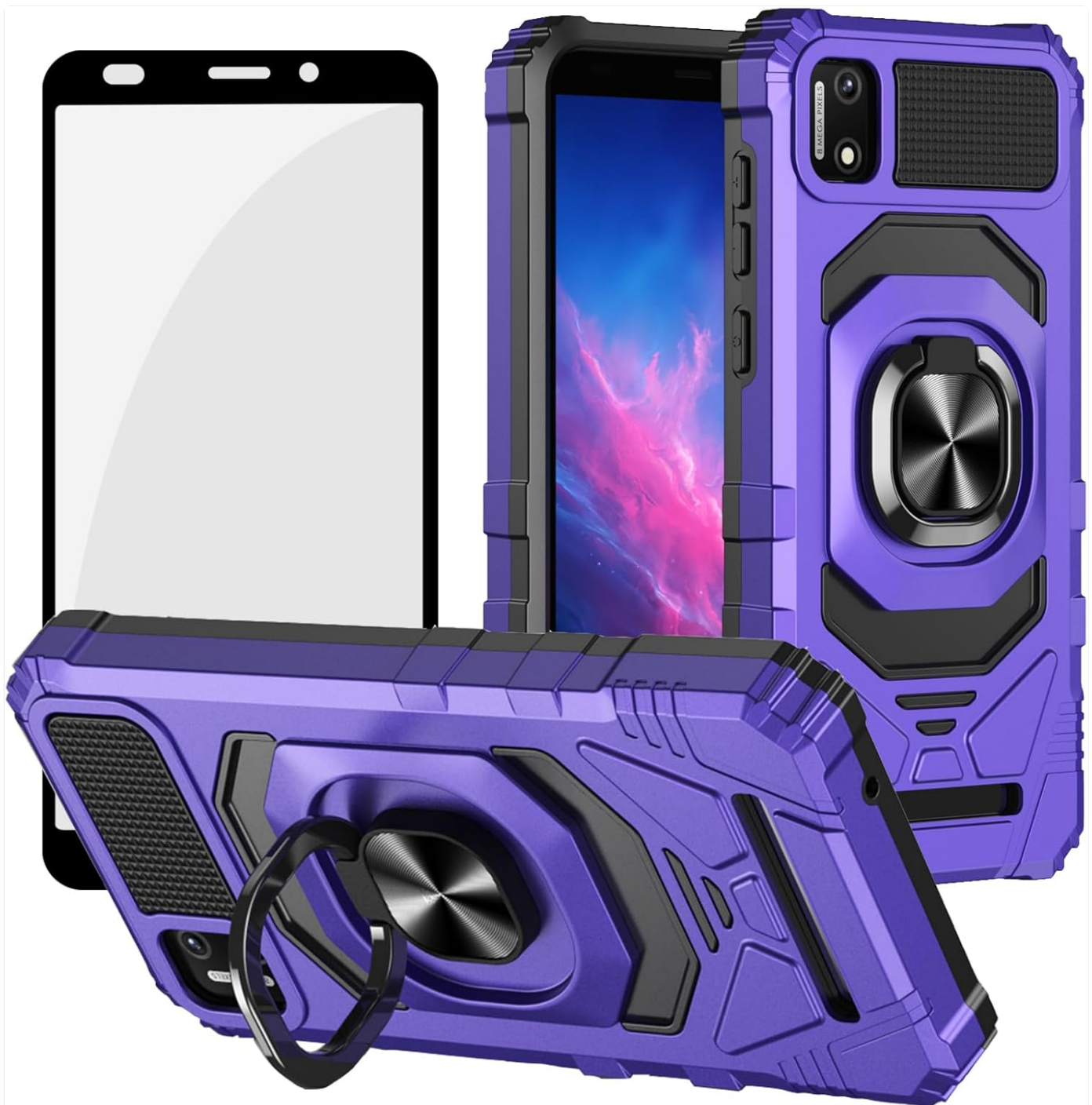
Figure 1: Ailiber Protective Case for Cloud Mobile Stratus C7, showcasing the case and included screen protector.