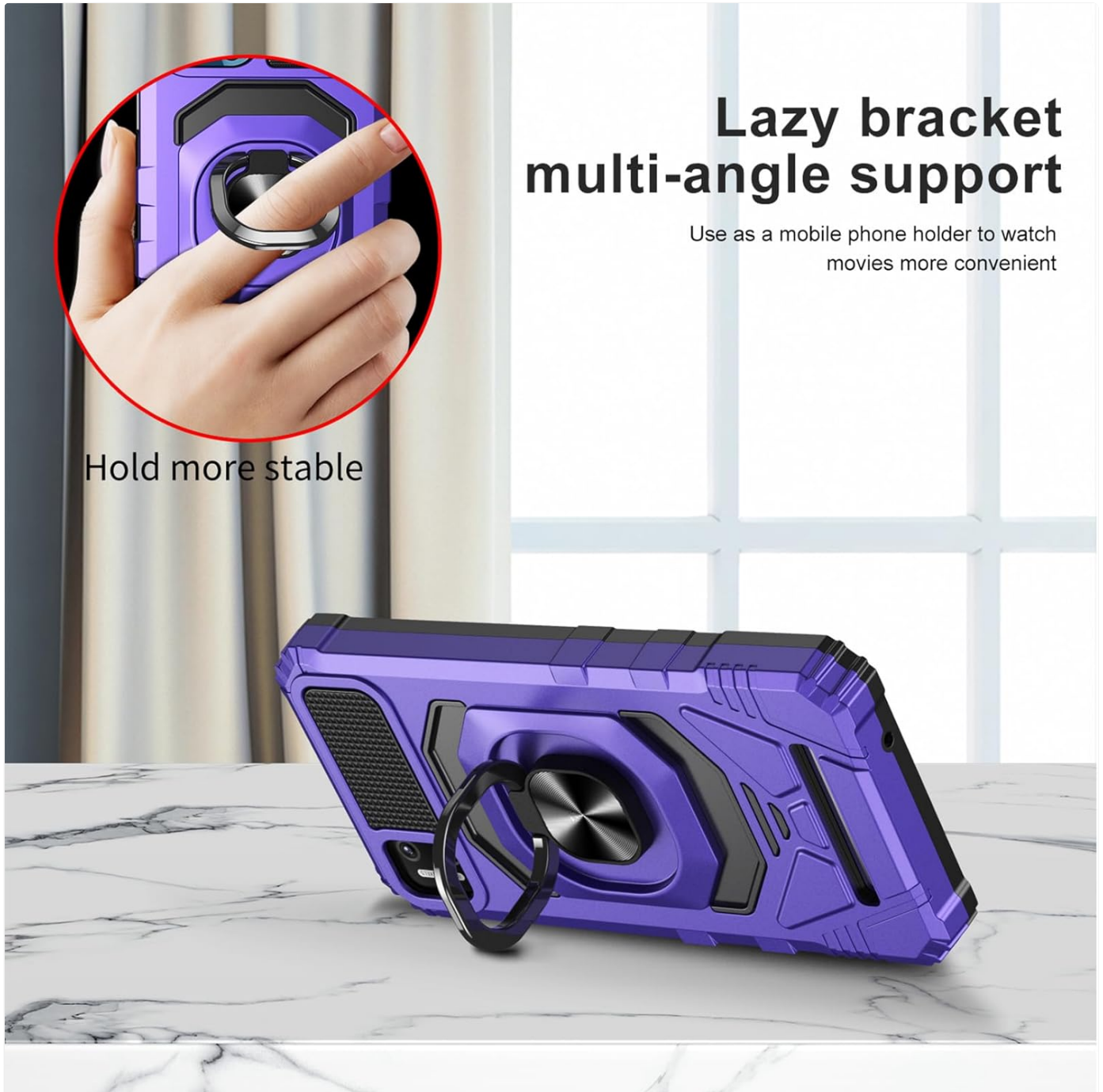
Figure 3: Demonstrating how the ring kickstand provides a stable grip and multi-angle support for hands-free viewing.

The integrated metal ring on the back of the case serves as a versatile kickstand. To use it, simply pull the ring outwards until it clicks into place. The ring can rotate 180 or 360 degrees, allowing you to prop your phone in various angles for comfortable hands-free viewing of videos or video calls, both in portrait and landscape orientations.