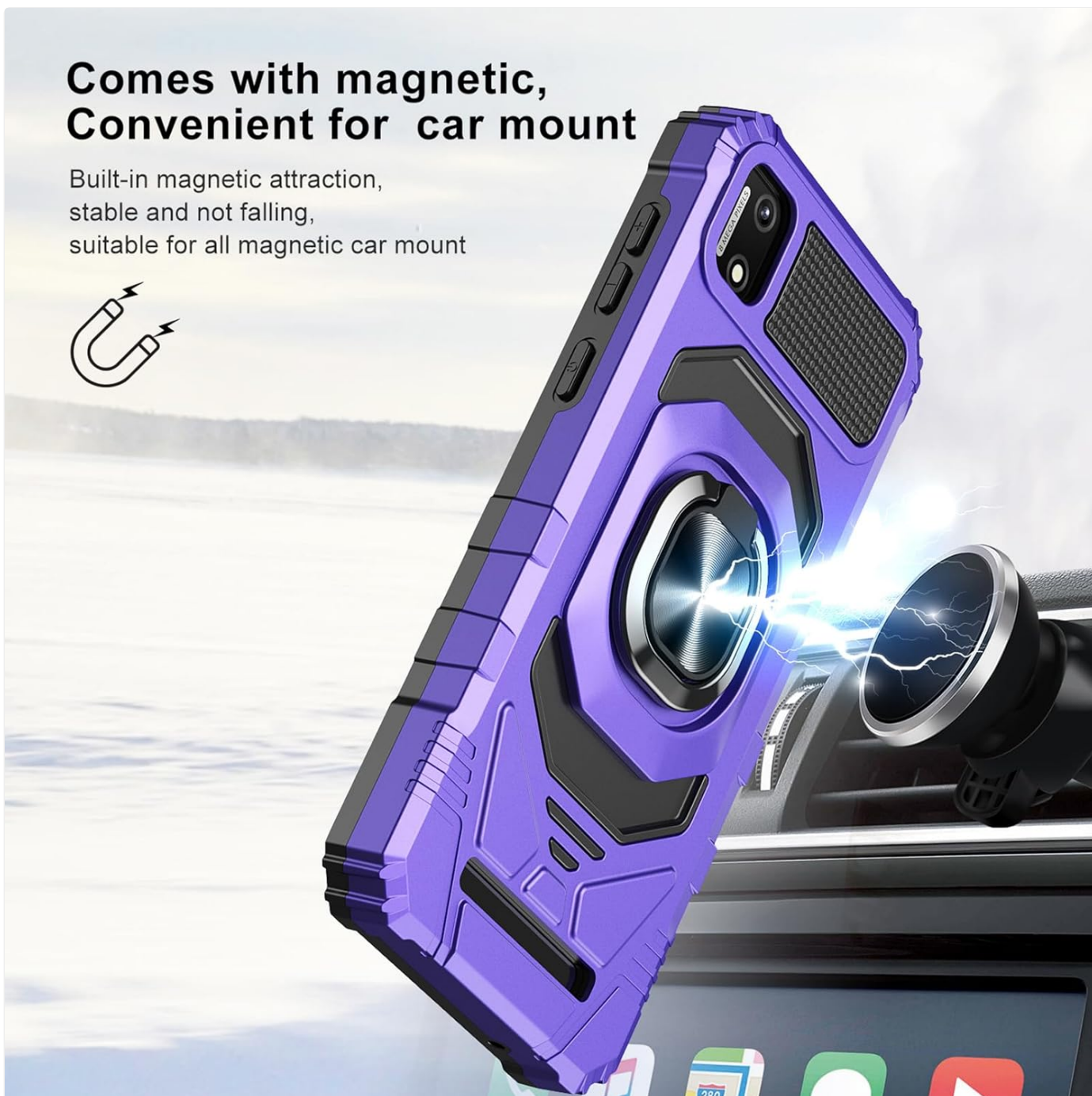
Figure 5: The case's integrated magnetic plate allows for easy and secure attachment to a magnetic car mount.