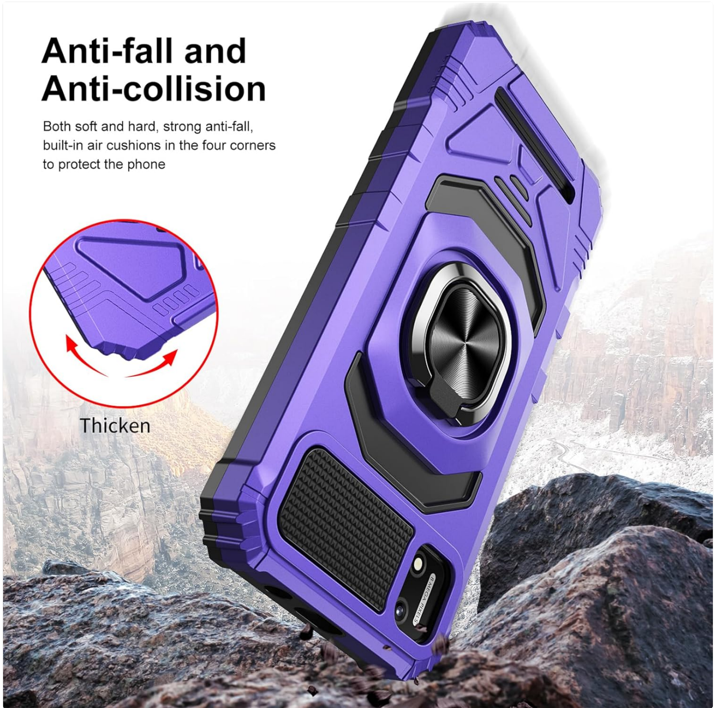
Figure 6: The case's design incorporates thickened corners and air cushions for enhanced anti-fall and anti-collision protection.