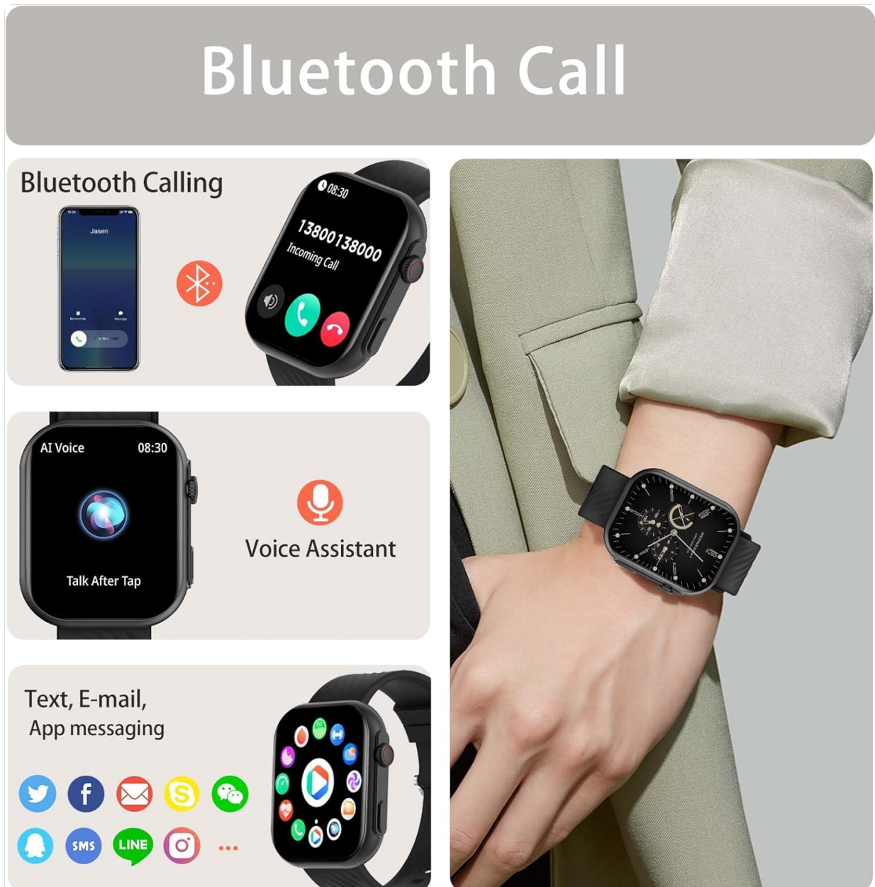
Figure 2: The smartwatch displaying an incoming call, voice assistant activation, and various app notification icons.