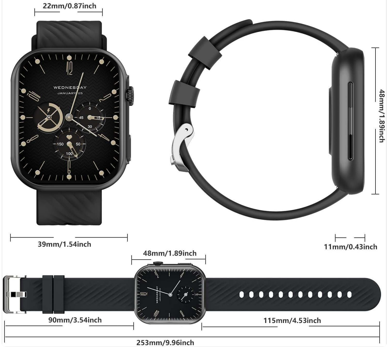
Figure 6: Detailed product dimensions of the smartwatch, including watch face width (39mm), height (48mm), thickness (11mm), and strap width (22mm).