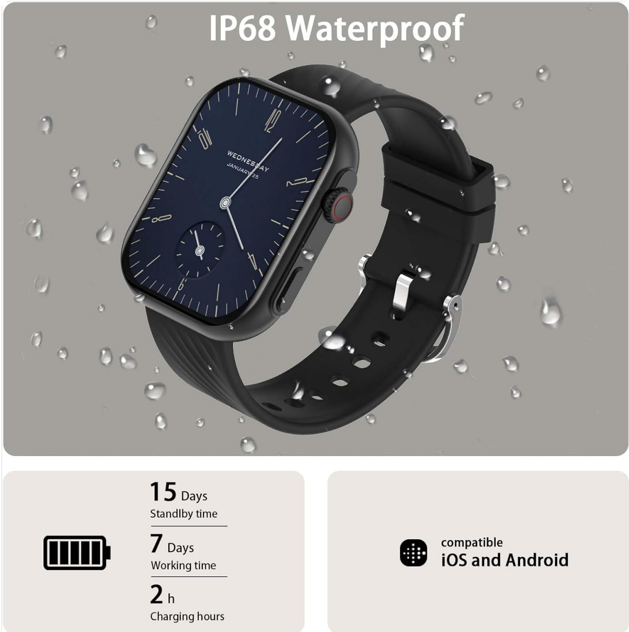
Figure 5: The smartwatch shown with water droplets, illustrating its IP68 water resistance, suitable for daily use and shallow water activities.