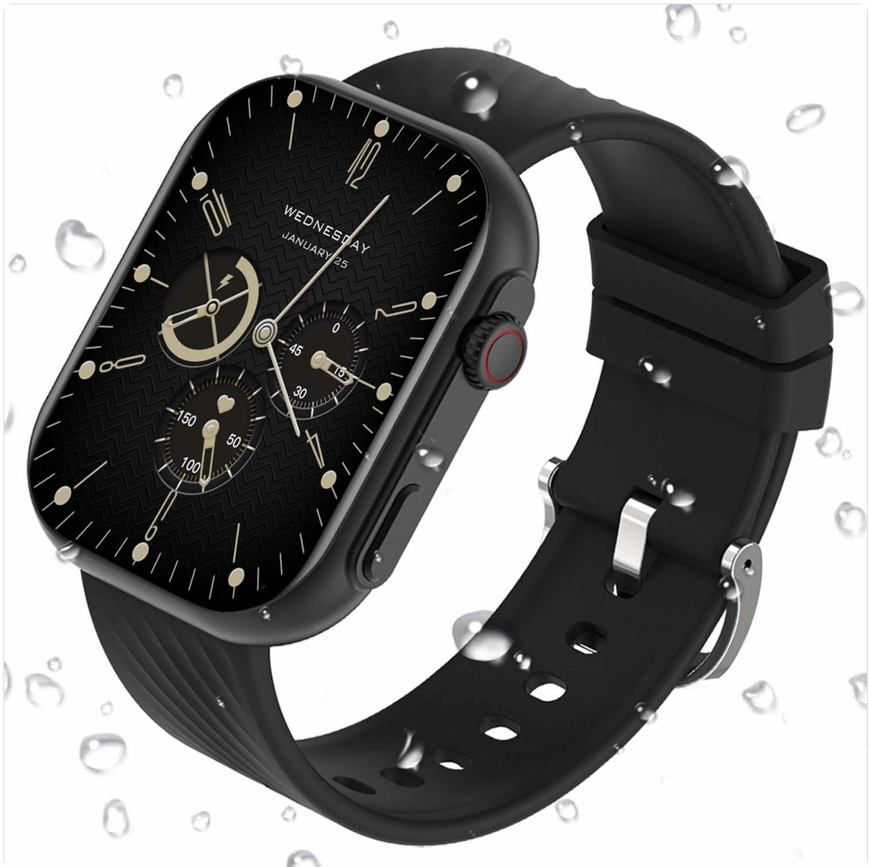
Figure 1: AVUMDA Smartwatch featuring a 2.01-inch HD touch screen, showcasing multiple customizable watch faces and the functional rotary encoder.