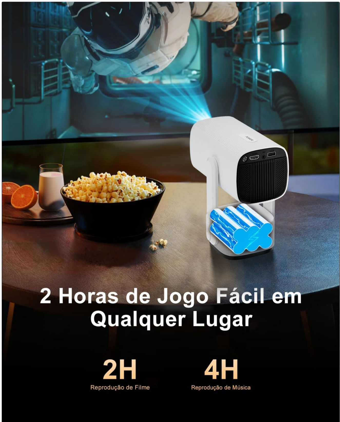
Figure 5.3: Portable Playtime. This image highlights the projector's battery life, offering approximately 2 hours of continuous movie playback or 4 hours of music playback on a single charge, enabling use anywhere.