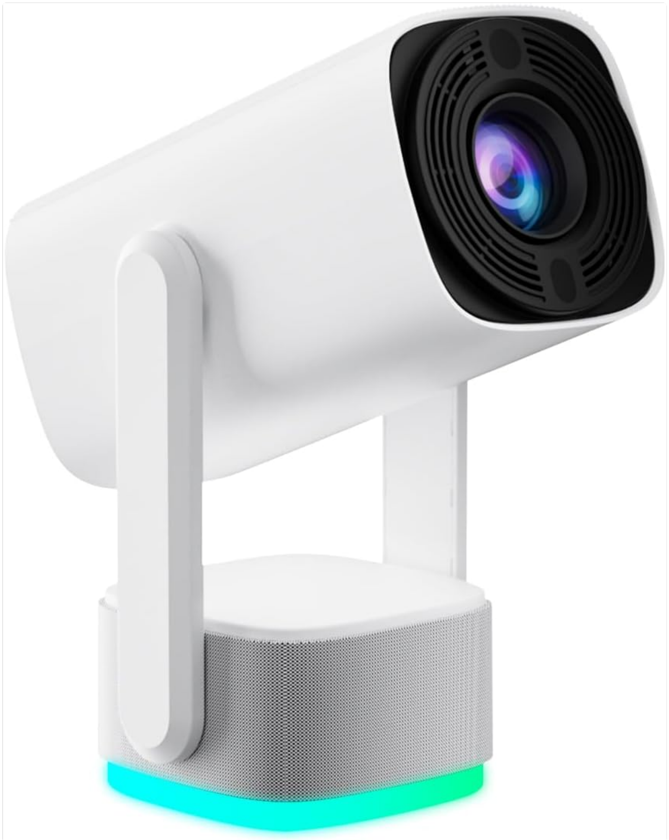
Figure 3.1: Salange K2 Portable Projector. This image shows the compact, white projector with its unique rotatable stand and integrated speaker base, featuring an ambient light ring at the bottom.