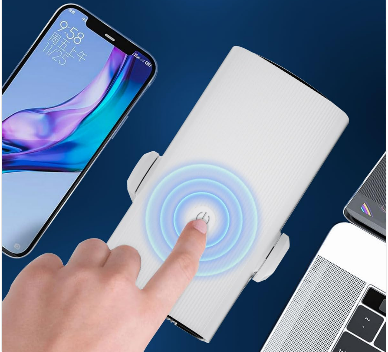
Figure 7.2: Touch Control Design. This image shows a finger interacting with the projector's touch-sensitive power button, emphasizing its quick response and ease of use.

Adota tela de toque térmica, que é sensível ao toque, de resposta rápida e fácil de usar.