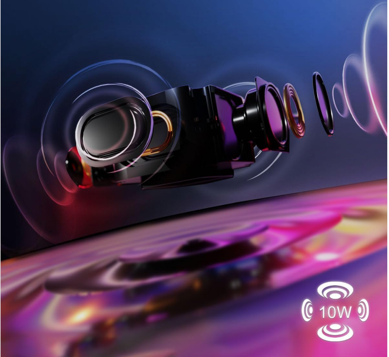
Figure 7.1: 10W Speaker. This image provides an exploded view of the projector's speaker components, highlighting the 2x5W speakers and two bass reinforcements that deliver immersive stereo sound.