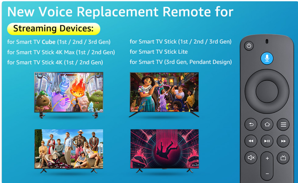
Image: Visual representation of compatible streaming devices and smart TVs.

This replacement voice remote is compatible with a wide range of streaming devices and smart TVs. Ensure your device is listed below for proper functionality.