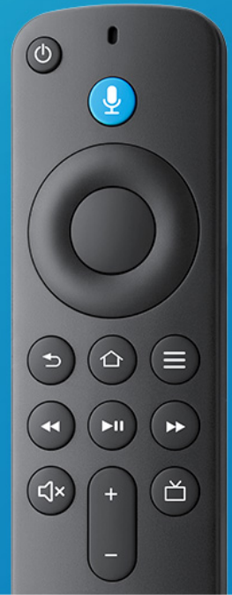
Image: Visual representation of devices not compatible with the YOSUN G25N8L remote control.