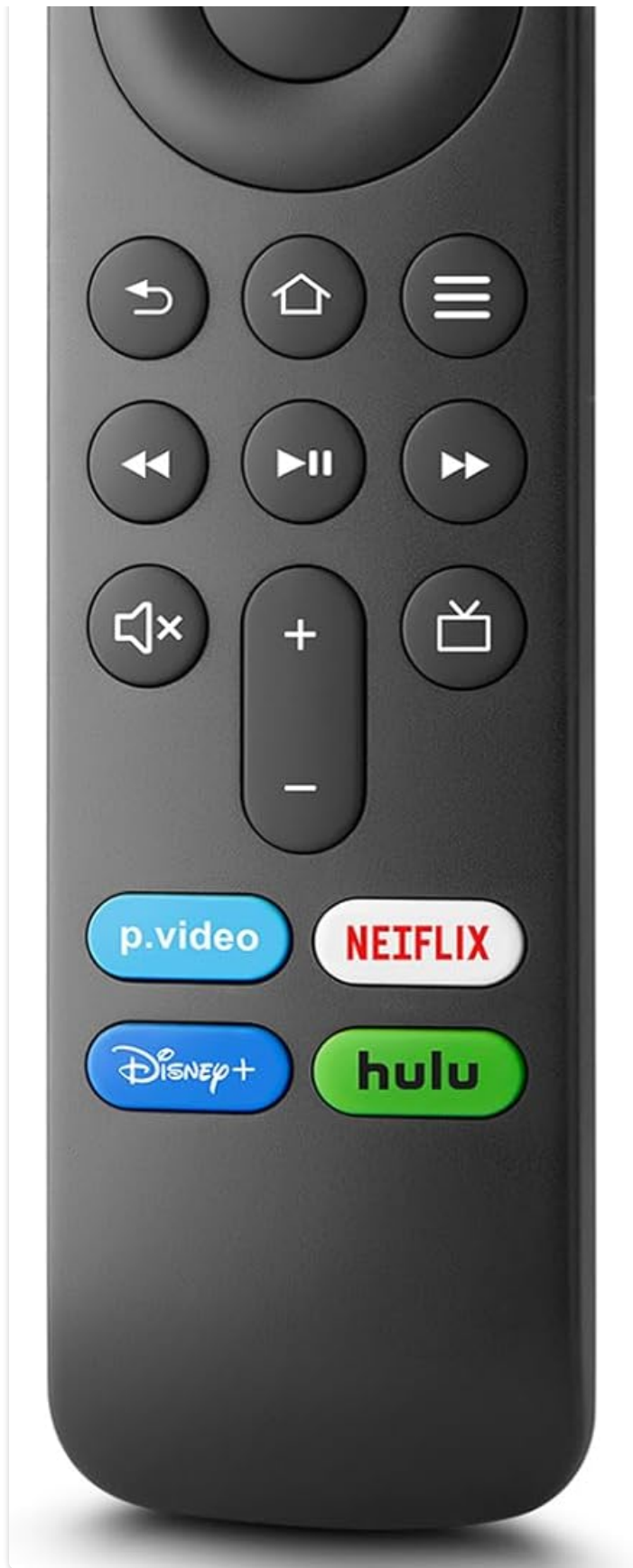
Image: YOSUN G25N8L Replacement Voice Remote Control.