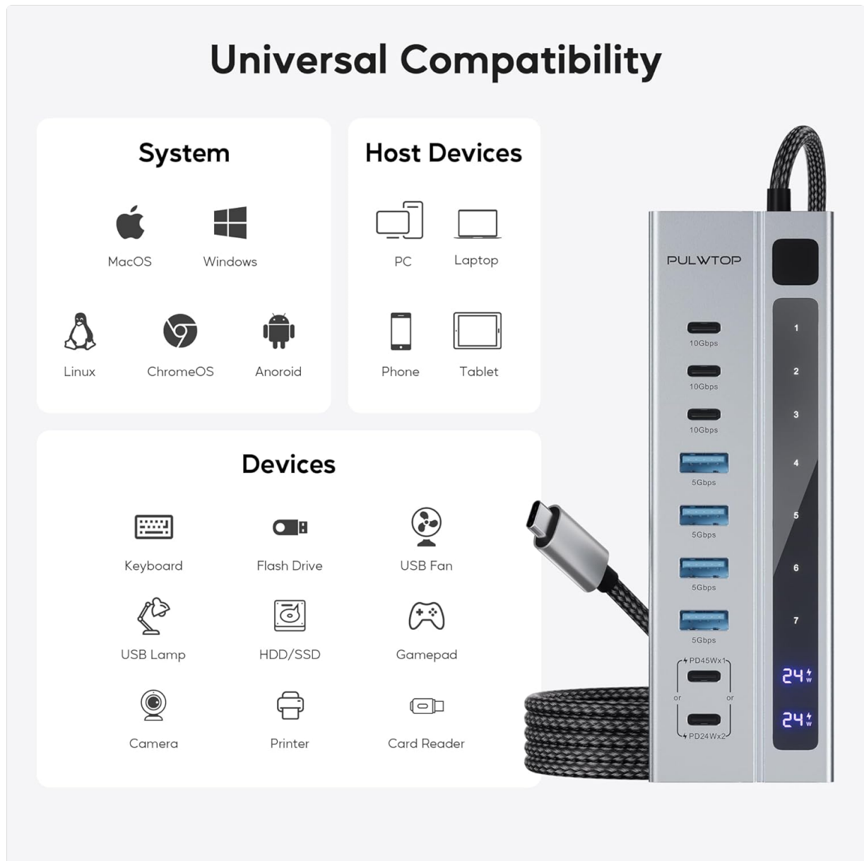
Image: A chart illustrating the universal compatibility of the USB C Hub with various operating systems (MacOS, Windows, Linux, ChromeOS, Android), host devices (PC, Laptop, Phone, Tablet), and peripherals (Keyboard, Flash Drive, USB Fan, USB Lamp, HDD/SSD, Gamepad, Camera, Printer, Card Reader).