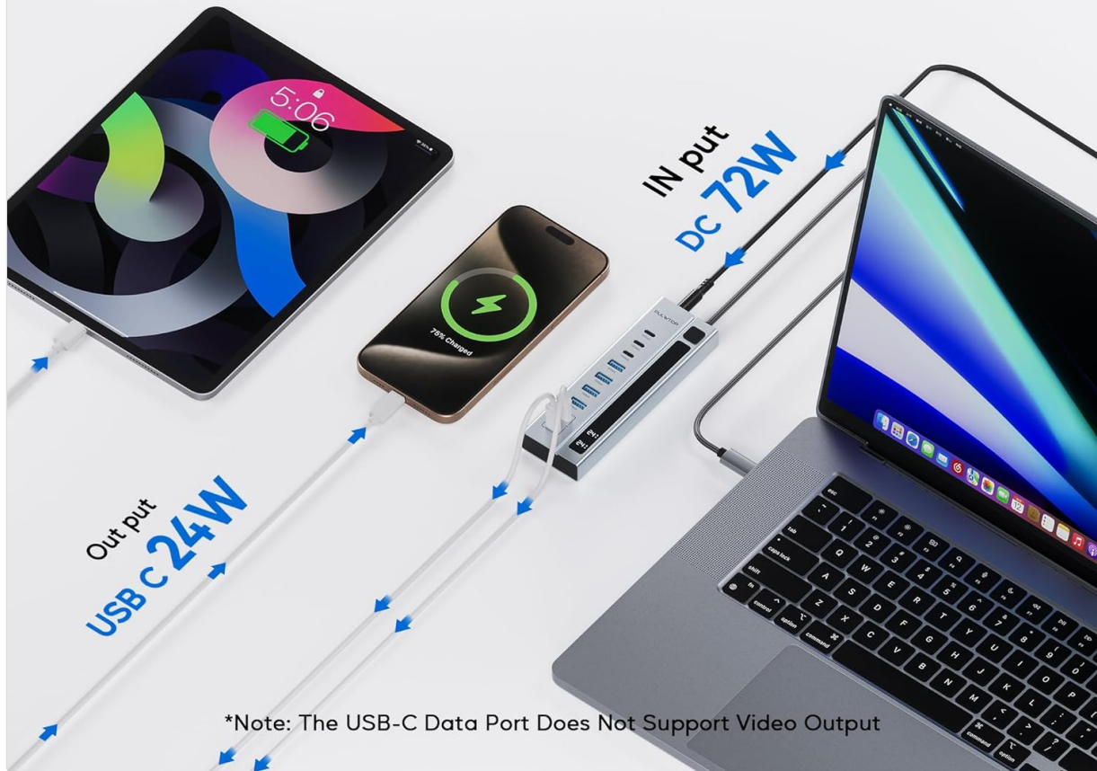
Image: The USB C Hub is shown connected to a laptop via its integrated USB-C cable, with various devices like a tablet and smartphone connected to the PD charging ports, illustrating its power delivery capabilities.