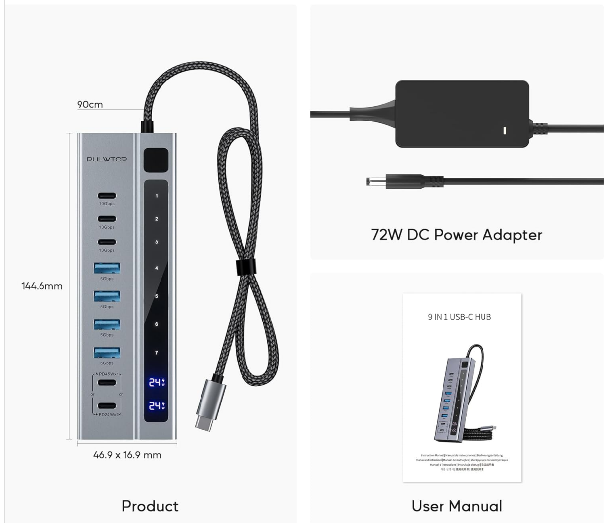
Image: What's in the Box - The PULWTOP 9-in-1 Powered USB C Hub, its 72W DC power adapter, and the user manual are shown.