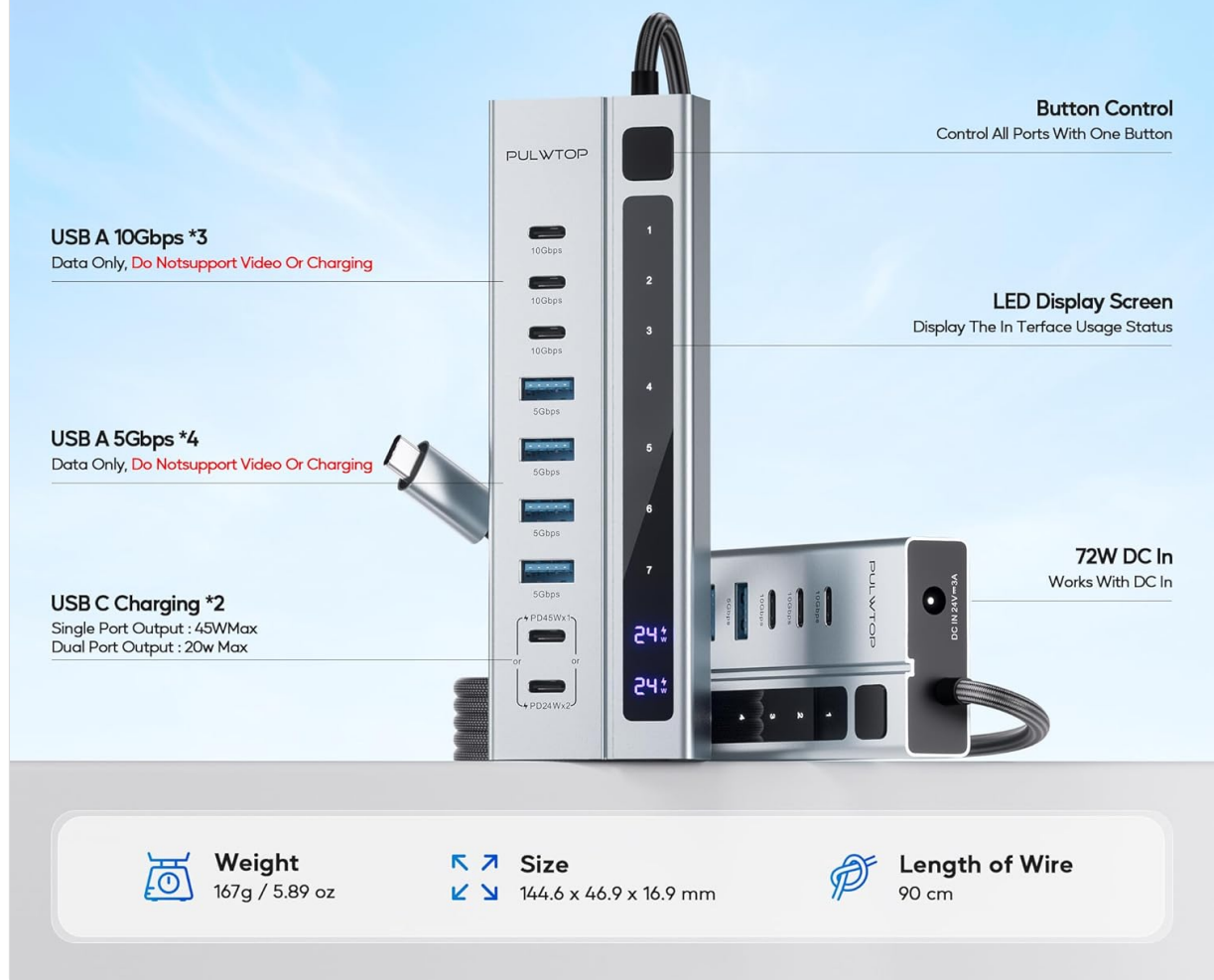
Image: Overview of the 9-in-1 Powered USB C Hub with all ports labeled, including 3 USB-C 10Gbps data ports, 4 USB-A 5Gbps data ports, and 2 USB-C 45W max charging ports. The 72W DC input and button control are also indicated.