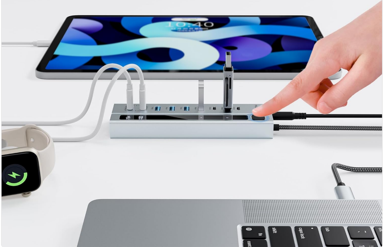
Image: A hand is shown pressing the power button on the PULWTOP 9-in-1 Powered USB C Hub, demonstrating the individual switch control feature. Various devices are connected to the hub in the background.