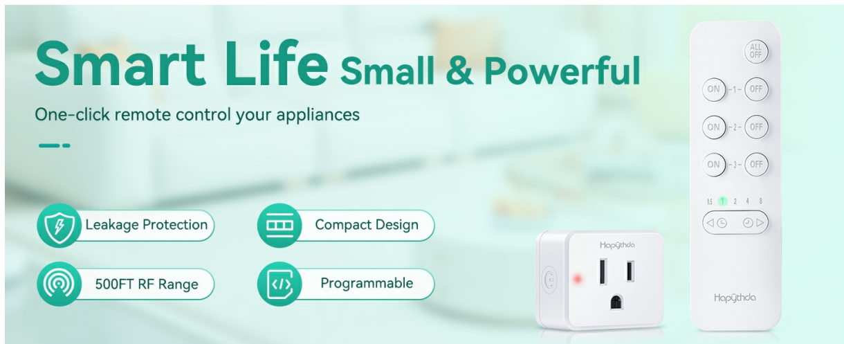
Image 1.1: Overview of the HAPYTHDA Timer Outlet Plug and Remote Control.

Thank you for choosing the HAPYTHDA Timer Outlet Plug. This device provides convenient wireless control for your household appliances, featuring a remote control with countdown timer functions and robust safety protections. Please read this manual thoroughly before use to ensure proper operation and safety.