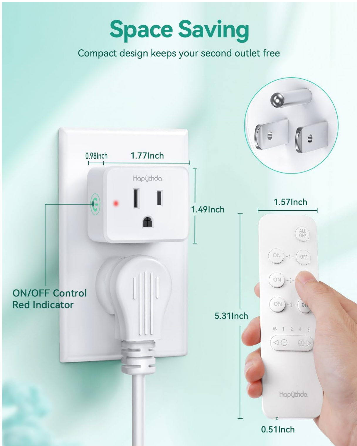
Image 6.1: Compact design of the outlet and remote, showing dimensions.