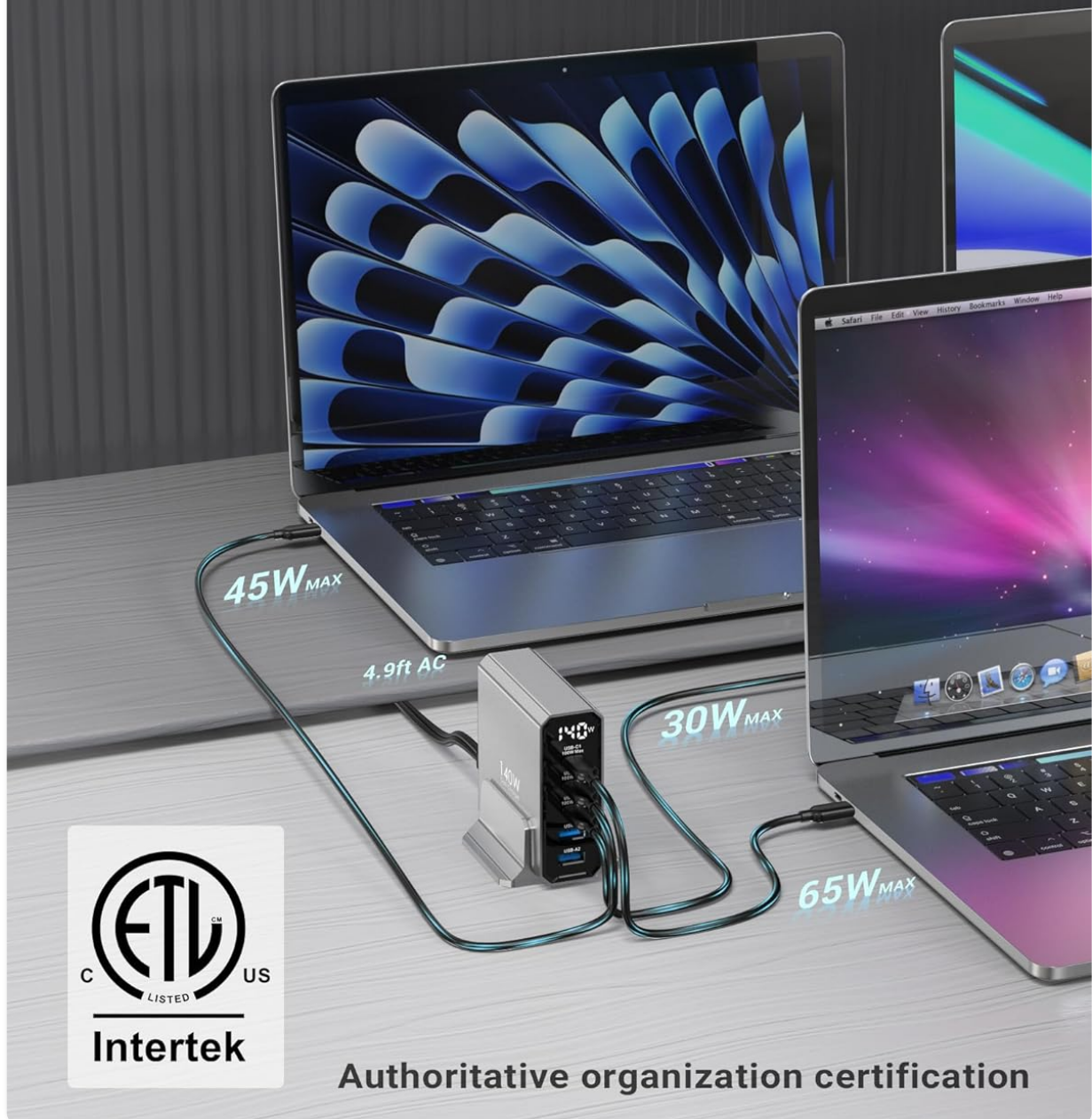
Image: The GaN 140W Max Charger providing fast charging for three laptops, demonstrating its multi-device capability.

Video: A demonstration of the TOPADRE 140W USB C Charging Station's power distribution and thermal performance when charging multiple devices.