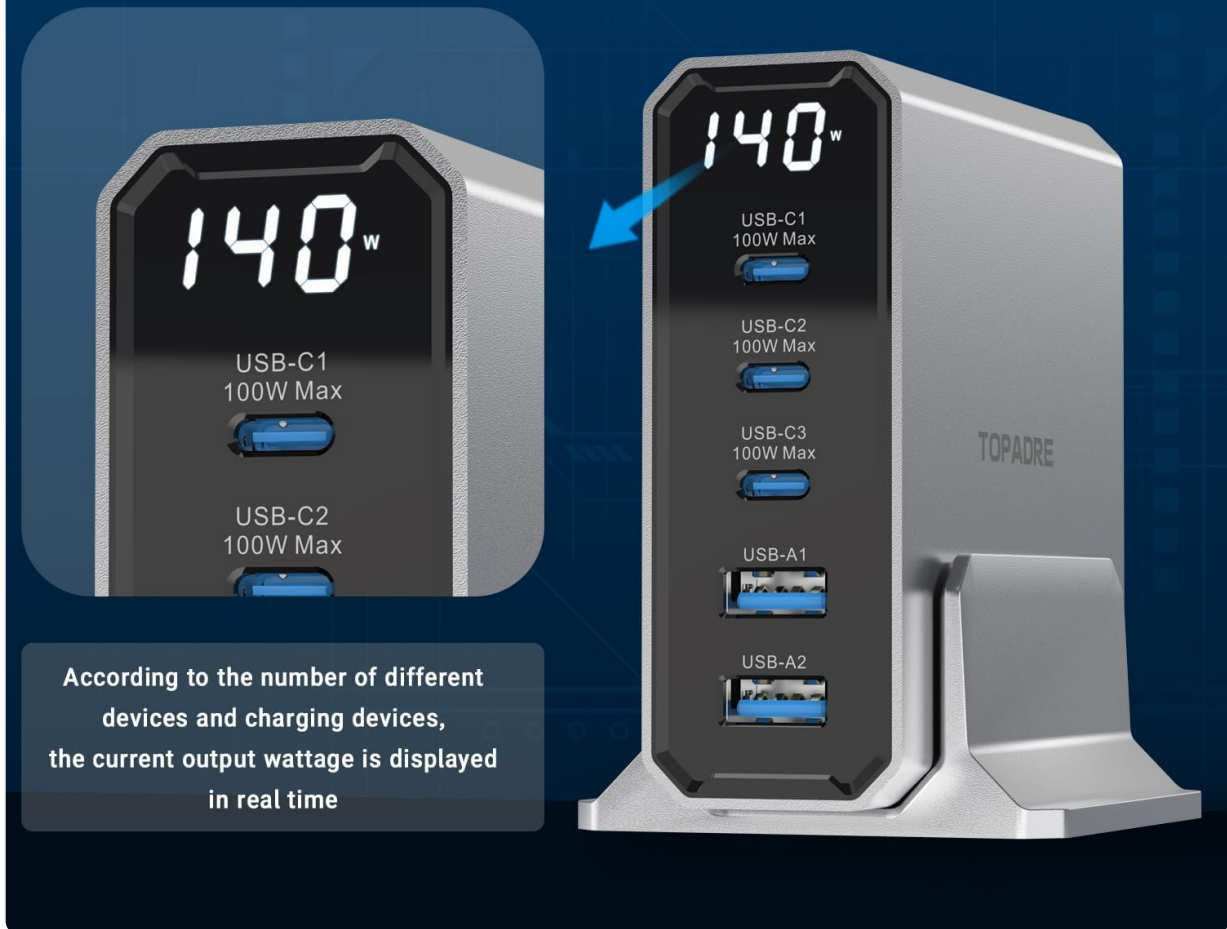
Image: The unique digital display screen provides real-time wattage information for connected devices.