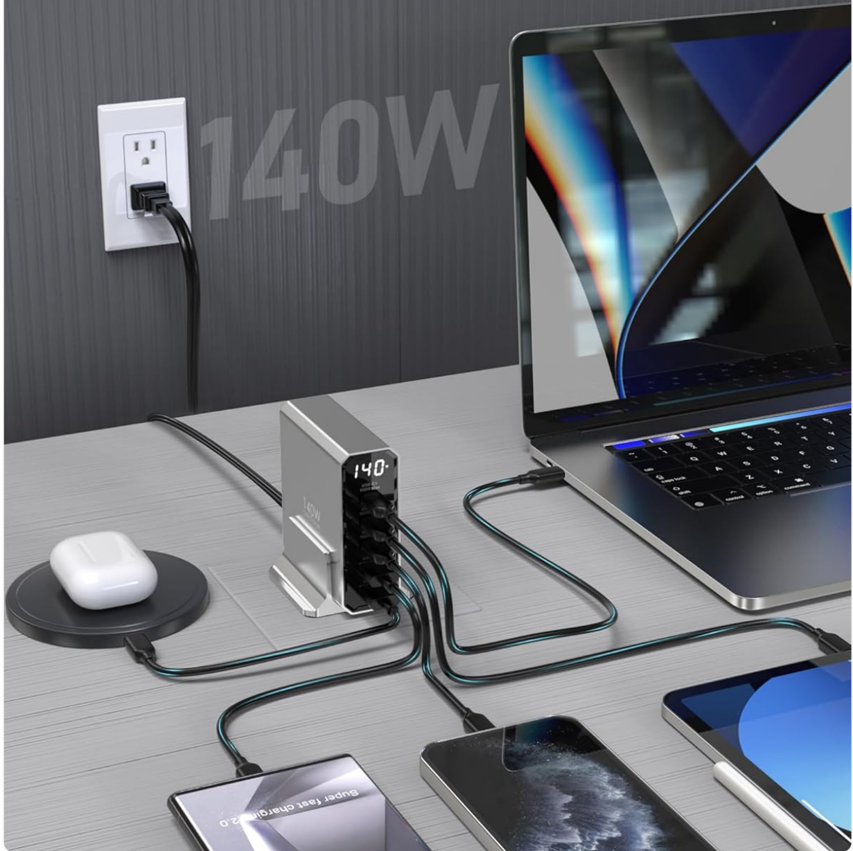
Image: The TOPADRE 140W USB C Charging Station efficiently powers multiple devices simultaneously.