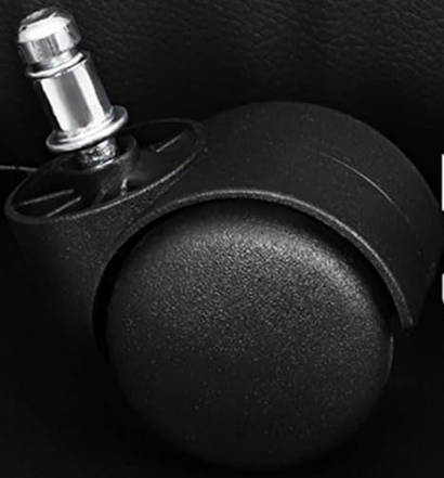
Figure 7: Chair Materials and Wheels

Roues universelles de qualité, une expérience tout en douceur