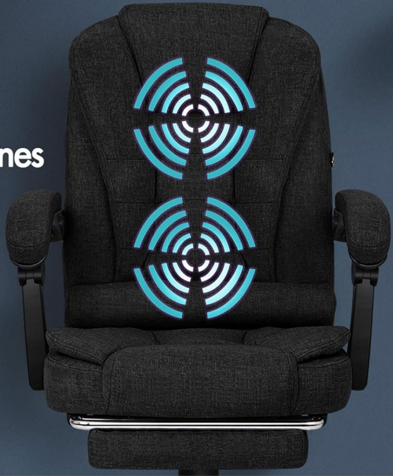
Figure 6: Two-Zone Massage System