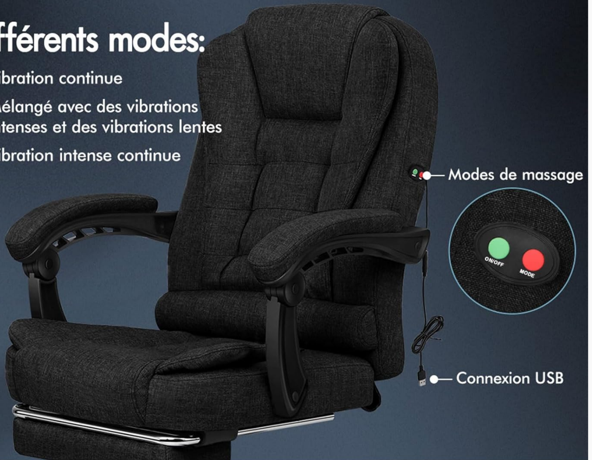
Figure 5: Massage Control Unit and USB Connection