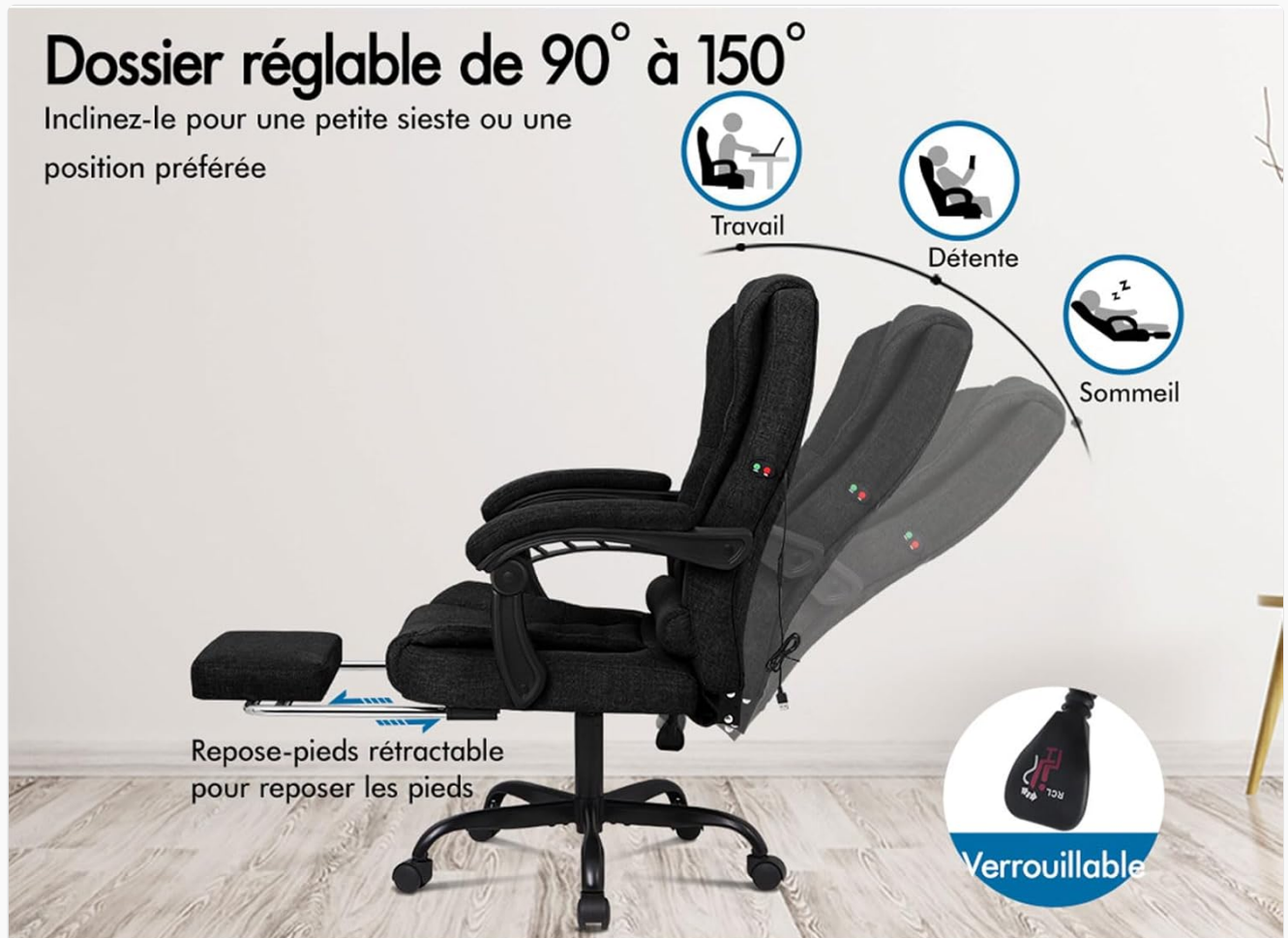
Figure 4: Recline Function and Retractable Footrest

A retractable footrest is integrated beneath the seat. Pull the footrest out when reclining for additional leg support. Push it back in when not in use.