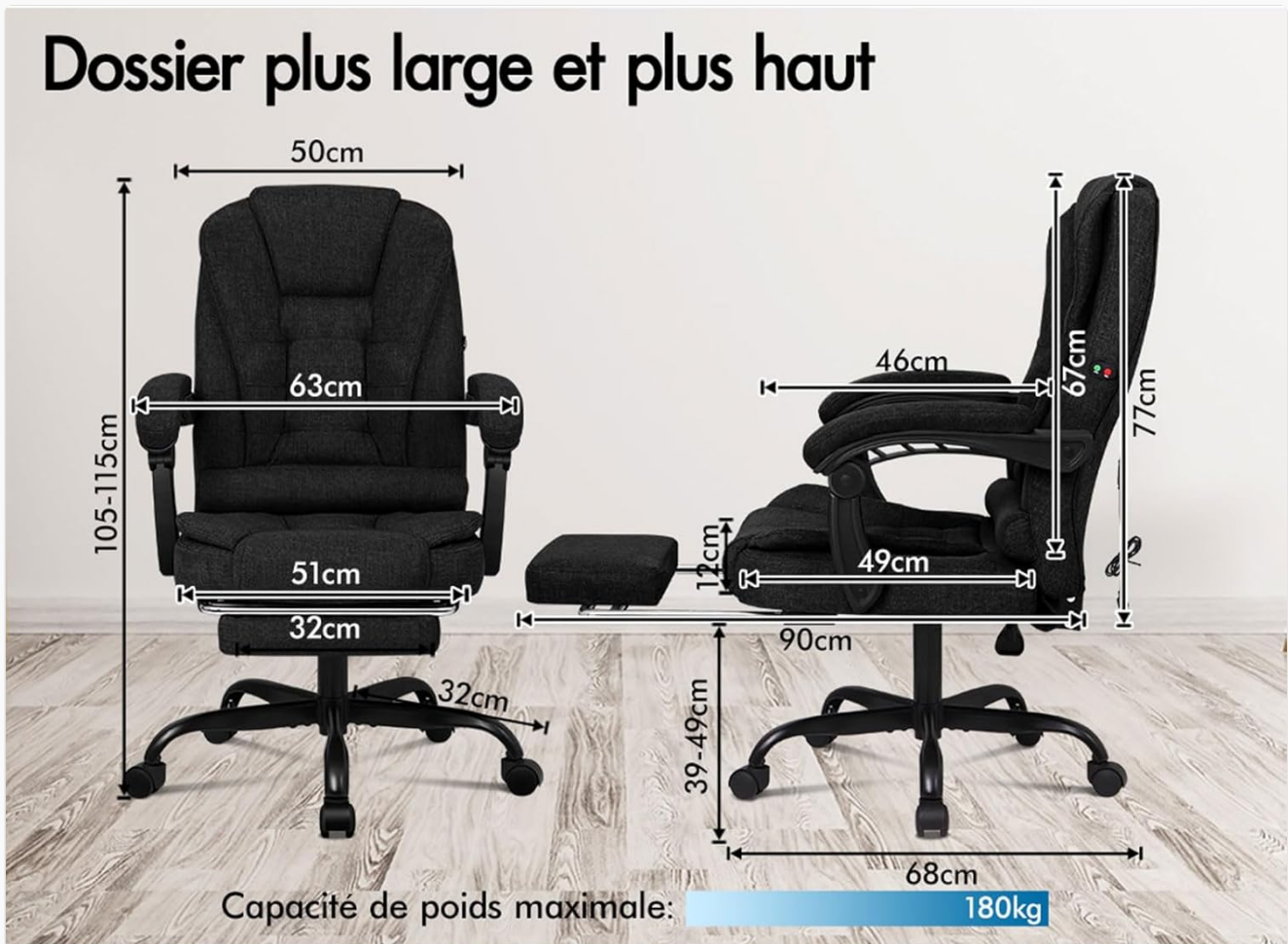
Figure 2: Chair Dimensions for Assembly Reference