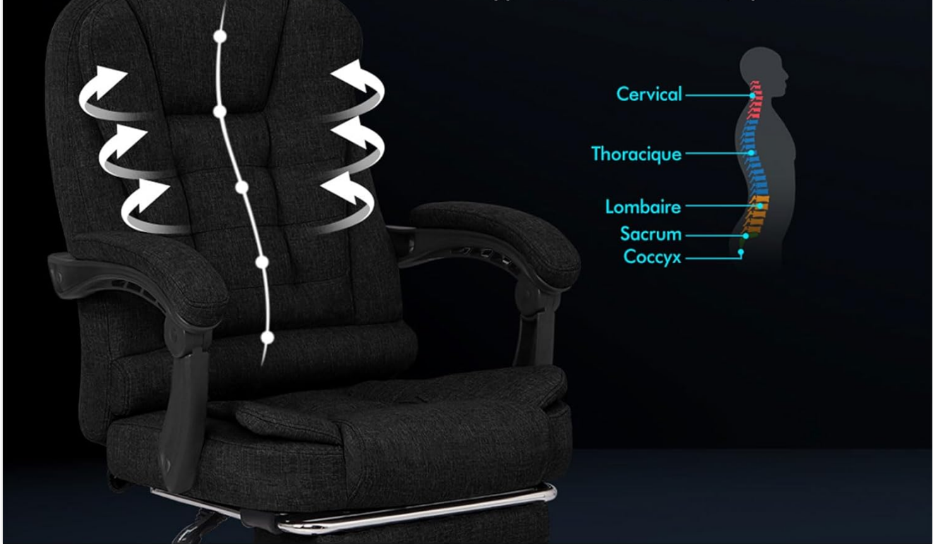
Figure 1: ALFORDSON D-OCH-MASG-B-FT-FABK-FBA Ergonomic Swivel Office Chair

Support rembourré double, épouse votre dos