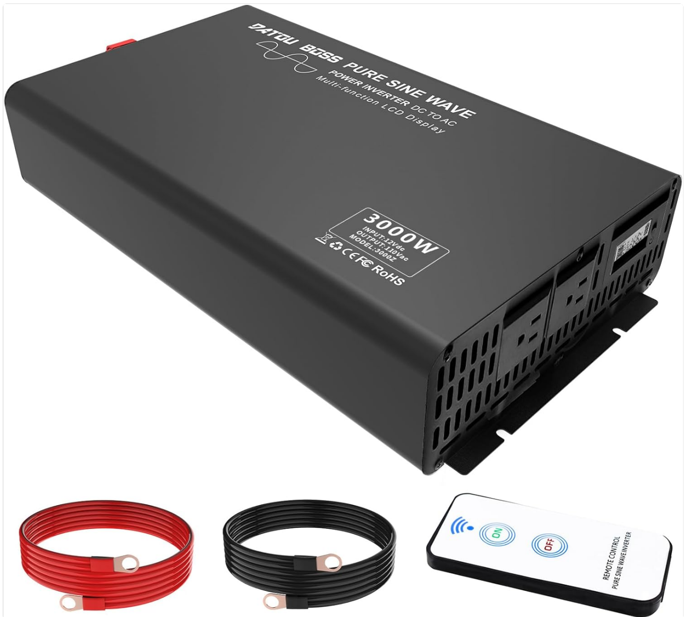
Figure 2.1: The DATOUBOSS 3000W Pure Sine Wave Inverter unit, along with the included red and black power cables and a remote control.