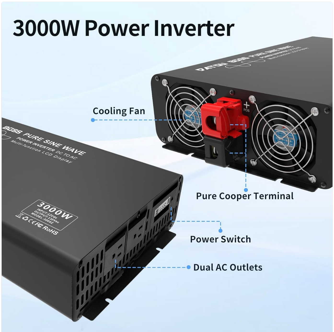
Figure 3.1: Rear panel of the inverter with clearly marked positive and negative terminals for battery connection.