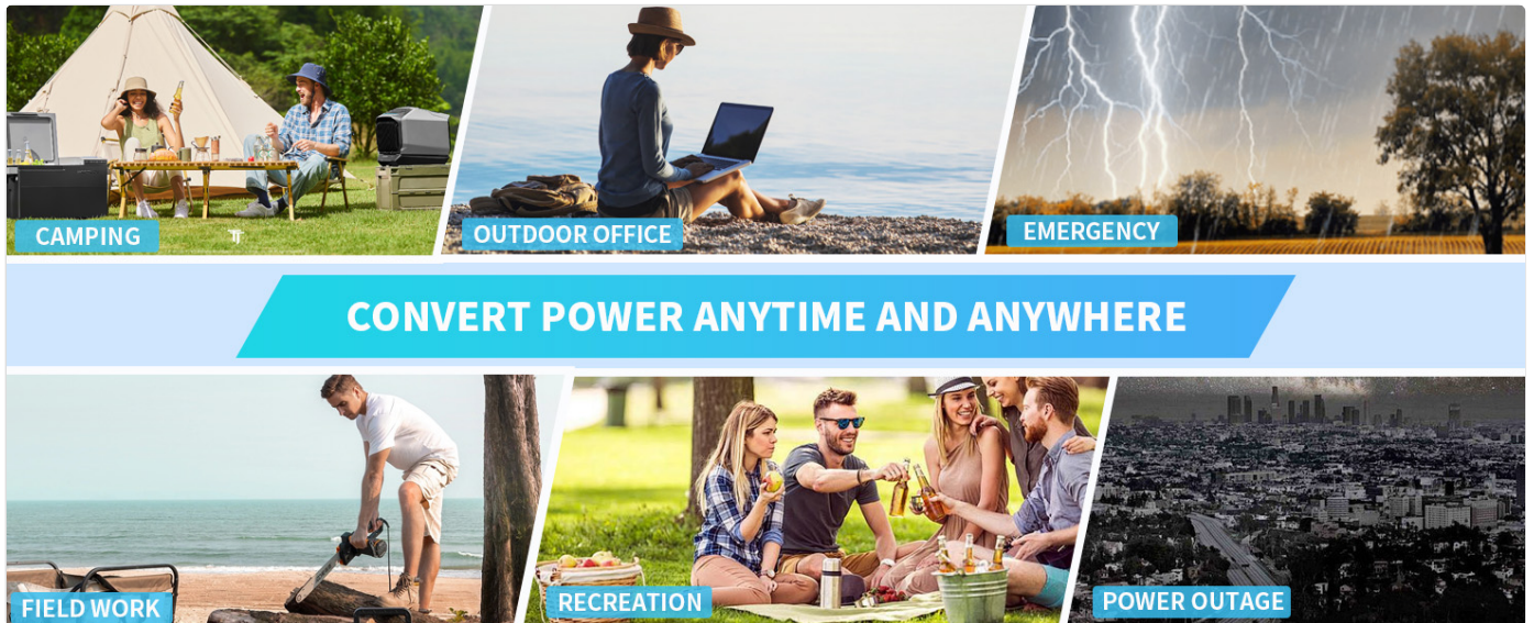
Figure 4.2: Versatile applications for the inverter, providing power anytime and anywhere.