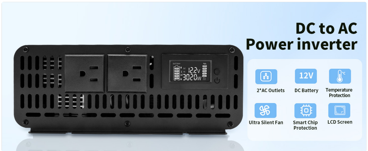
Figure 6.1: Visual representation of the inverter's comprehensive safety protection system.