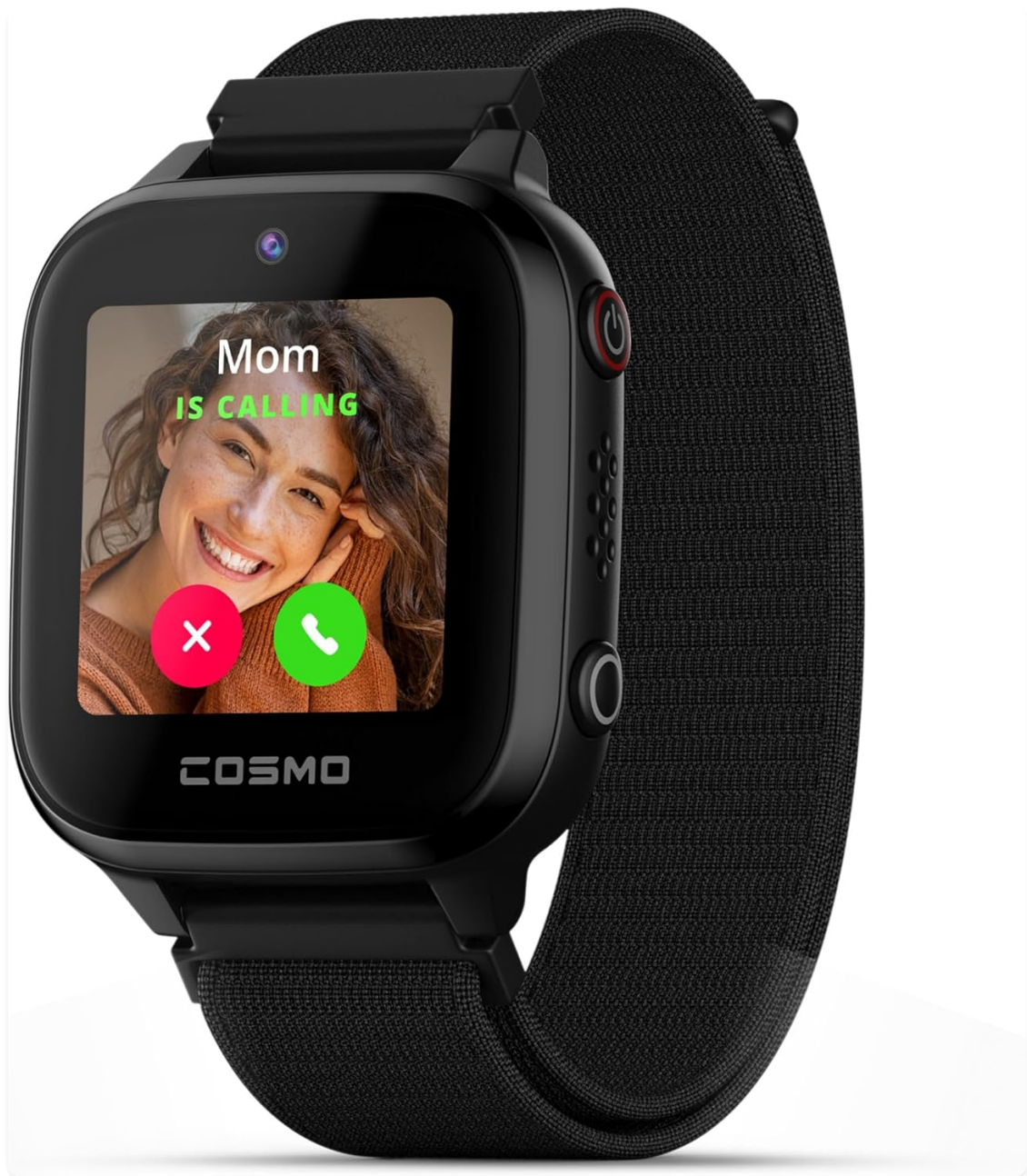
Image 1.1: The JrTrack 3 Smart Watch displaying an incoming call from a contact named 'Mom'.