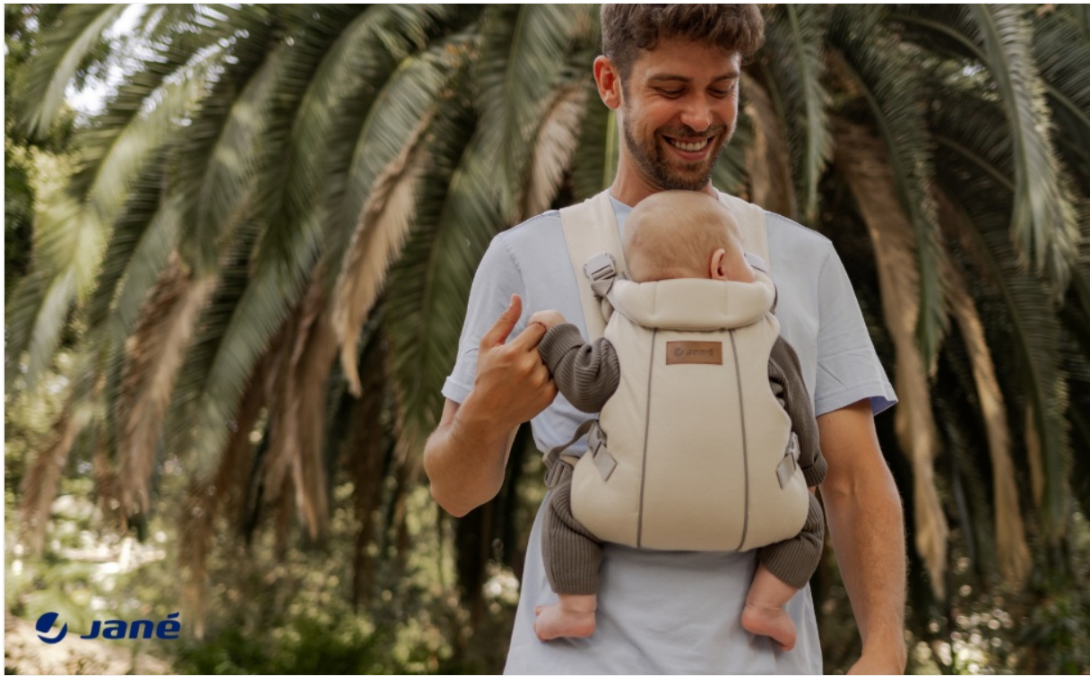
Image: Padded straps and a design for better weight distribution enhance wearer comfort.

Image: The carrier offers lumbar protection, is easy to fit, and ensures good load distribution.