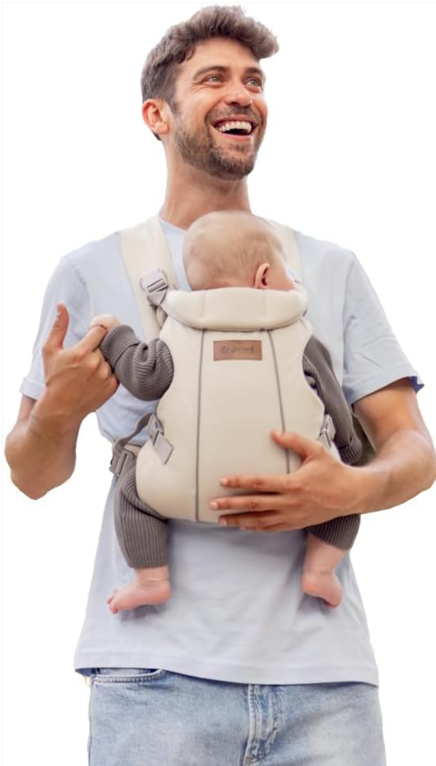
Image: The Jané Dual Ergonomic Baby Carrier in beige, shown with a baby comfortably positioned facing the adult.