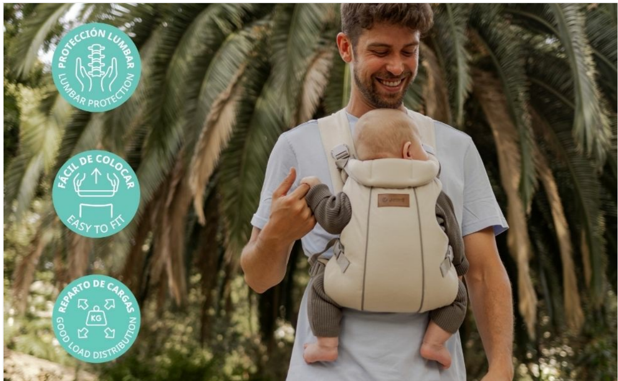
Image: The carrier features soft, padded, and respectful fabric for maximum comfort.