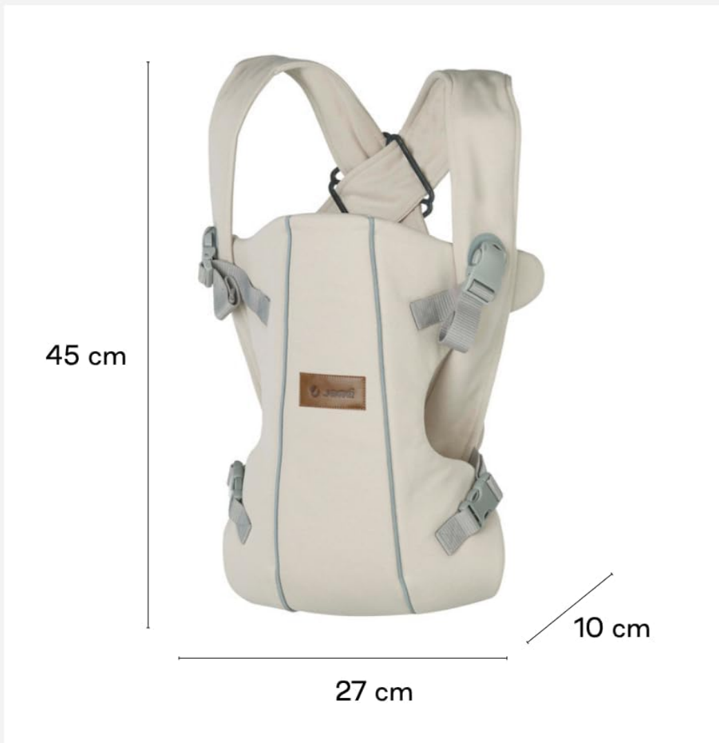
Image: Key dimensions of the Jané Dual Baby Carrier.