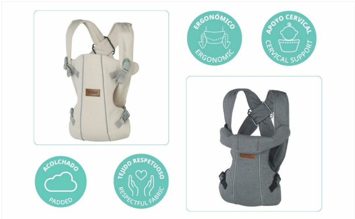
Image: The ergonomic design and full front opening allow for comfortable and easy use.