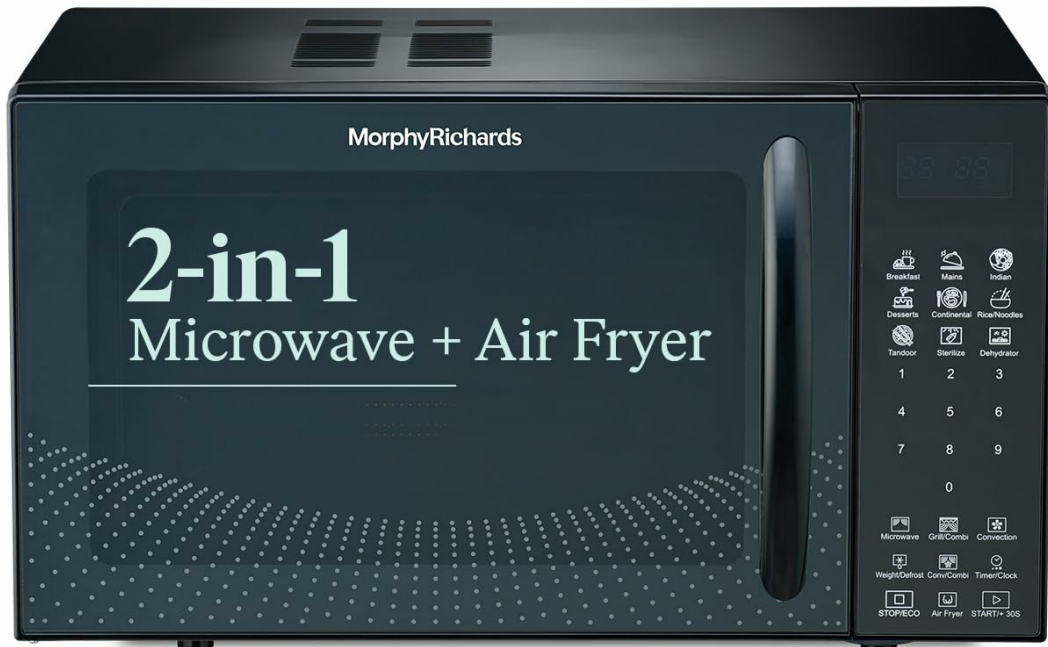
Front view of the Morphy Richards 23CGAD Convection Microwave Oven, showcasing its sleek black design and digital control panel.