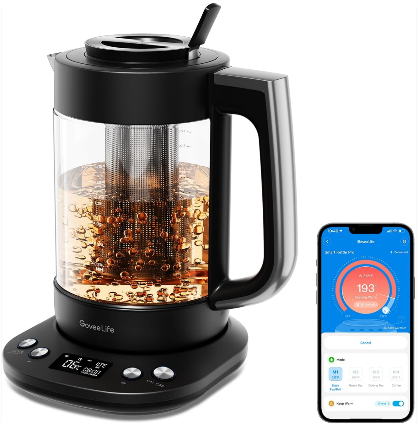
Image: The GoveeLife Smart Electric Kettle, featuring a clear glass body, black handle, and base with control buttons. A tea infuser is visible inside the kettle, and a smartphone screen shows the accompanying control application.