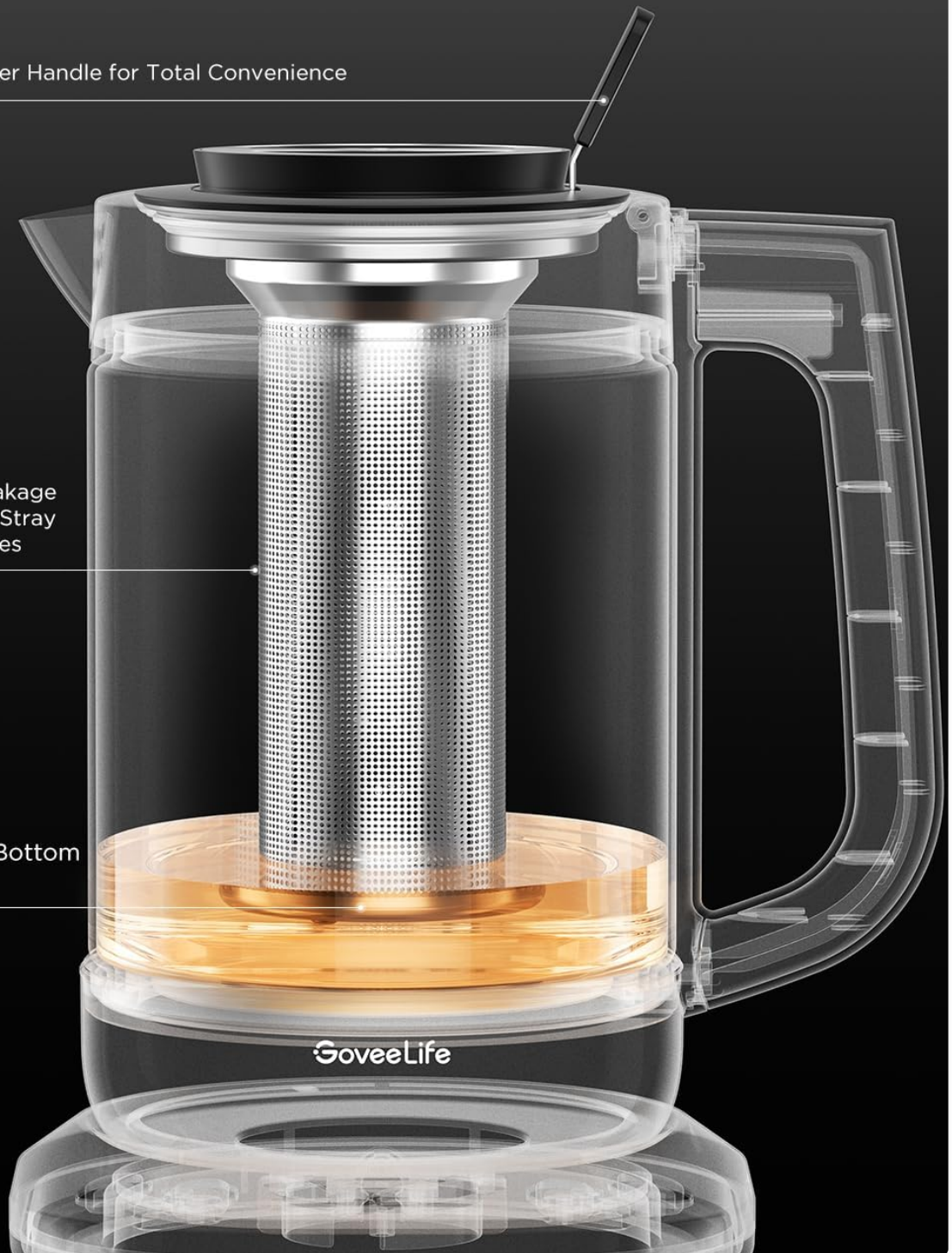
Image: A detailed view of the tea infuser within the kettle, highlighting its handle, small leakage holes to prevent leaf spillage, and its top-to-bottom design for efficient brewing.