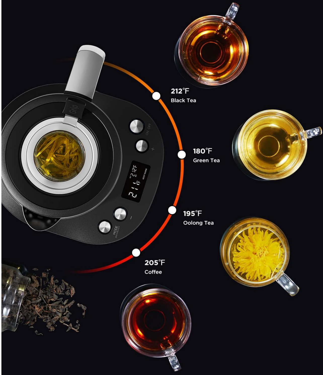
Image: An overhead view of the kettle's lid and infuser, surrounded by cups of various teas (Black Tea at 212°F, Green Tea at 180°F, Oolong Tea at 195°F, Coffee at 205°F), demonstrating accurate temperature control for different beverages.

Select a mode, let the kettle do the rest