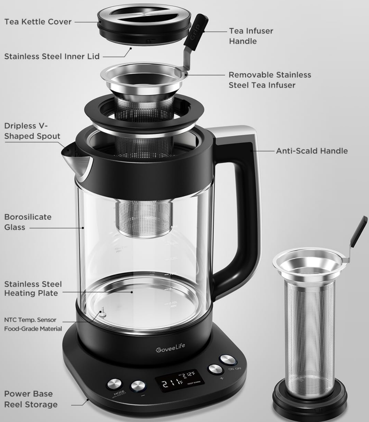
Image: An exploded diagram illustrating the components of the GoveeLife Smart Electric Kettle, including the tea kettle cover, tea infuser handle, stainless steel inner lid, removable stainless steel tea infuser, dripless V-shaped spout, anti-scald handle, borosilicate glass body, stainless steel heating plate, NTC temp. sensor, and power base with reel storage.