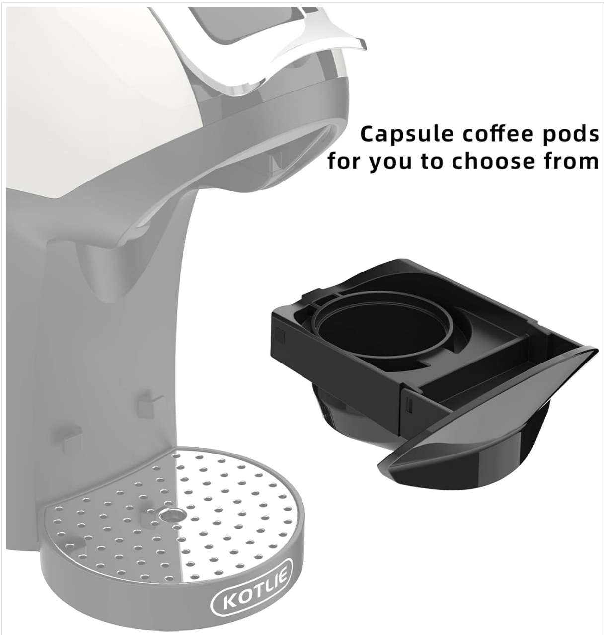
Image: The KOTLIE EM-308A capsule adapter shown alongside a compatible KOTLIE coffee machine, illustrating its intended use.