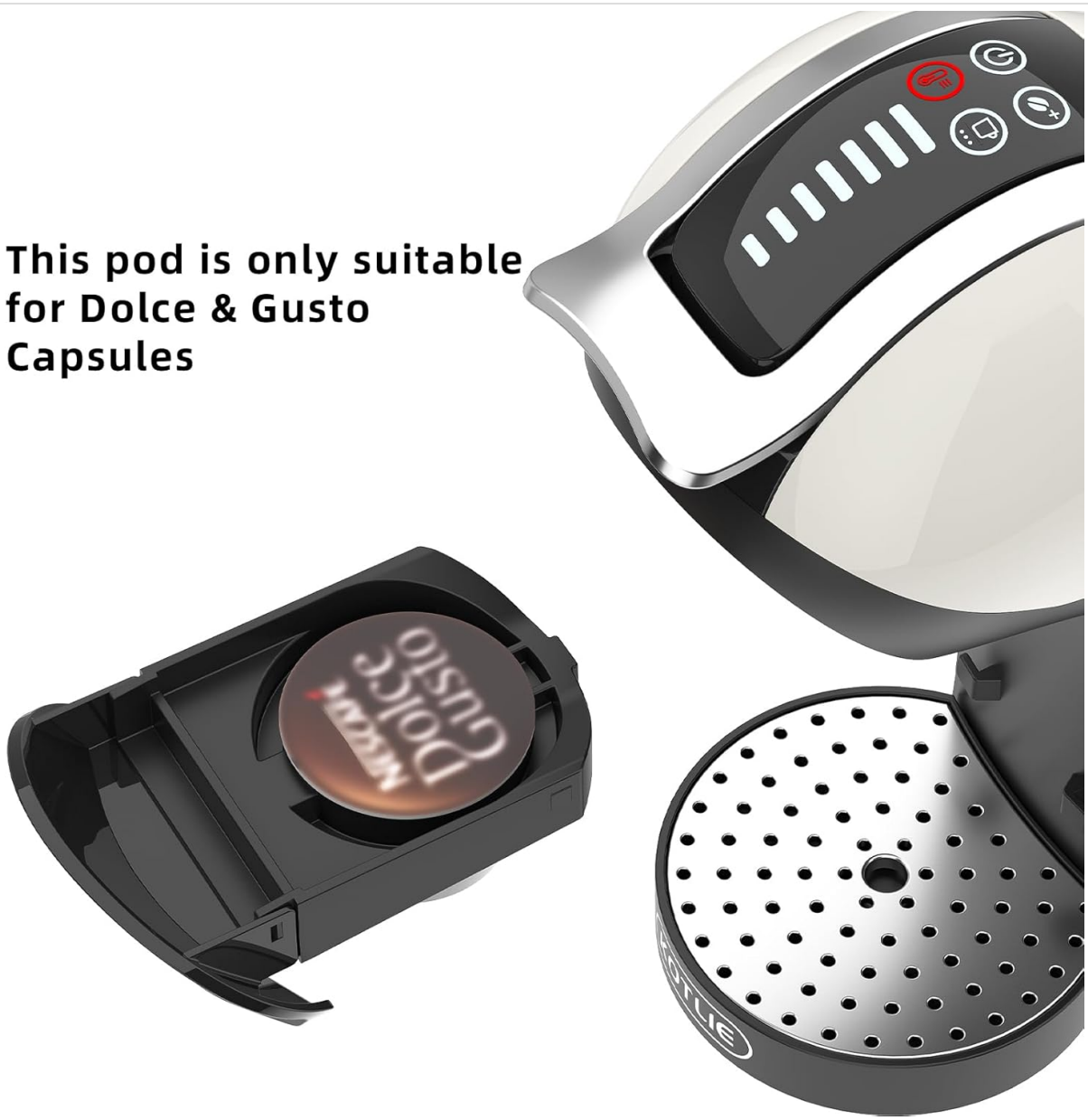
Image: A Dolce Gusto capsule being placed into the KOTLIE EM-308A adapter, demonstrating the correct orientation for use.

This pod is only suitable for Dolce & Gusto Capsules