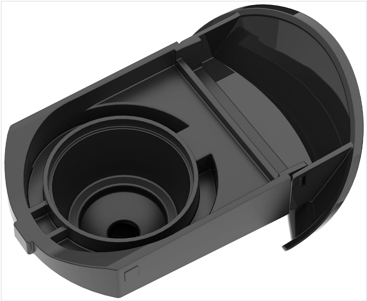
Image: A detailed view of the KOTLIE EM-308A capsule adapter, highlighting its design for proper insertion into the coffee machine.