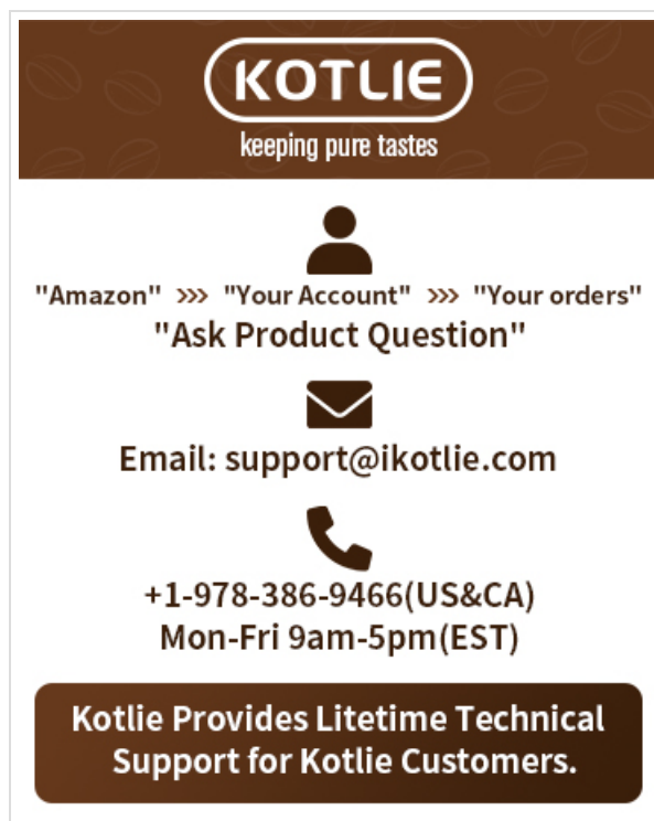
Image: KOTLIE customer support information, including email and phone number, for technical assistance.