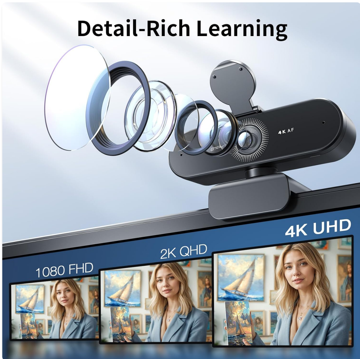
Image: Visual comparison of 4K UHD resolution from EMEET NOVA against lower resolutions, highlighting detail-rich learning capabilities.