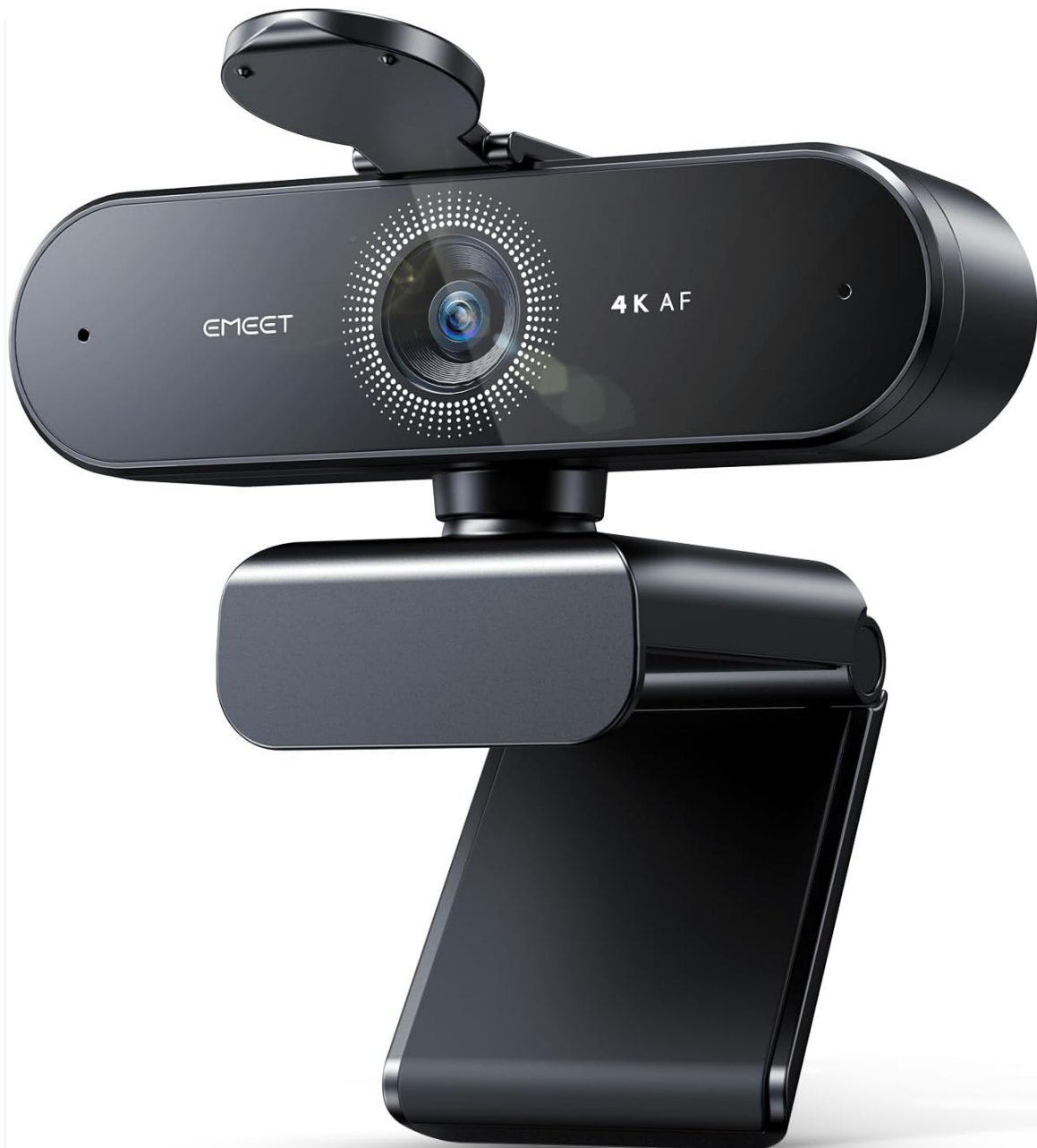
Image: The EMEET NOVA 4K PDAF Autofocus Webcam and Luna Speakerphone, showcasing its sleek design and compact form factor.