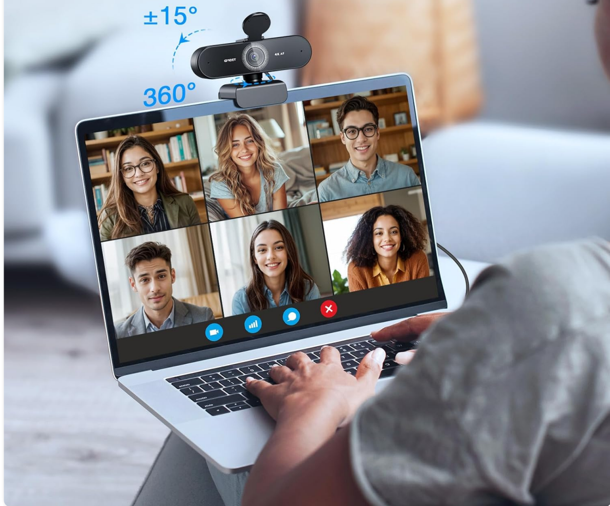
Image: The EMEET NOVA webcam demonstrating its flexible design with 360-degree horizontal rotation and 15-degree vertical adjustment.