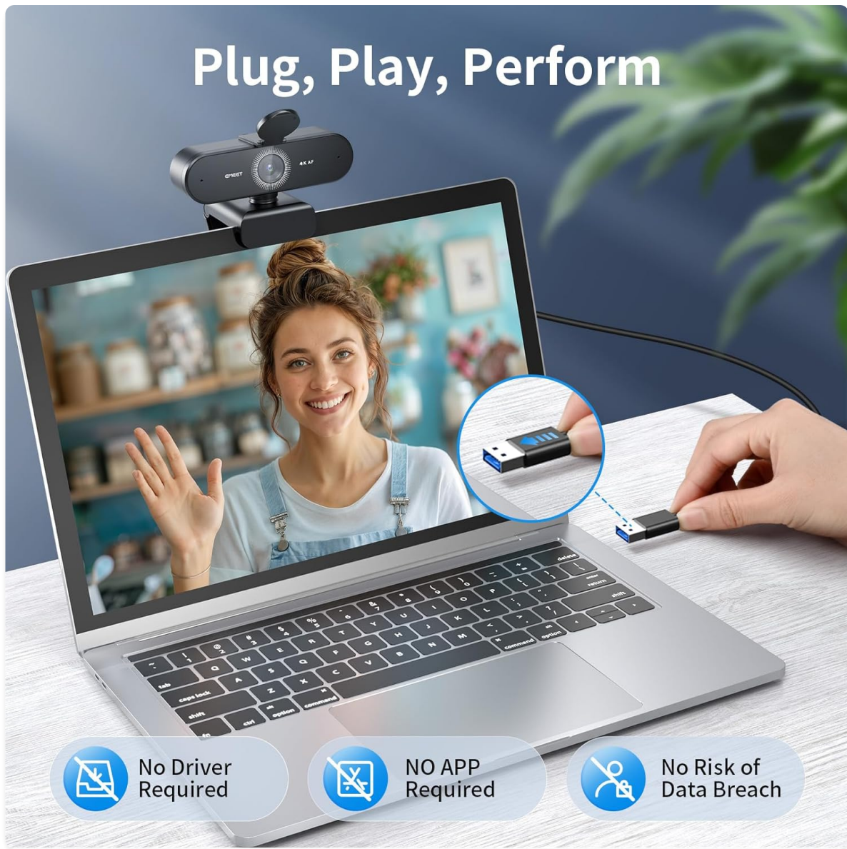
Image: The EMEET NOVA webcam connected to a laptop, illustrating its plug-and-play setup without requiring drivers or apps.