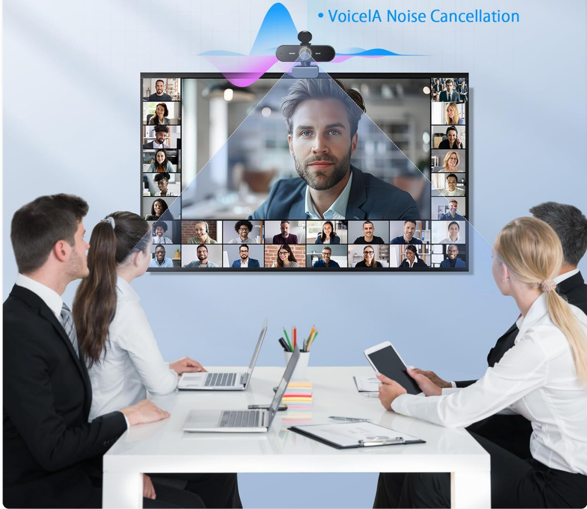
Image: The EMEET NOVA webcam in a meeting environment, emphasizing clear communication with VoicelA Noise Cancellation.