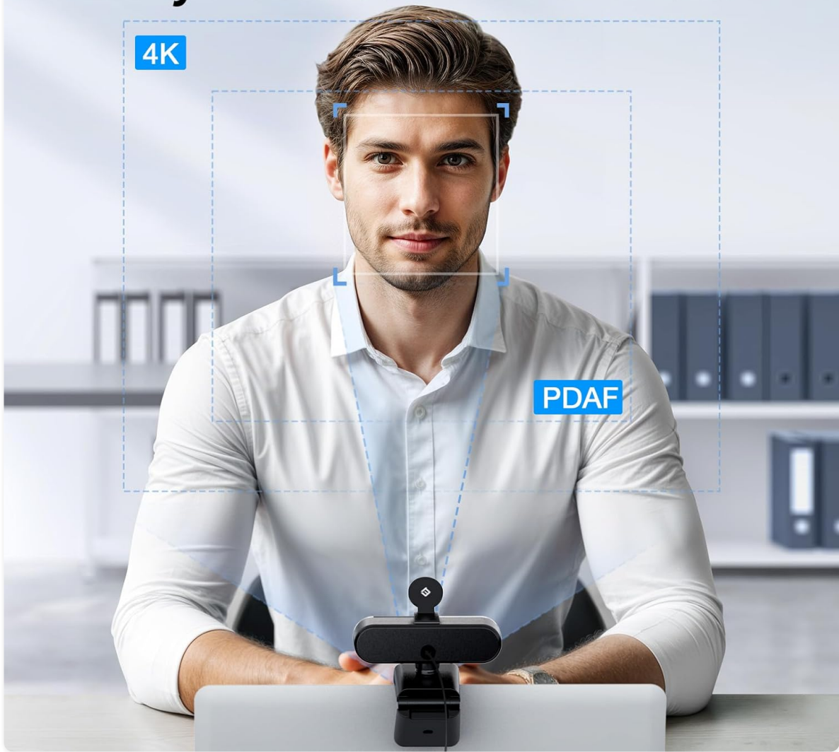
Image: The EMEET NOVA webcam in action during a video conference, illustrating its precise PDAF autofocus for clear visuals.