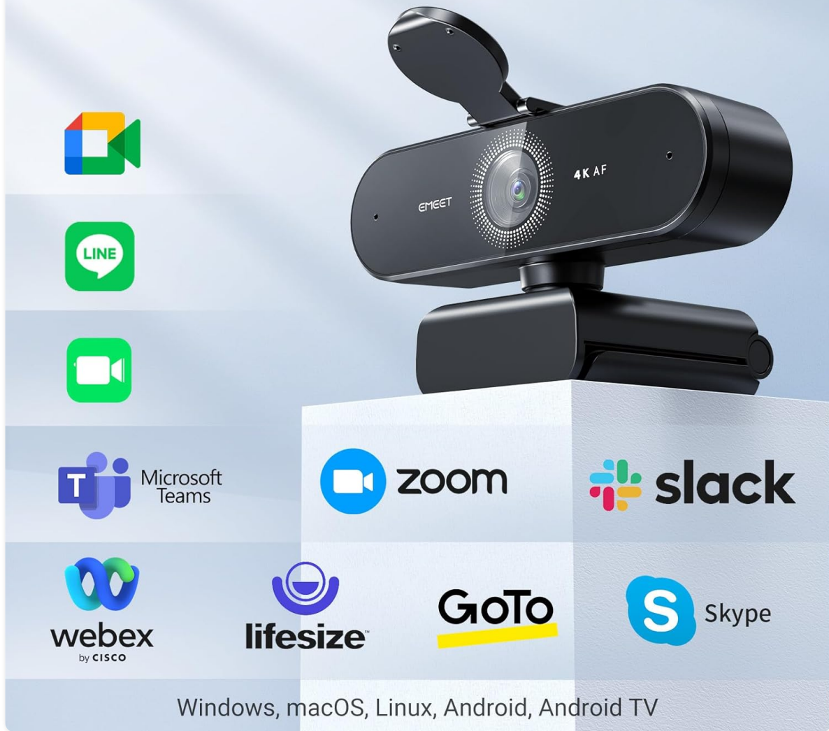
Image: The EMEET NOVA webcam highlighting its universal compatibility with platforms like Zoom, Skype, Microsoft Teams, and operating systems including Windows and macOS.