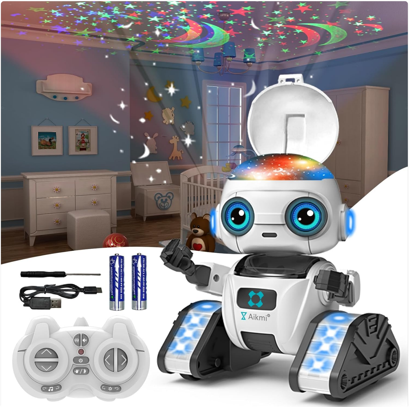
The Aikmi Robot Toy in a child's room, demonstrating its star and moon projection feature, along with its remote control and accessories.