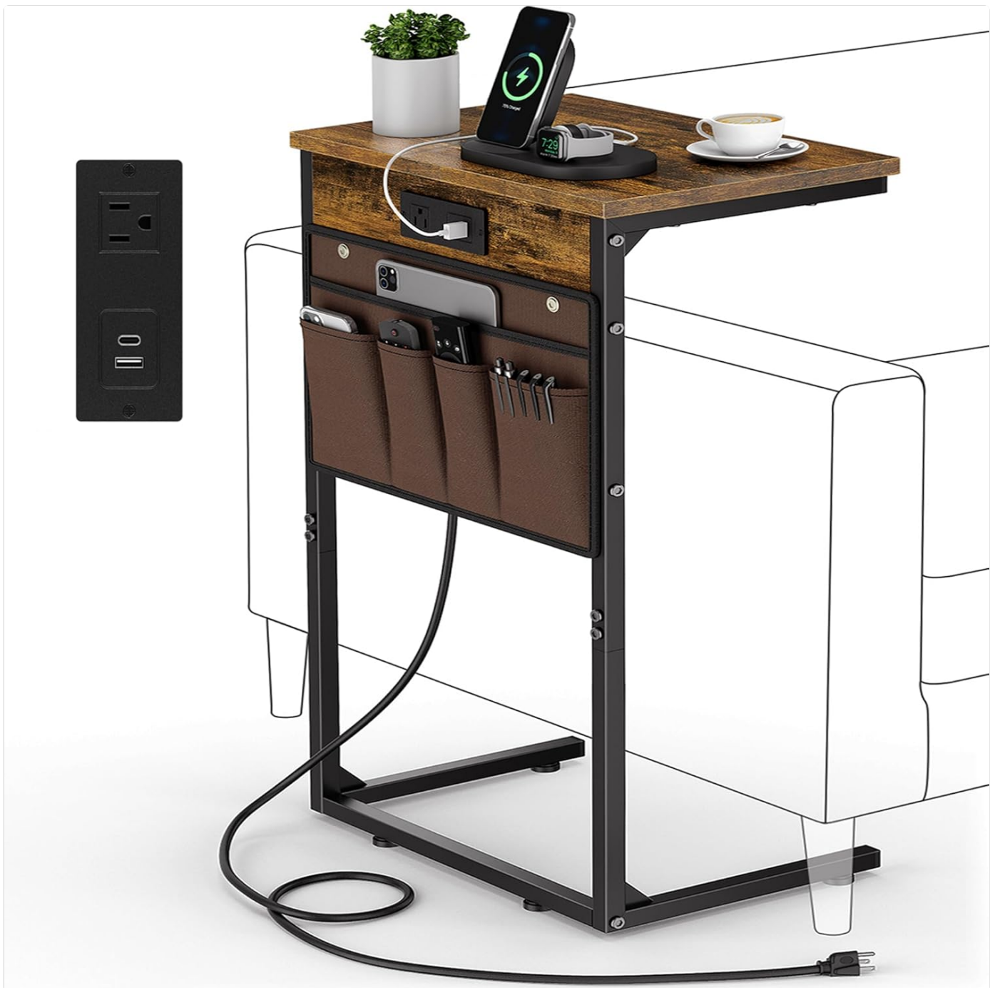
Image 1.1: The Vagusicc C Shaped End Table, showcasing its design, integrated charging station, and side storage pockets.