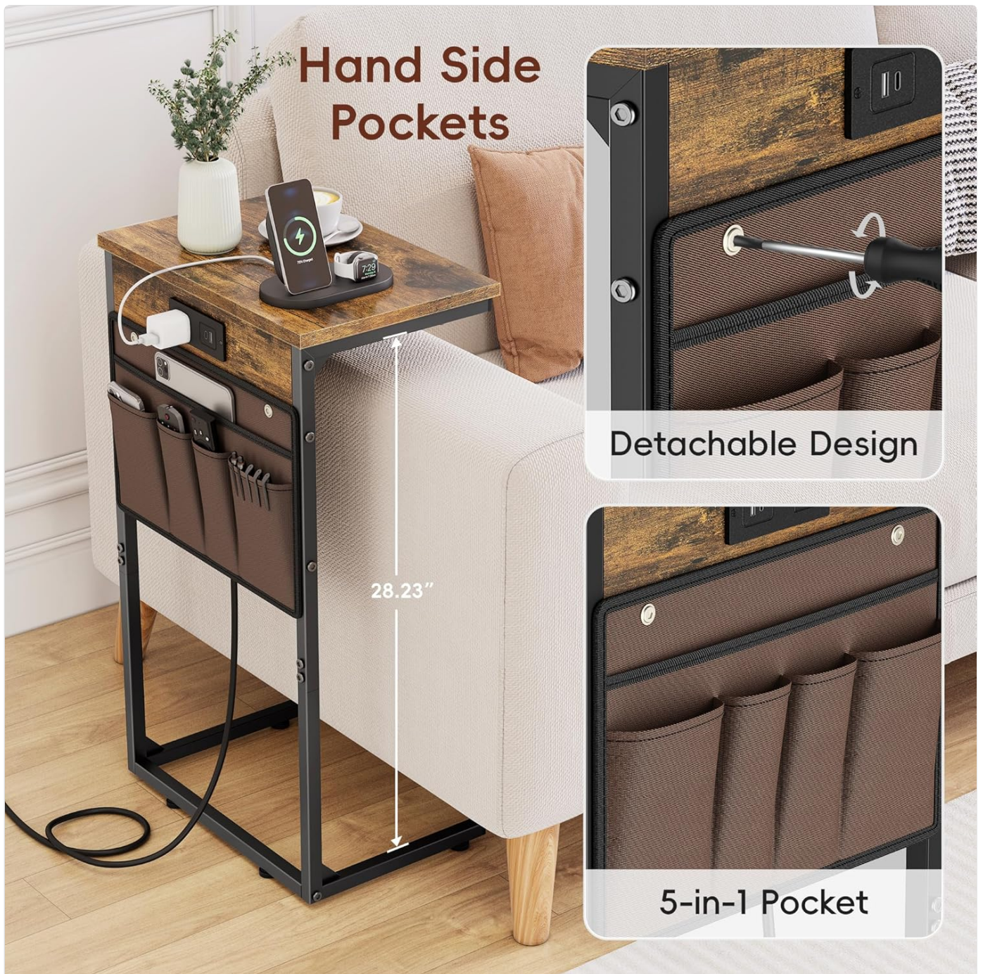
Image 5.3: The side storage pockets, demonstrating their capacity and detachable design.