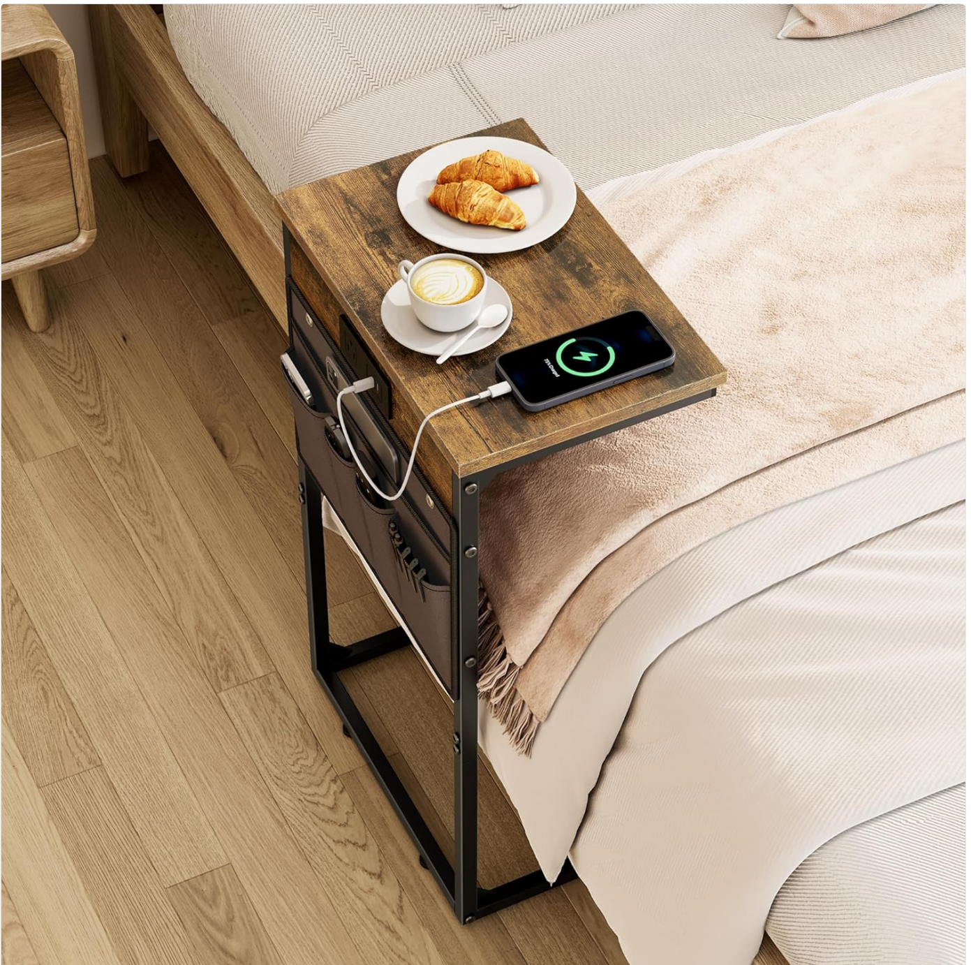
Image 5.4: The table serving as a bedside companion, highlighting its adaptability.