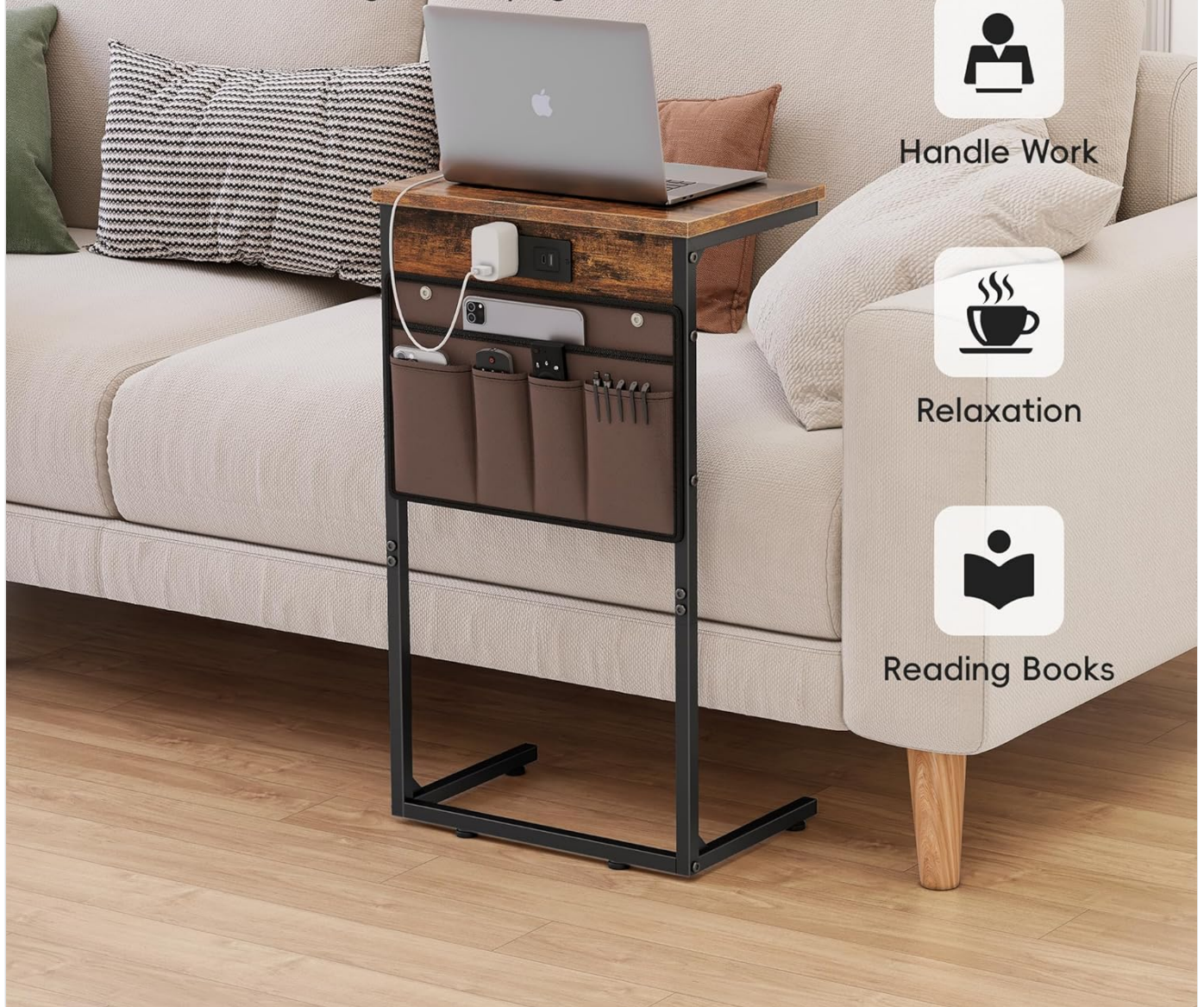
Image 5.1: The table positioned under a sofa, demonstrating its utility for working or relaxing.

Slide it under the sofa for convenient working or studying.