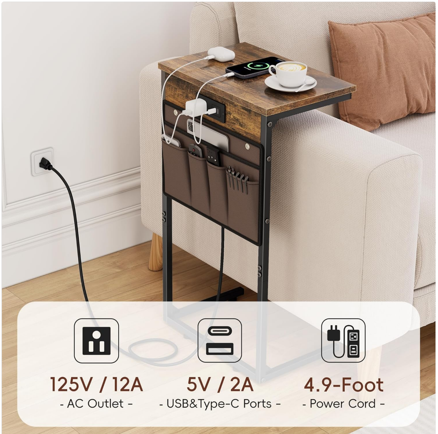
Image 5.2: Detailed view of the charging station, highlighting the various power outlets and USB ports.