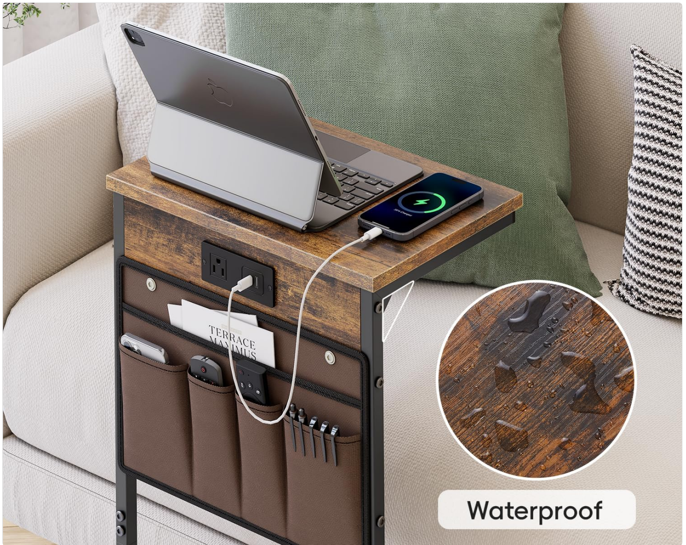
Image 6.1: Close-up showing the waterproof surface of the table, simplifying maintenance.