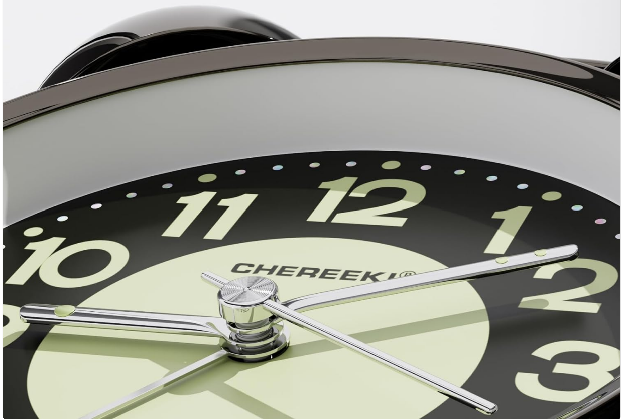
Figure 6: Large and clear numbers for easy time reading.