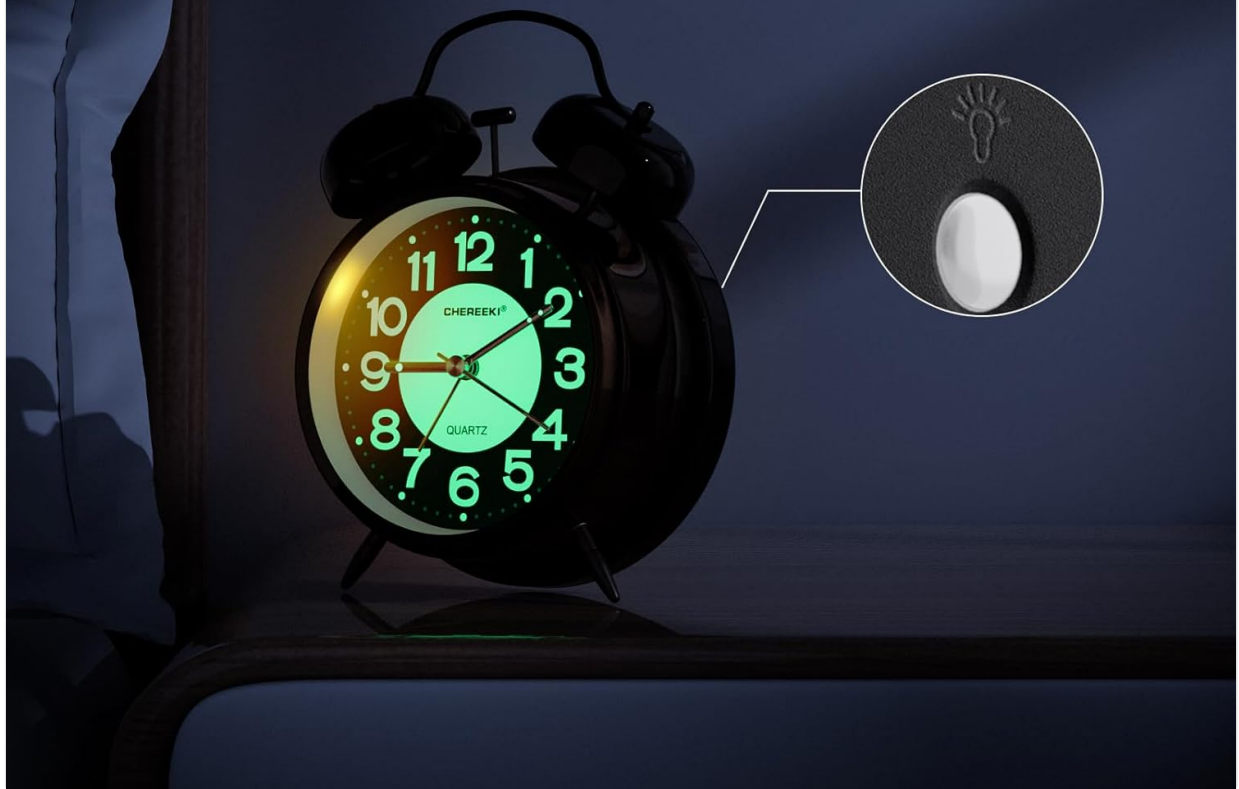
Figure 4: Enjoy a peaceful and quiet environment with the silent non-ticking movement.

You can see the time clearly at night with the light