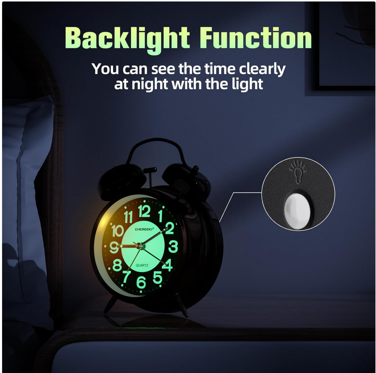
Figure 2: The alarm clock's backlight function provides temporary illumination.