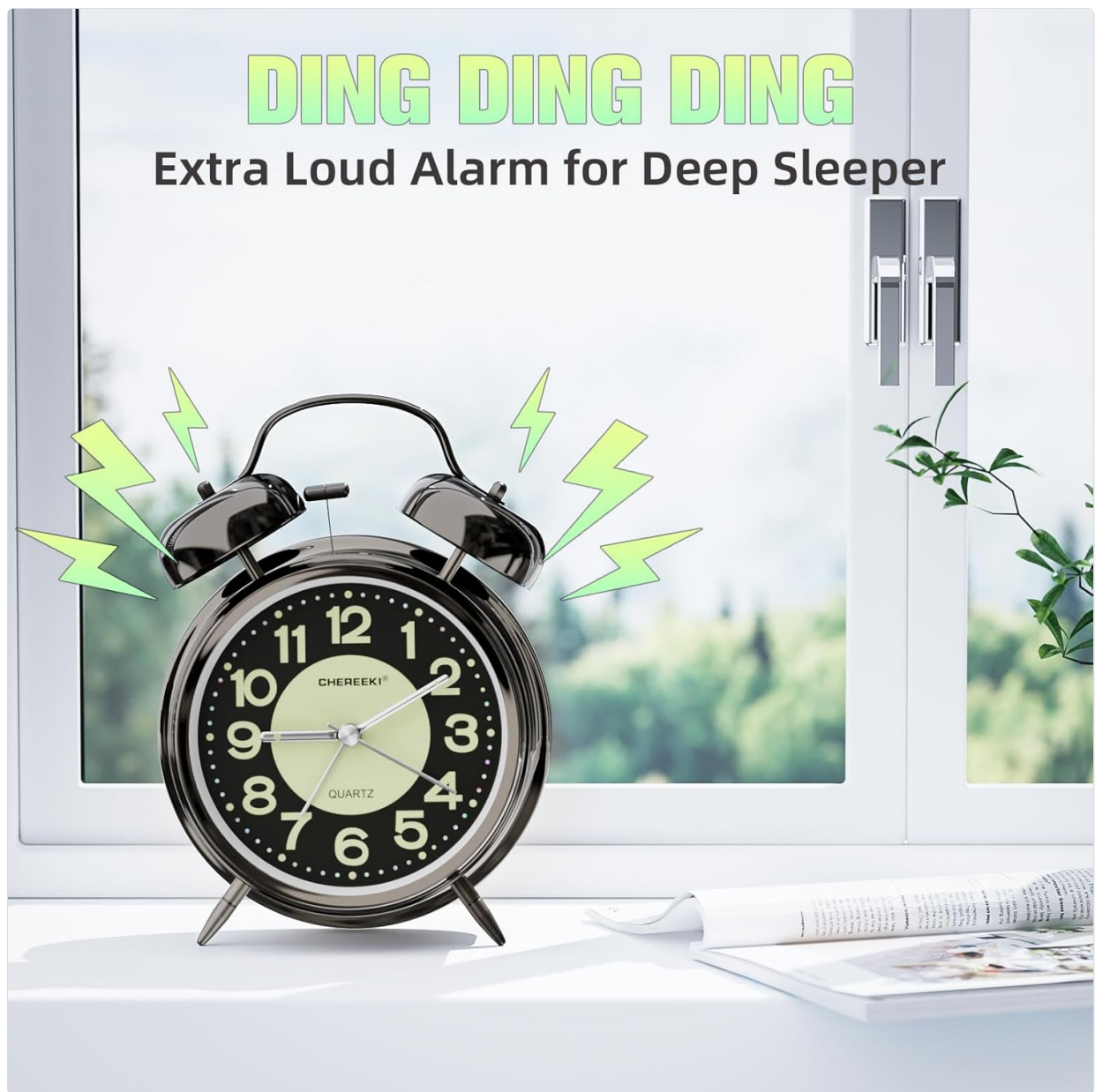
Figure 3: The twin-bell design ensures a super loud alarm.