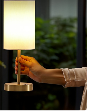
Image: Visual representation of the three brightness levels.

Portable and cordless Lightweight and space-saving