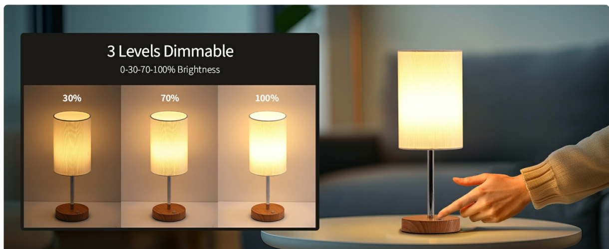
Image: KDG Simple Cordless Table Lamp, emphasizing its portable and cordless design.

This manual provides detailed instructions for the safe and efficient use of your KDG Simple Cordless Table Lamp. This portable LED desk lamp features a built-in 5000mAh rechargeable battery, three brightness levels, and a linen lampshade, making it suitable for various indoor settings. Please read this manual thoroughly before operating the device and retain it for future reference.