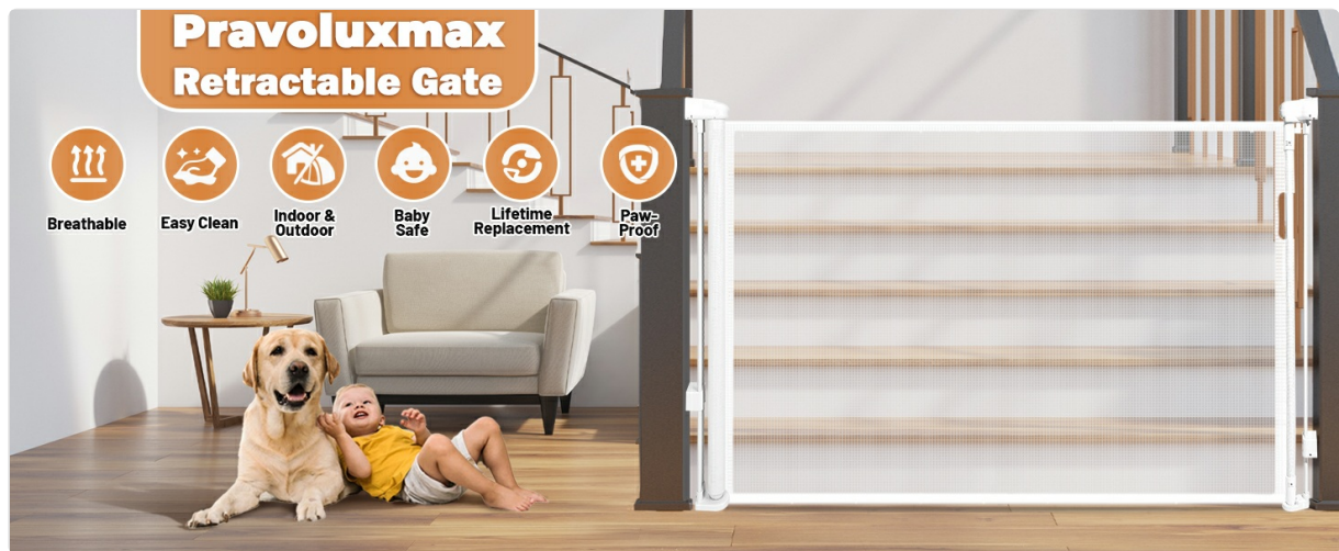
Figure 1: Pravoluxmax Retractable Gate in use, securing an area for a baby and a dog.

This gate is suitable for doorways, hallways, and the top or bottom of stairs, for both indoor and outdoor use. It features a no-threshold design to minimize tripping hazards.