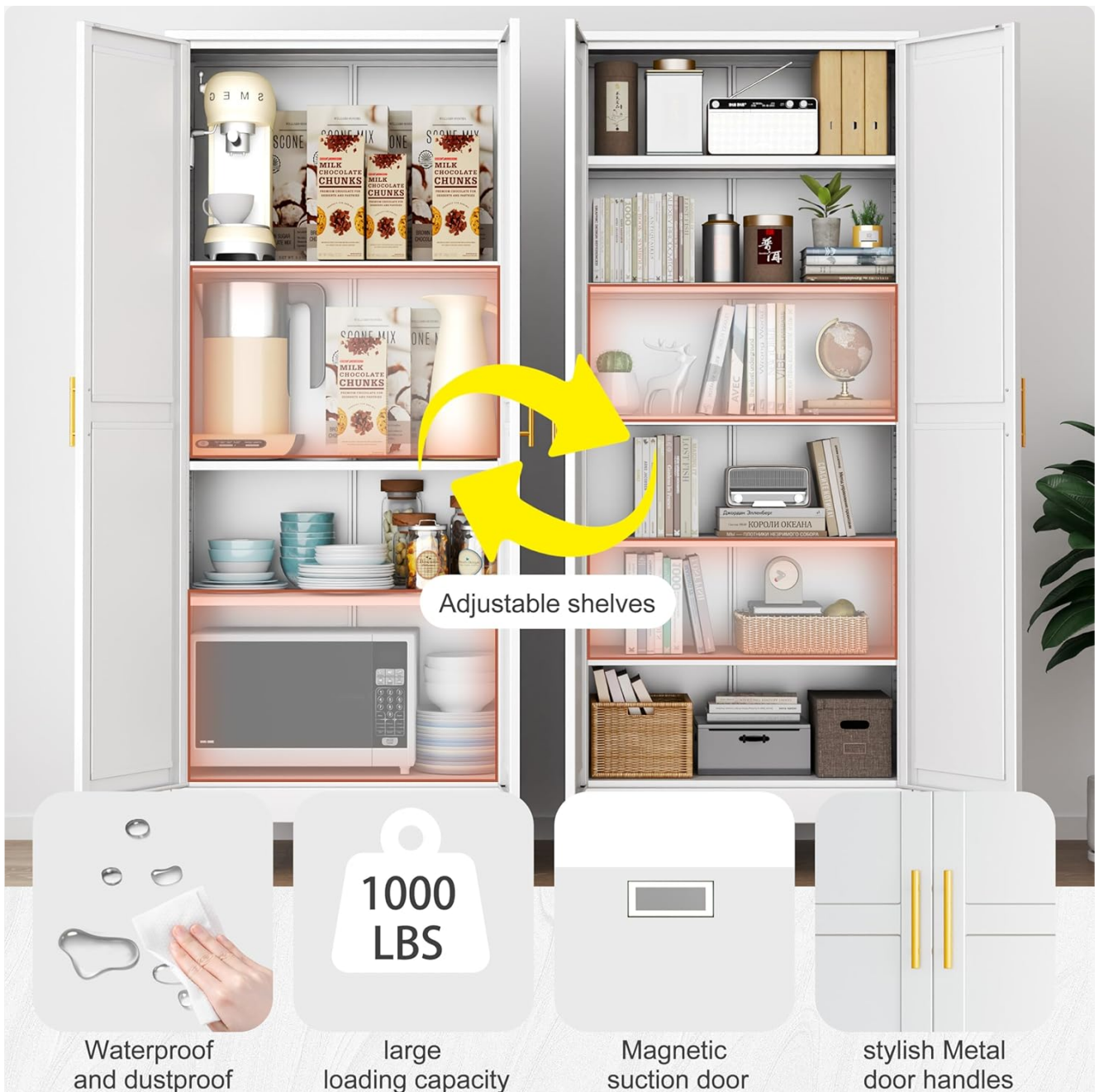
Image 4.1: Illustration of adjustable shelves and other key features like magnetic door closure.