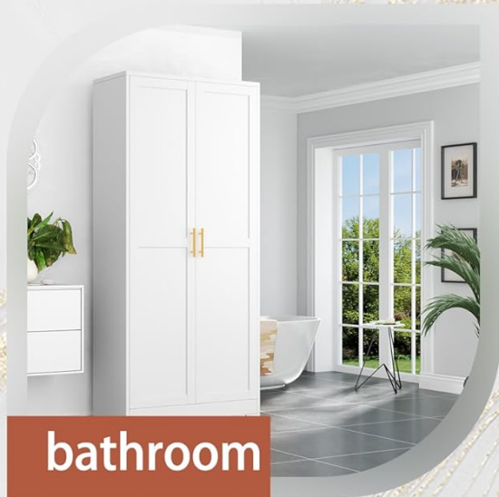
Image 4.2: Examples of the cabinet's multifunctional use in various home and work environments.