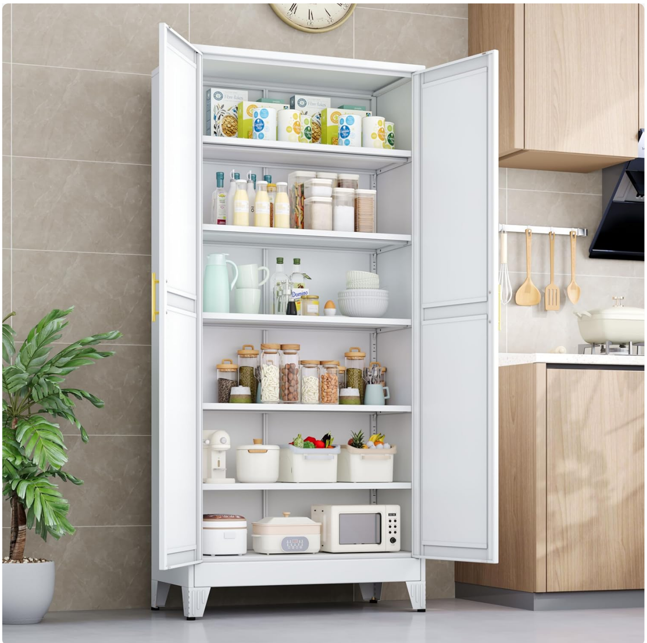
Image 1.1: The PAOFIN Kitchen Pantry Storage Cabinet, showcasing its spacious interior and adjustable shelves filled with pantry items.