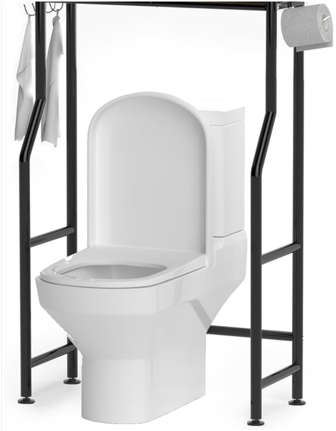
Image 1: The GloTika 3-Tier Over The Toilet Storage Shelf, showcasing its three shelves and overall design.