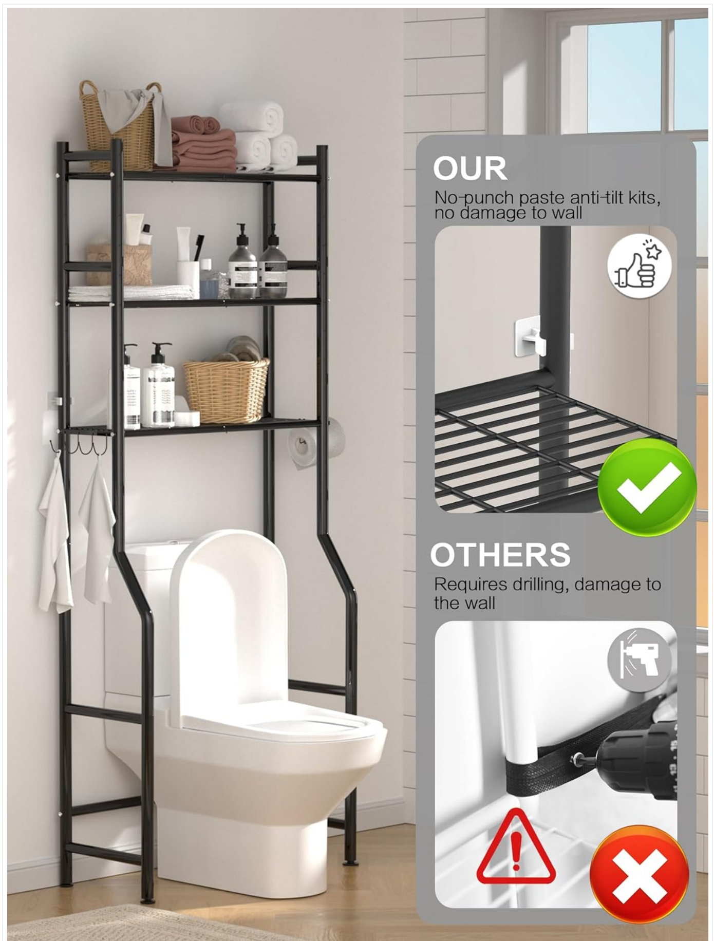
Image 4: Illustration of the no-punch anti-tilt kits for easy and damage-free wall attachment.