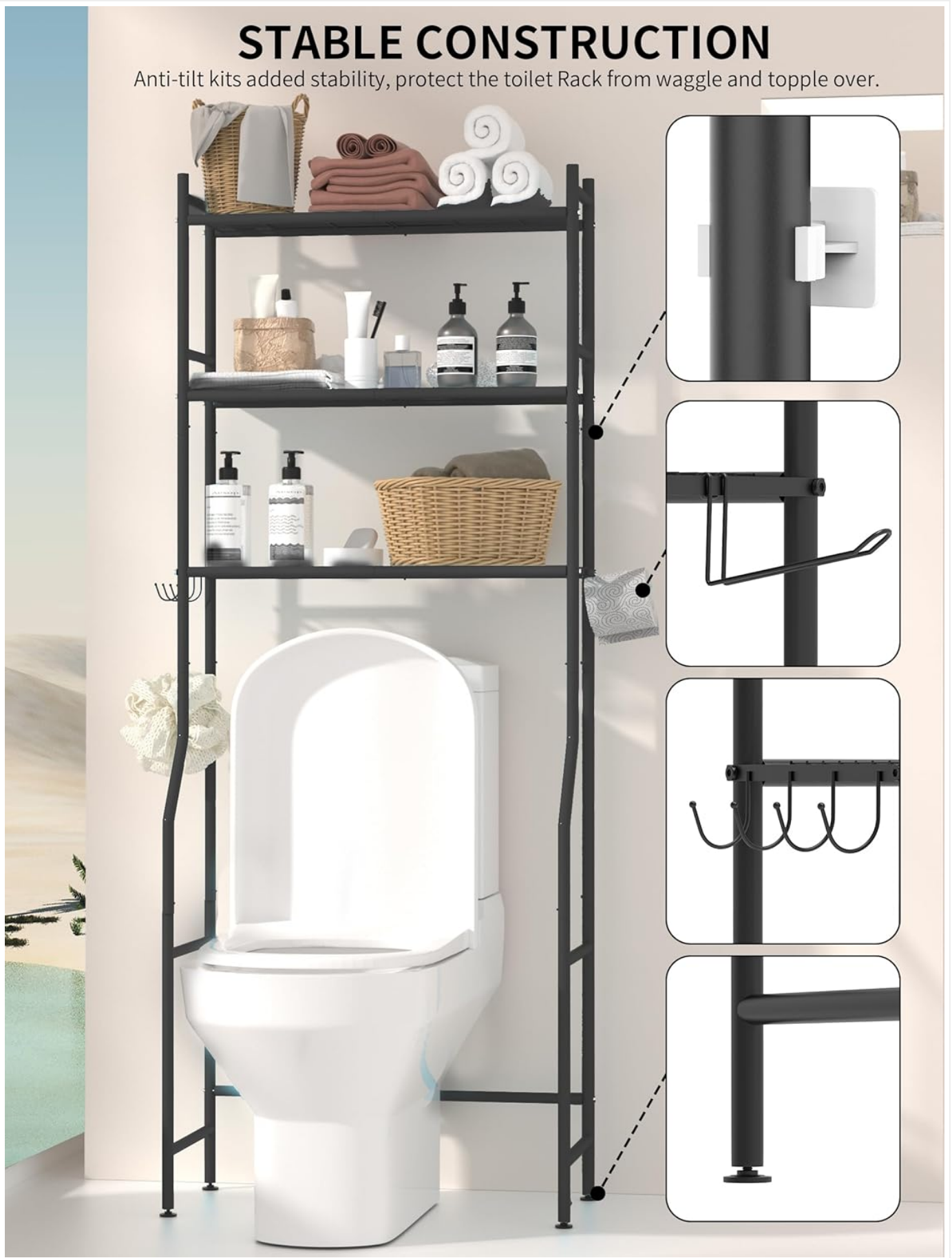
Image 2: Detail of the stable construction, highlighting the anti-tilt kits, integrated toilet paper holder, and side hooks.

Anti-tilt kits added stability, protect the toilet Rack from wobble and topple over.