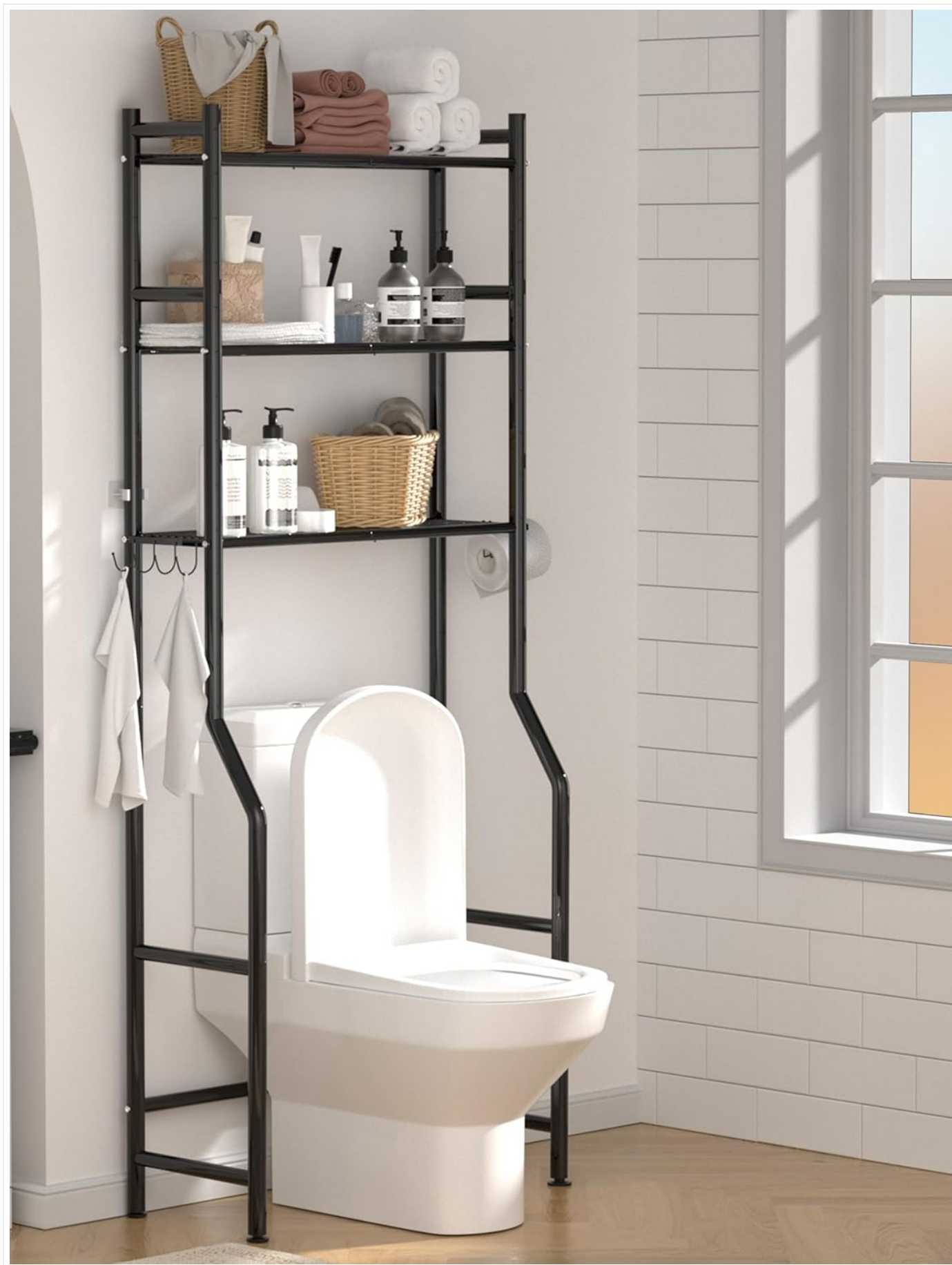
Image 5: The storage shelf in a typical bathroom environment, demonstrating its capacity for organization.