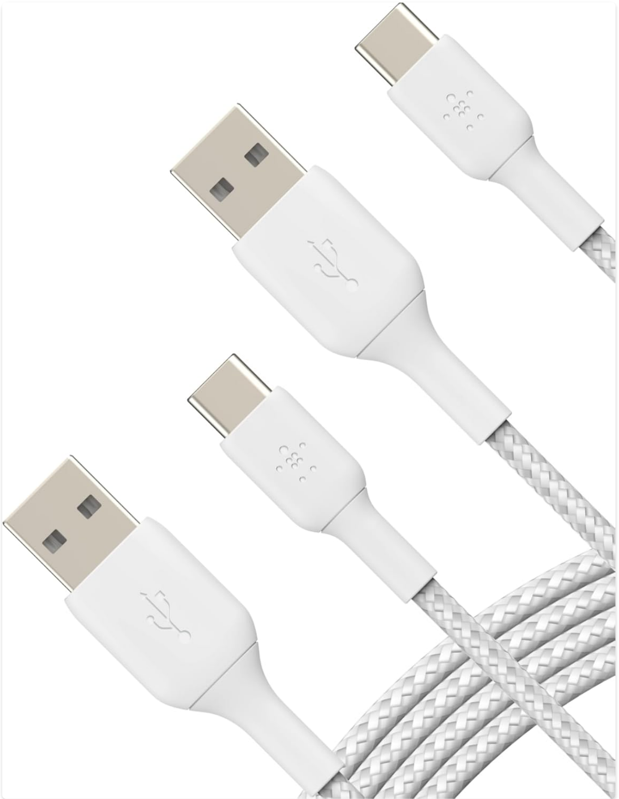
Image: Two white braided USB-C to USB-A cables, illustrating the product included in the package.