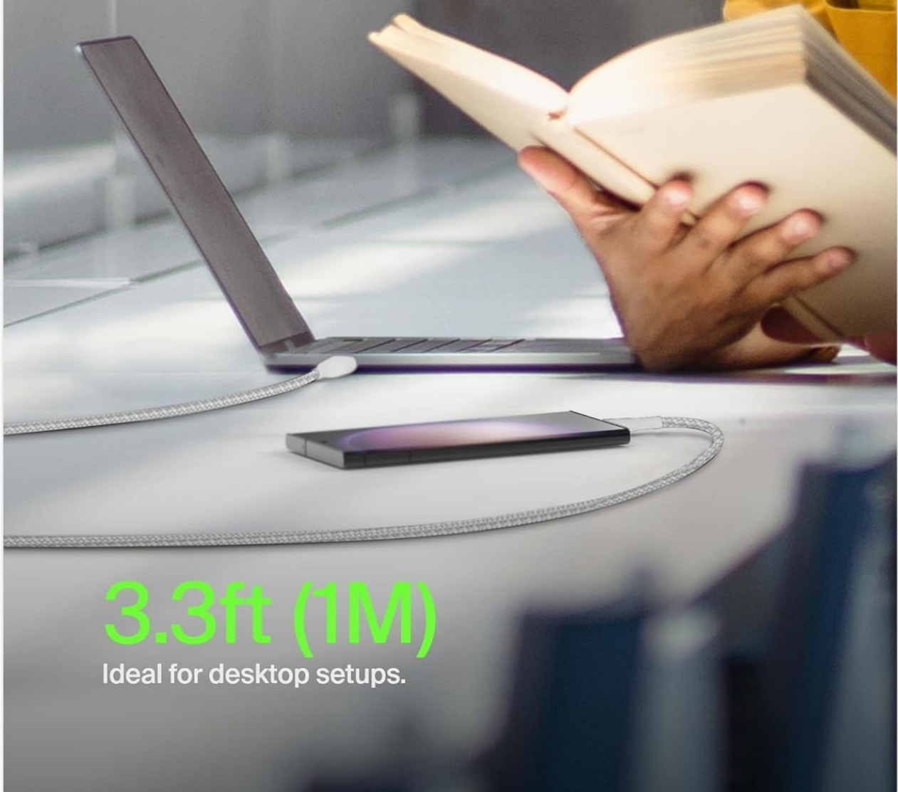
Image: A person using a laptop with a phone connected via the 3.3ft (1M) cable, demonstrating typical usage scenarios.