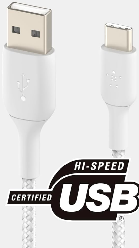
Image: Close-up of the USB-A and USB-C connectors, featuring the 'USB-IF Certified' and 'Hi-Speed USB' logos, indicating compliance with industry standards.

USB-IF certified cables ensure fast, safe charging and reliable data transfers. Protect your devices.