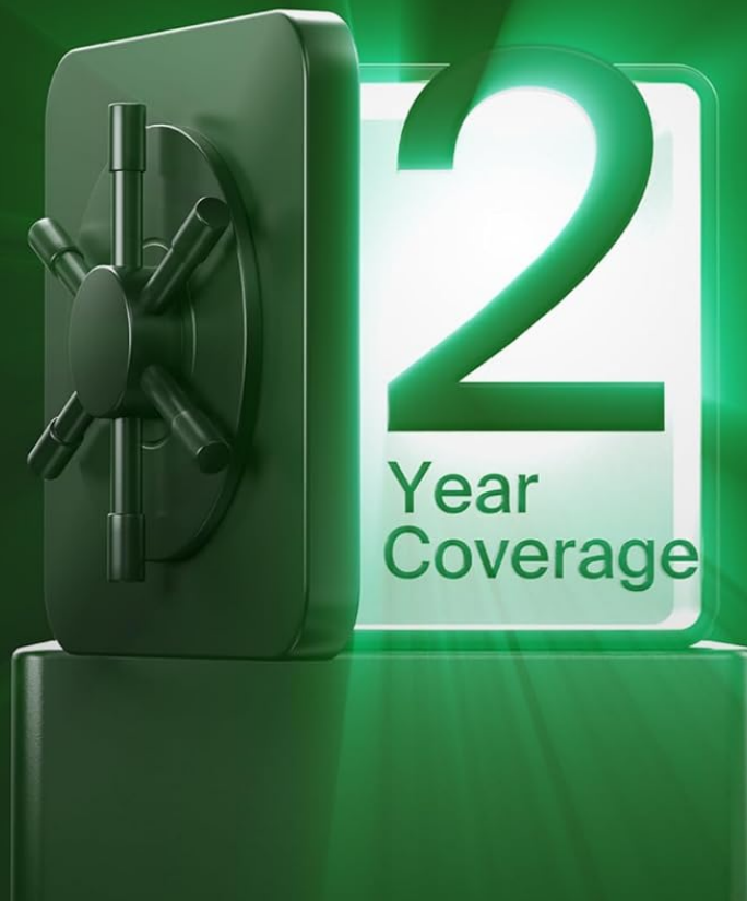
Image: A graphic representing product protection, featuring a safe and text indicating '2 Year Coverage' and 'Designed in California', emphasizing product quality and support.

Designed in California. Built for quality.