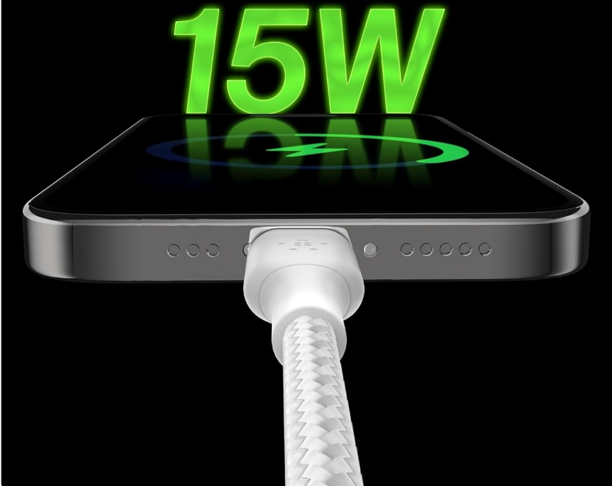
Image: A smartphone connected to the cable, displaying '15W Charging' and '480 Mbps Data Transfer' capabilities.