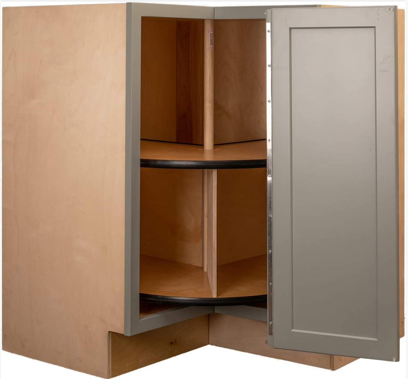
Image Description: An assembled Quicklock base kitchen cabinet with the door open, revealing two circular Lazy Susan shelves inside. The cabinet features a Magnetic Gray shaker style door and natural birch plywood interior.

5. Install Toe Kick/Legs: Attach the toe kick or adjustable legs to the bottom of the cabinet as per the design.