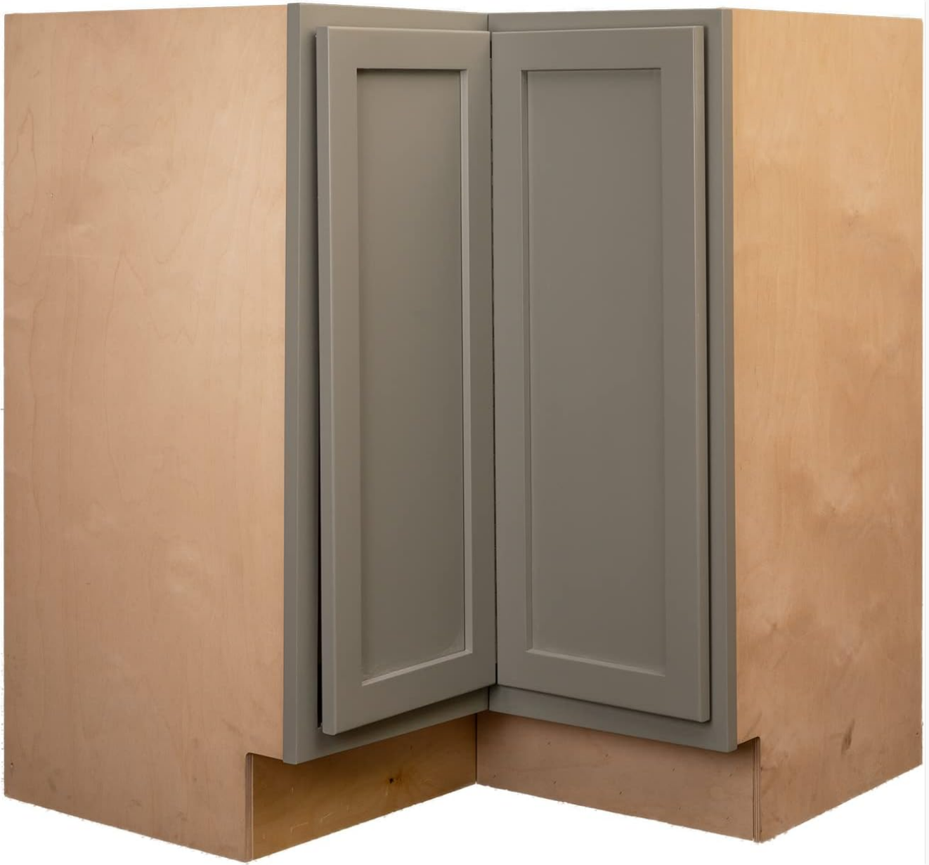
Image Description: An assembled Quicklock base kitchen cabinet with its Magnetic Gray shaker style doors closed, showcasing the corner unit design.