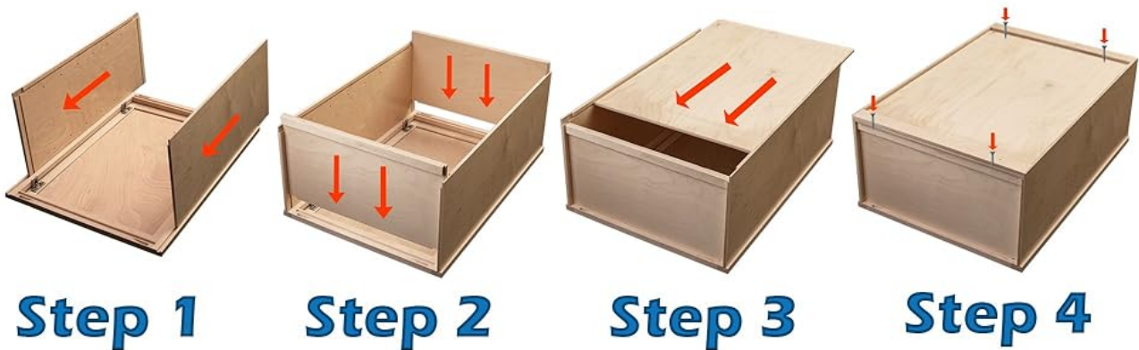
Image Description: A four-step diagram illustrating the Quicklock cabinet assembly process. Step 1 shows side panels attaching to the base. Step 2 shows the back panel being inserted. Step 3 depicts the top supports being placed. Step 4 shows the final securing of components with screws.