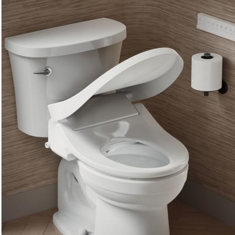
Image: The Kohler PureWash E815 Bidet Toilet Seat shown installed on a standard toilet, demonstrating its fit and appearance.