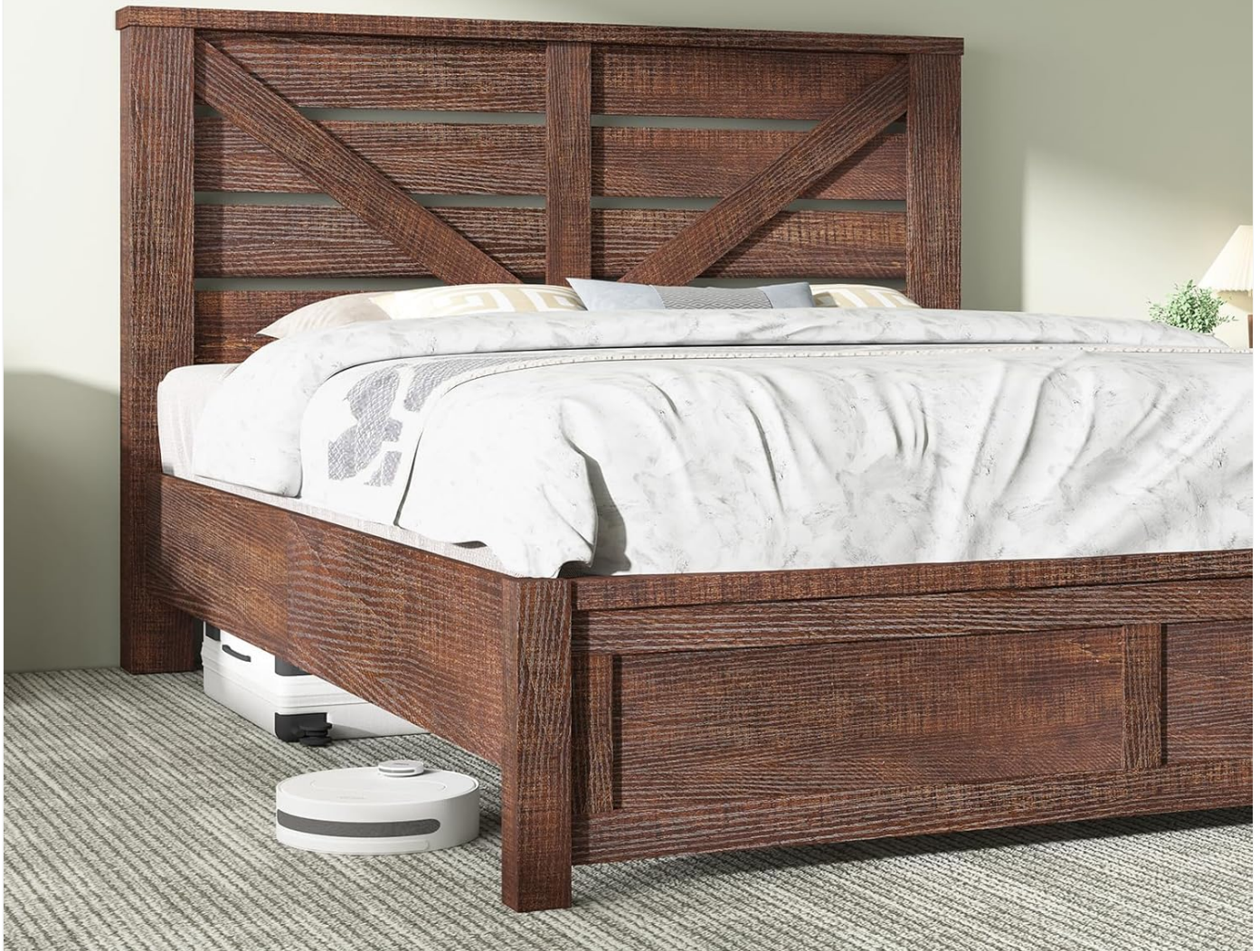
Image: The AMERLIFE bed frame in a bedroom setting, showcasing the generous under-bed storage space, with a robot vacuum cleaner visible underneath.