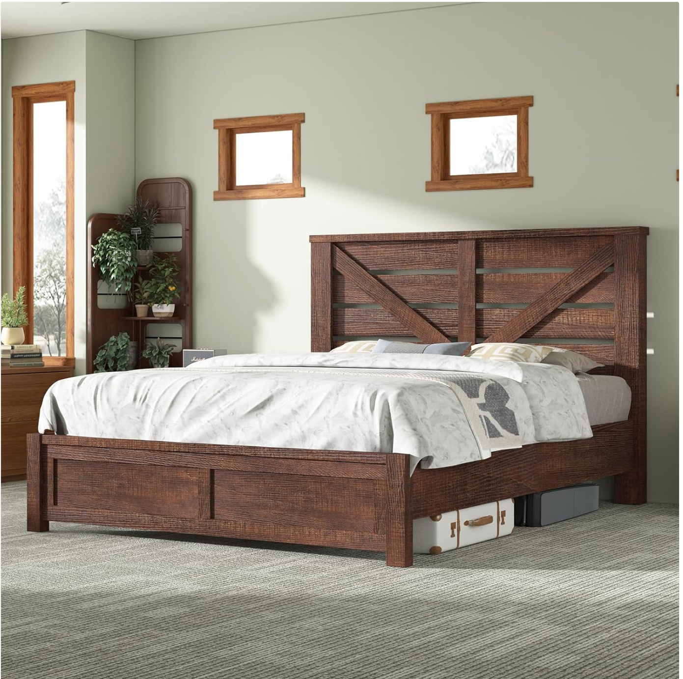
Image: The AMERLIFE Full Size Farmhouse Bed Frame in Reclaimed Barnwood, showcasing its overall design and aesthetic.