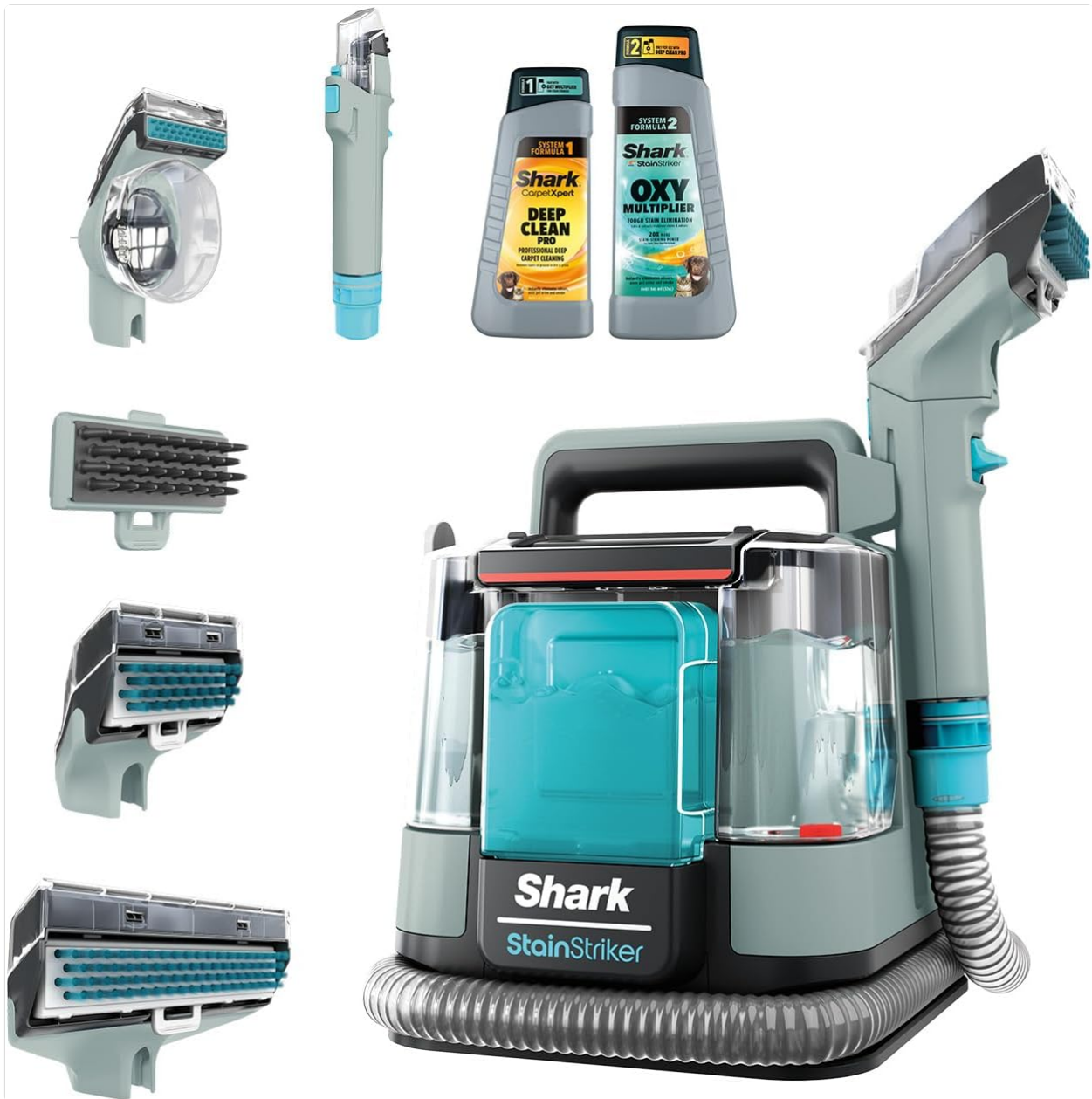
Image 2.1: The Shark StainStriker PX200EUCP with its various attachments and cleaning solutions.