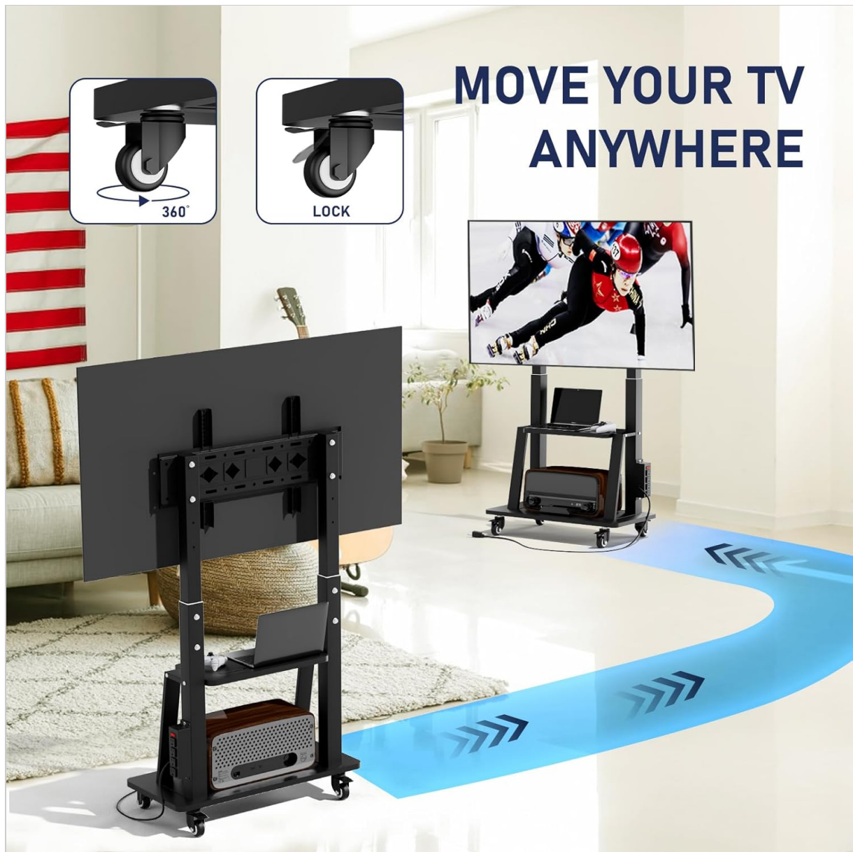
Image: Caster mobility and lock. This image illustrates the functionality of the TV stand's casters, showing both the 360-degree rotation for easy movement and the locking mechanism to secure the stand in place.