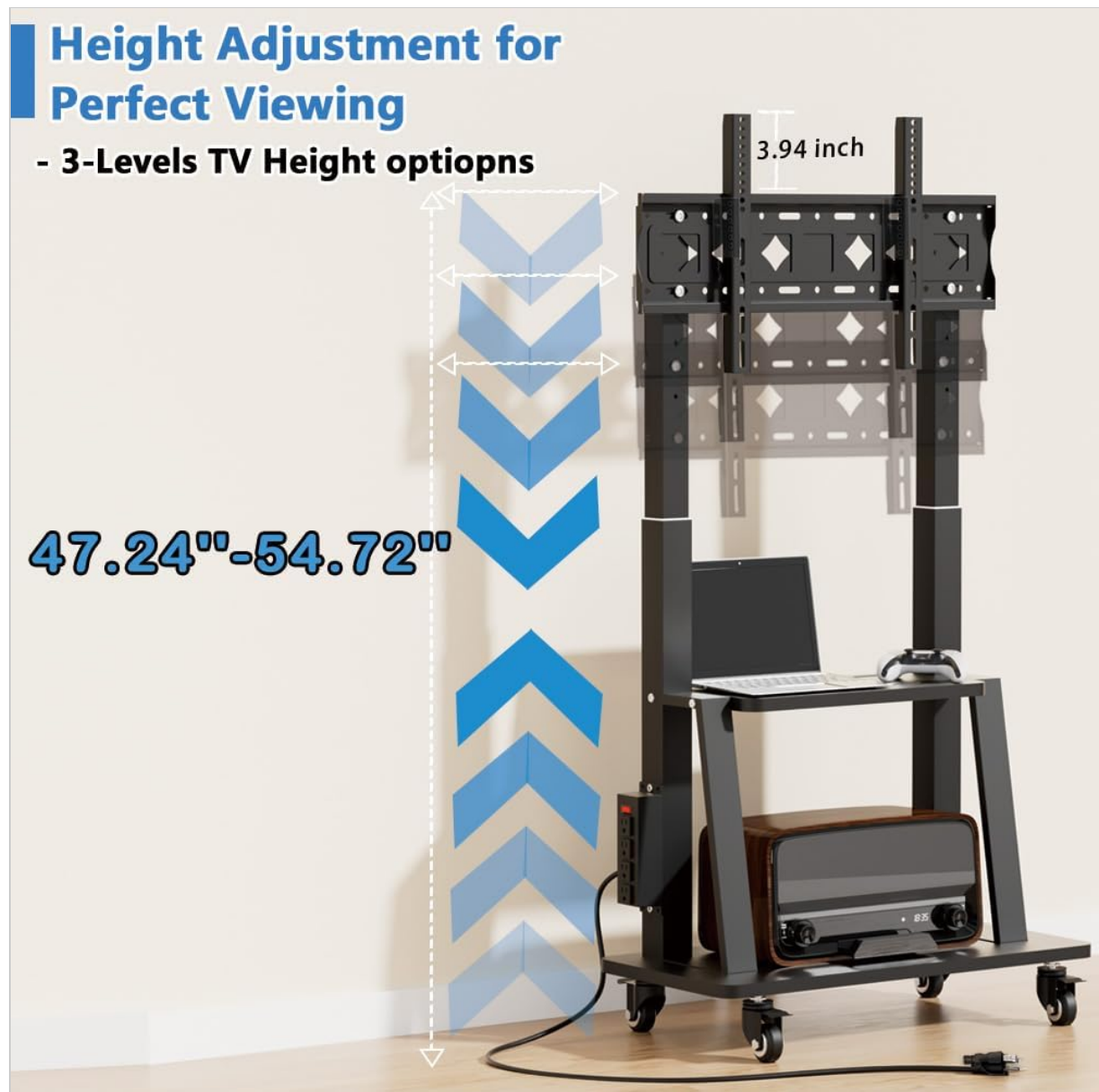
Image: Height adjustment range. This diagram shows the TV stand's adjustable height feature, indicating a range from approximately 47.24 inches to 54.72 inches (note: product description states 53-59 inches, refer to product specifications for exact range), allowing for customized viewing levels.

The TV cart allows for height adjustment to achieve optimal viewing. The stand is adjustable with height from 53 inches to 59 inches. To adjust the height, loosen the locking mechanisms on the vertical columns, carefully raise or lower the TV to the desired position, and then securely tighten the locking mechanisms.