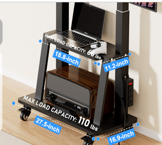
Image: Dual-tier steel shelves. This image displays the two steel shelves, indicating their dimensions (e.g., 18.8-inch width for the upper shelf, 27.5-inch width for the lower shelf) and their respective maximum load capacities: 66 lbs for the upper shelf and 110 lbs for the lower shelf, suitable for various entertainment equipment.