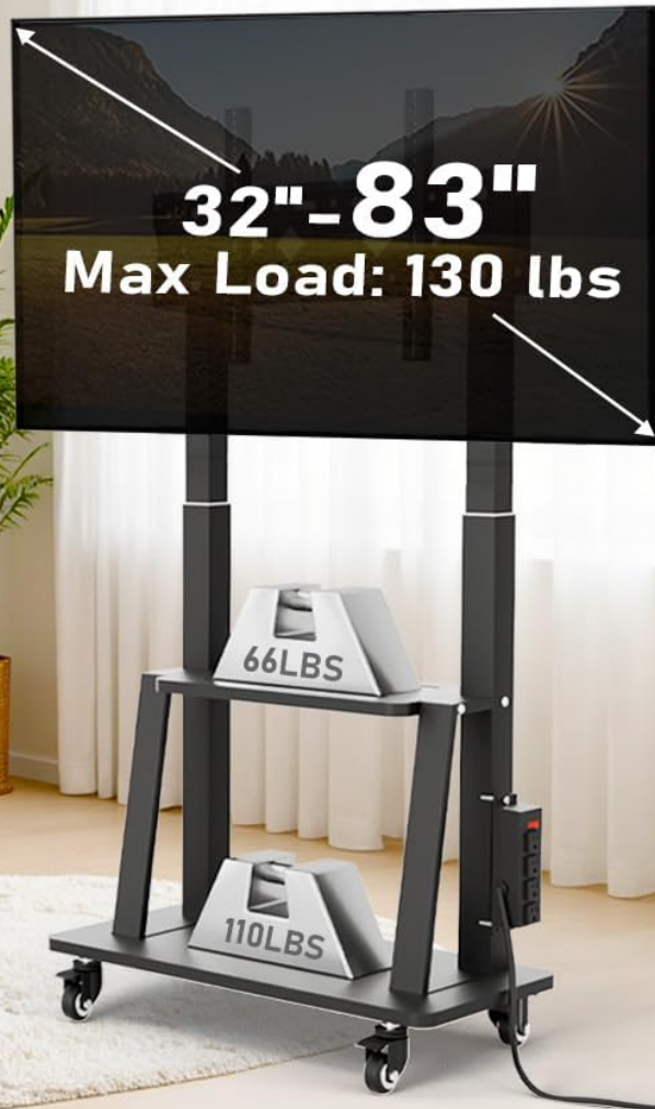
Image: VESA compatibility and maximum load capacity. This image illustrates the various VESA mounting patterns supported by the TV cart, ranging from 100x100mm to 600x400mm, and highlights the maximum TV load of 130 lbs for TVs between 32 and 83 inches.

VESA refers to the distance between the 4 screw holes on the back of the TV set.