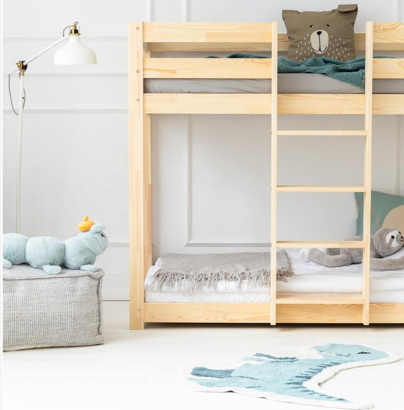
Image: The ADEKO CLPN 70x140 Wooden Bunk Bed, fully assembled, showcasing its natural wood finish and house-like structure in a bright children's room.