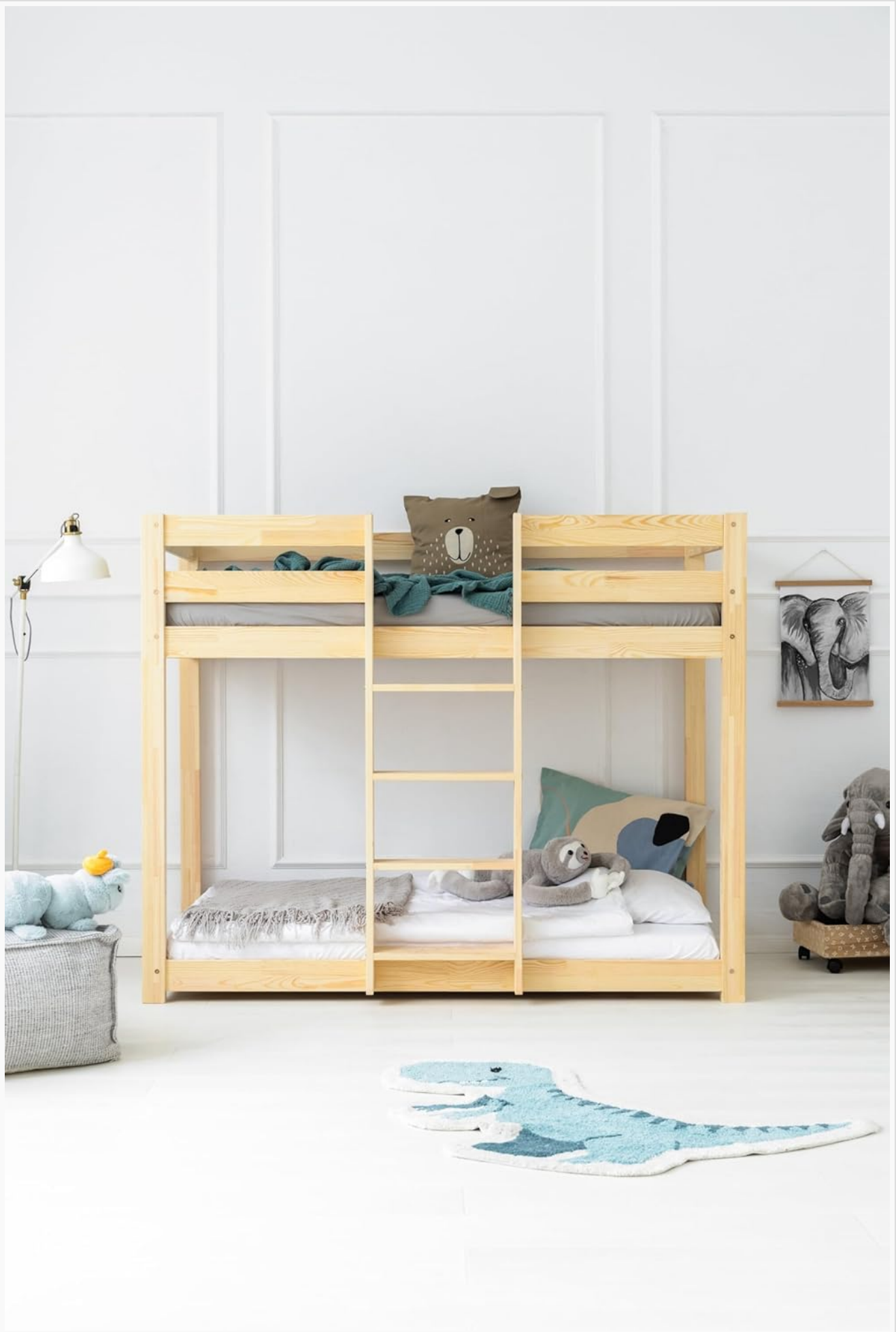
Image: The ADEKO CLPN 70x140 Wooden Bunk Bed, set up with mattresses, bedding, and decorative elements, illustrating its use in a child's bedroom.