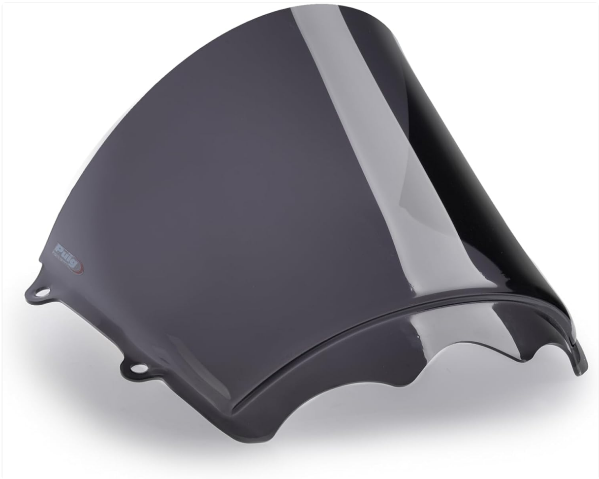
Figure 1: The Puig R-Racer Screen in dark smoke finish. This image shows the standalone windshield, highlighting its curved design and mounting points.