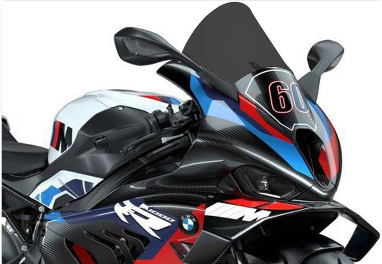
Figure 2: The Puig R-Racer Screen mounted on a BMW M1000RR. This image illustrates the screen's integration with the motorcycle's fairing, showing its aerodynamic profile.

Note: If you are unsure about any step, it is recommended to consult a professional motorcycle mechanic.